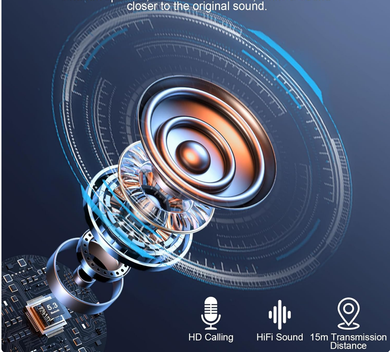
Image: A detailed diagram illustrating the internal components of the lukg BK07 earbud speaker, emphasizing the 14.2mm driver and nano-scale material for superior Hi-Fi stereo sound.

14.2mm speaker, nano-scale material, emits a sound closer to the original sound.