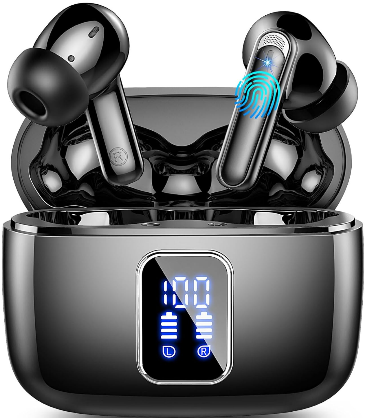
Image: The lukg BK07 Wireless Earbuds are shown inside their charging case, which features a digital LED display indicating battery percentages for both the case and individual earbuds.