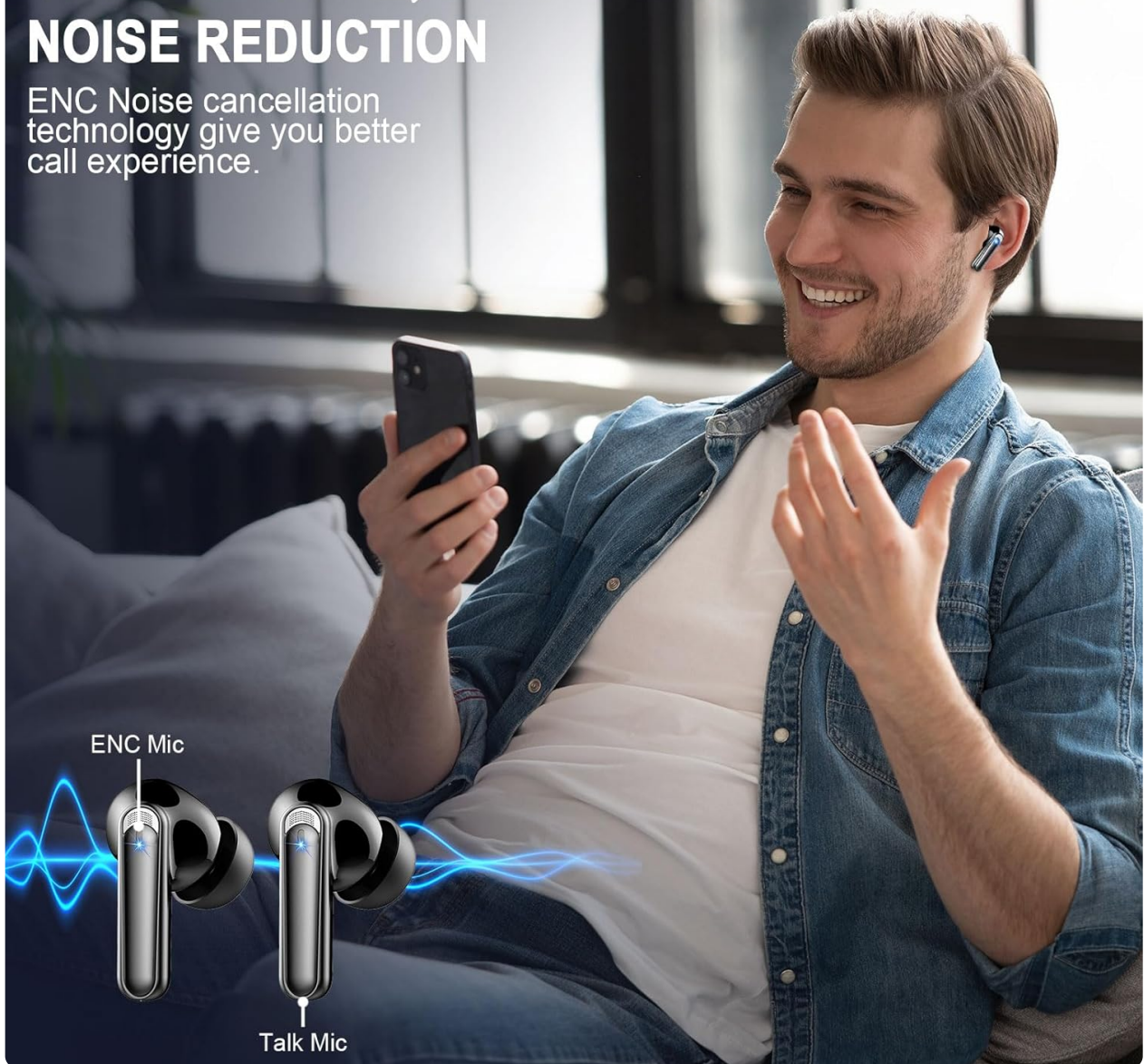
Image: A person is shown using the lukg BK07 earbuds during a phone call, with an overlay illustrating the 4 microphone ENC (Environmental Noise Cancelling) technology for clear communication.

ENC Noise cancellation technology give you better call experience.