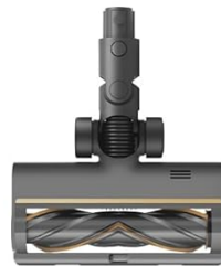
Illumination Multi-Surface Brush