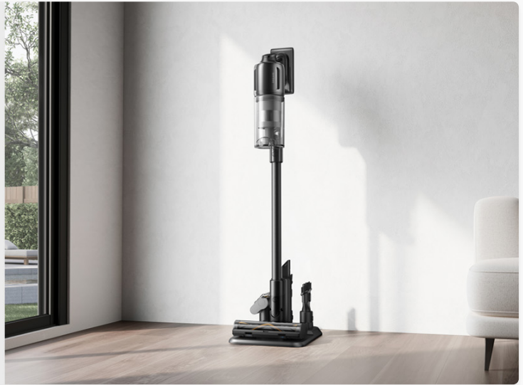
The DREAME Z30 Essential stored neatly on its wall-mounted charging station.

Including an accessory mount that keeps cleaning attachments neatly stored and instantly accessible, Z30 Essential streamlines your workflow and ensures tools are always within reach.