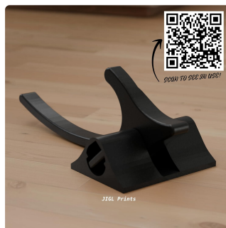
Figure 5: QR Code for Instructional Video. This QR code, found on the product packaging, links directly to the official usage video for convenient access.

Video: Official Usage Guide for Hip Flexor & Psoas Release Tool. This video demonstrates proper placement and breathing techniques for effective muscle release.