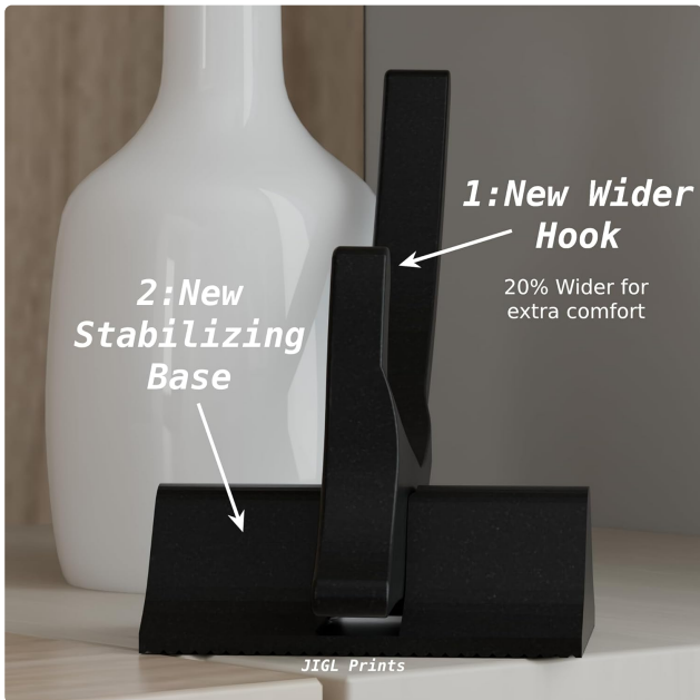
Figure 3: Enhanced Design Elements. The V2 features a New Wider Hook , which is 20% wider for extra comfort during use, and a New Stabilizing Base for increased stability under pressure.