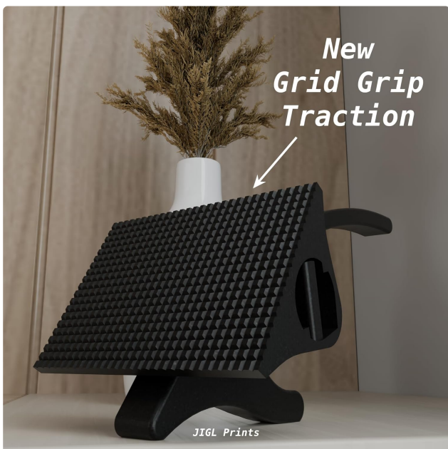
Figure 4: New Grid Grip Traction. The base of the tool is equipped with a textured grid pattern to provide enhanced grip and prevent slipping during use on various surfaces.