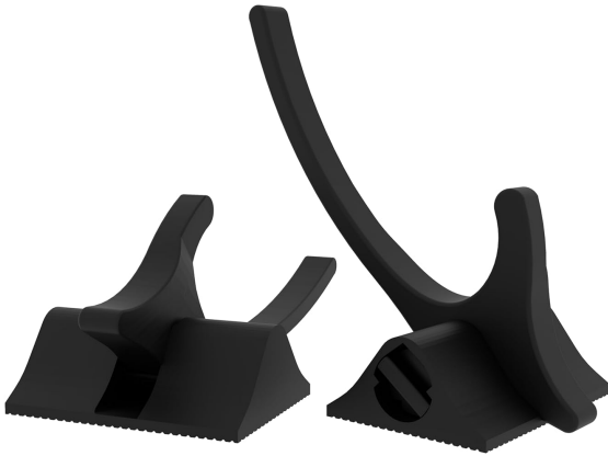
Figure 1: The Hip Flexor & Psoas Release Tool V2. This image displays the complete tool, highlighting its ergonomic design and robust structure, ready for use in myofascial release.