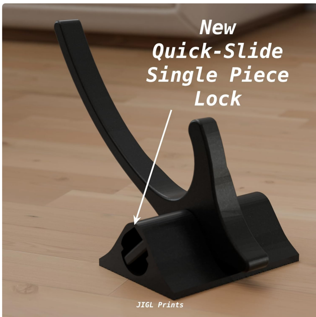
Figure 2: New Quick-Slide Single Piece Lock. This feature ensures secure and easy assembly, providing a stable platform for effective muscle release.