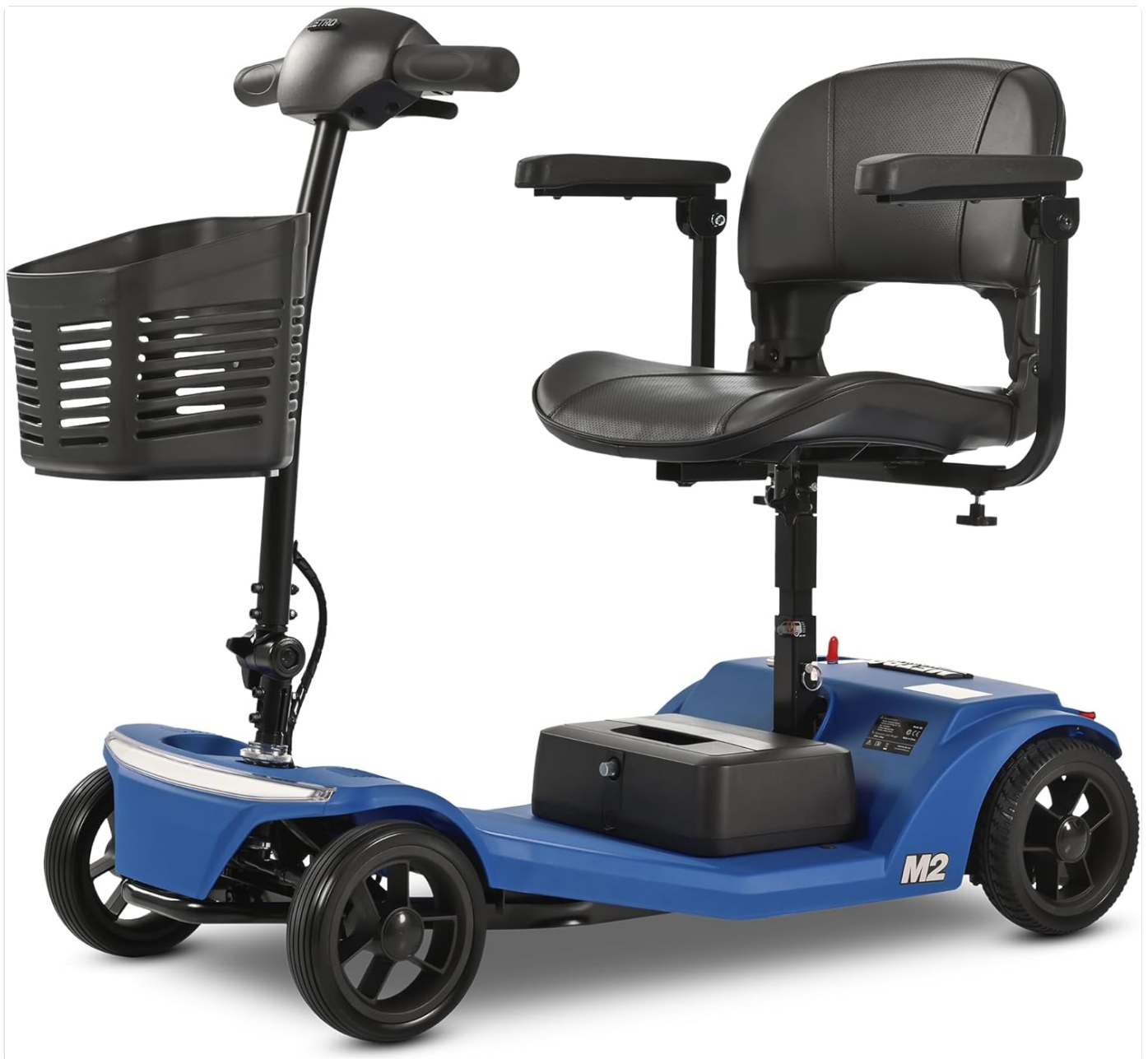
Figure 1: The Metro Mobility 4 Wheel Foldable Mobility Scooter, Model M2. This image shows the scooter's overall design, including the blue base, black seat, and front storage basket.