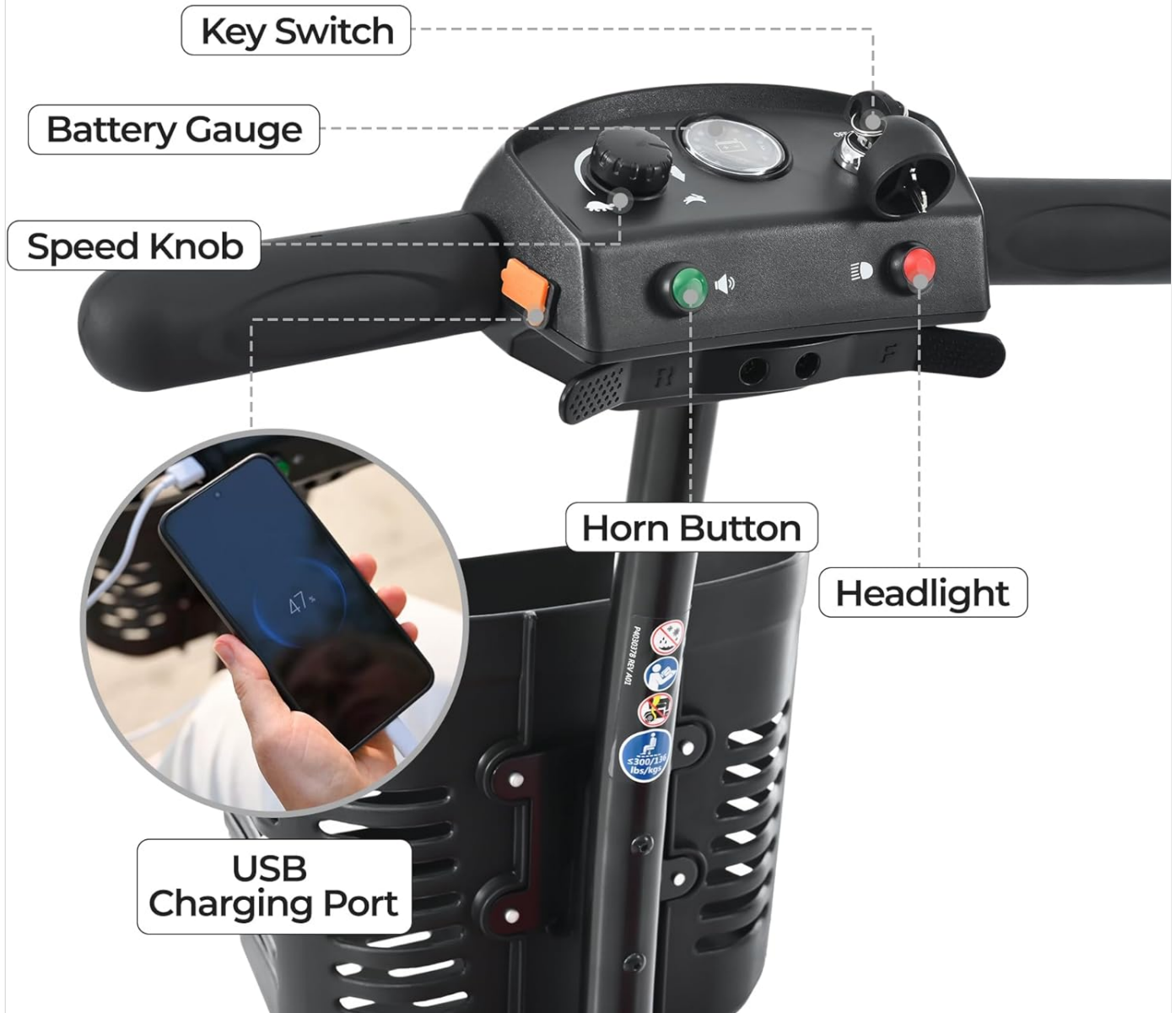
Figure 4: The scooter's control panel, illustrating the location and function of each control element.