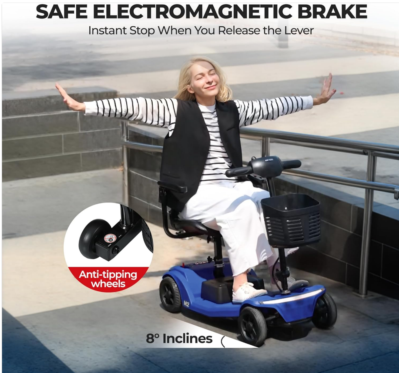
Figure 5: Demonstrating the scooter's safe electromagnetic brake system and the presence of anti-tipping wheels for enhanced stability on inclines.