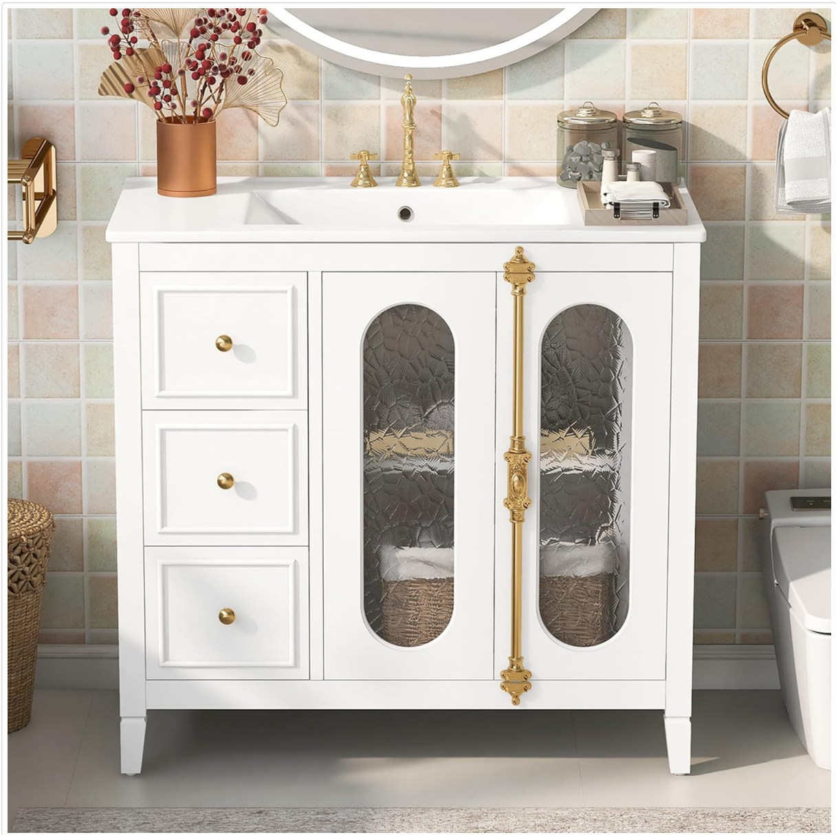
Image: Overview of the Merax 36-inch Bathroom Vanity, showcasing its design with three drawers, glass doors, and side storage.