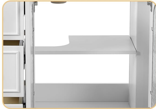
Image: The vanity with its drawers pulled out and cabinet doors open, illustrating the accessible storage space.