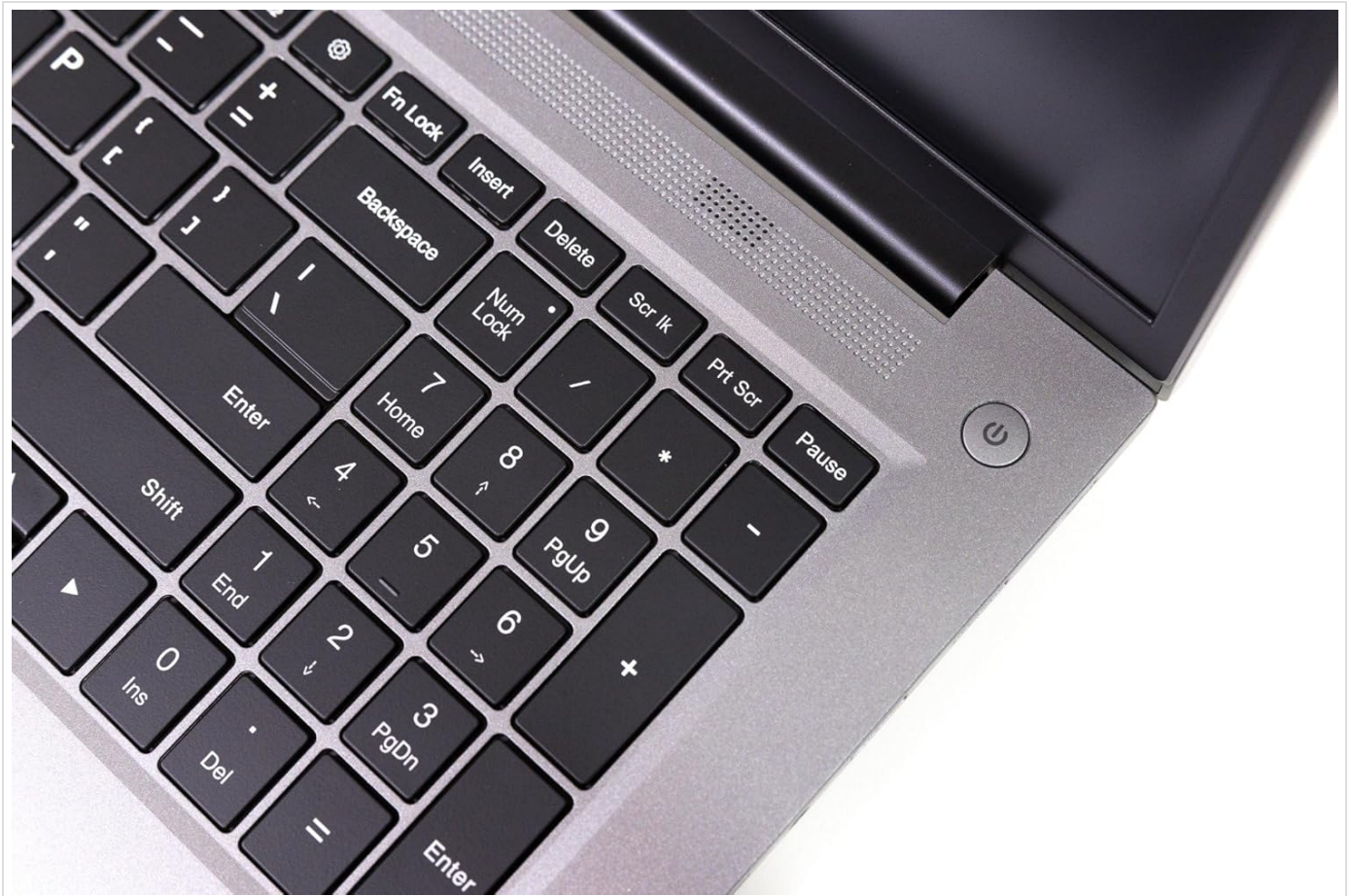
Figure 5: Close-up view of the laptop's keyboard, showing the numeric keypad and the power button located on the top right.