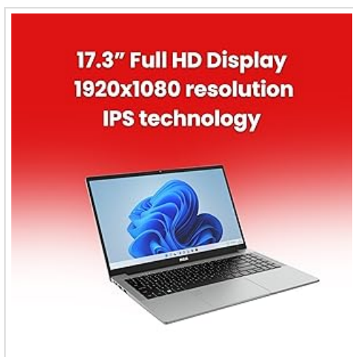
Figure 1: Front view of the RCA 17.3 inch laptop with key dimensions (17.3" W, 0.78" H, 10.12" D, 15.79" W, 4.39 lbs).

The RCA 17.3 inch FHD Laptop is designed for productivity and entertainment, featuring an AMD Ryzen 7 5700U processor, 8GB of RAM, and a 512GB Solid State Drive. It comes pre-installed with Windows 11 Home, offering a modern and efficient computing experience.