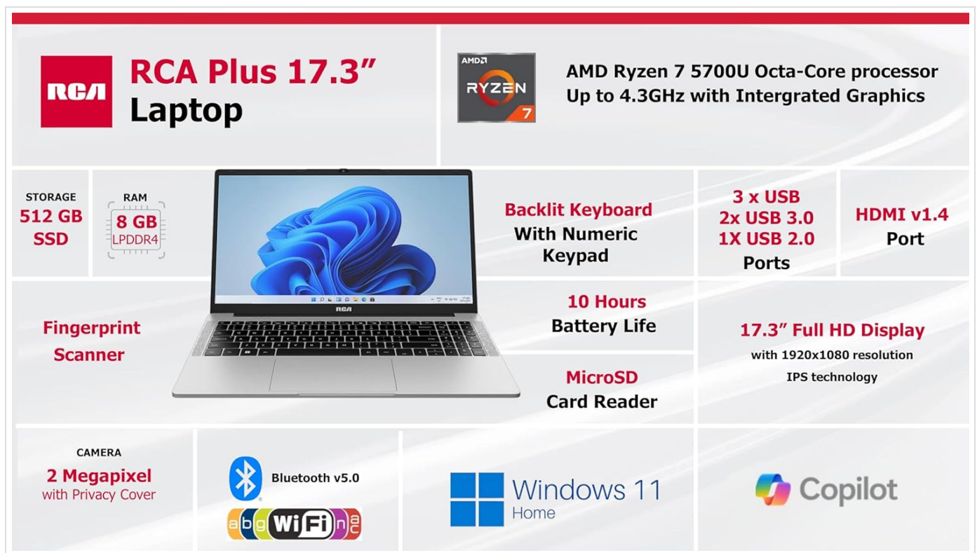
Figure 2: Overview of the laptop's features including AMD Ryzen 7 5700U processor, 512GB SSD, 8GB LPDDR4 RAM, backlit keyboard with numeric keypad, 10-hour battery life, MicroSD card reader, 17.3" Full HD IPS display, 2MP camera with privacy cover, Bluetooth v5.0, Wi-Fi, Windows 11 Home, and Copilot integration.