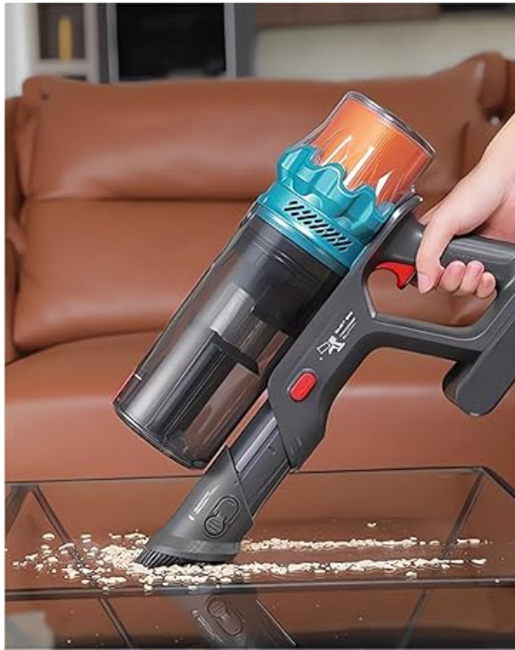
Image: The ElecKeys K10 in handheld mode, cleaning a table surface with precision.

Your browser does not support the video tag.