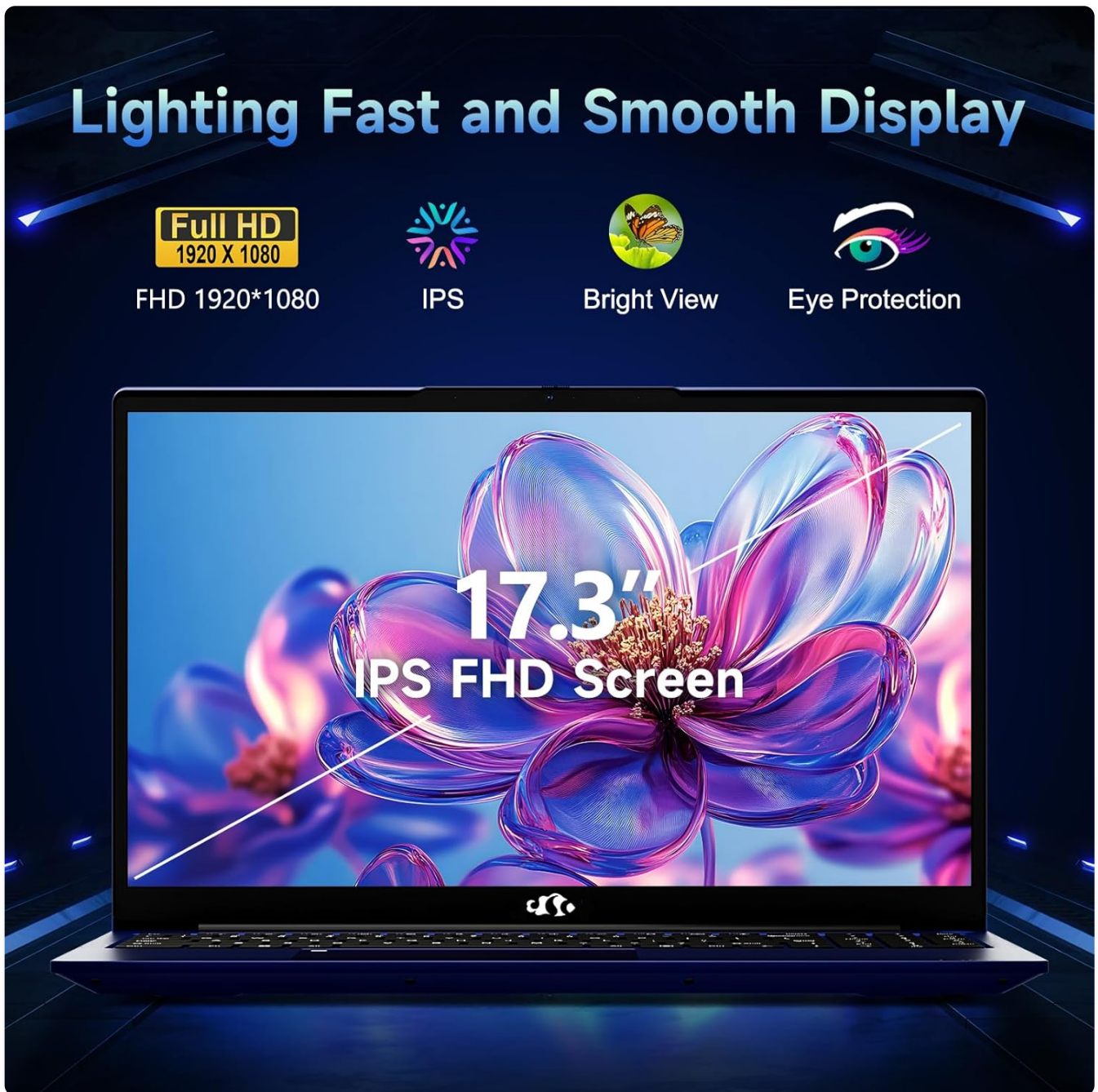
Figure 2: Lighting Fast and Smooth Display

This image highlights the laptop's 17.3" IPS FHD screen, emphasizing its Full HD 1920x1080 resolution, IPS technology for bright views, and eye protection features.