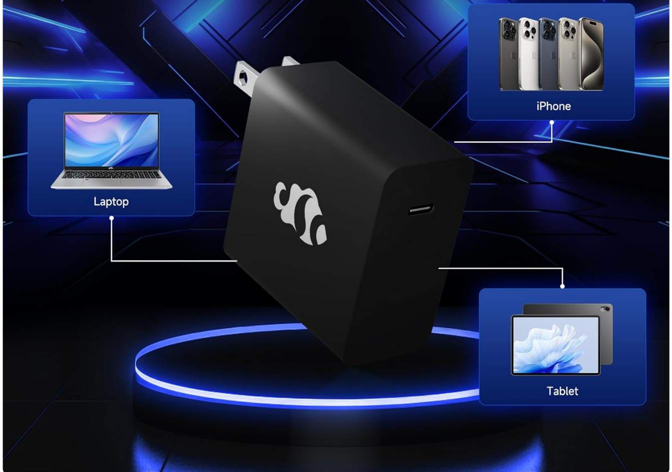
Figure 7: Type-C 100W PD Fast Charger

This image illustrates the compact 100W USB-C PD Fast Charger, highlighting its versatility to charge the laptop, phone, and tablet, making it a single charger solution for multiple devices.