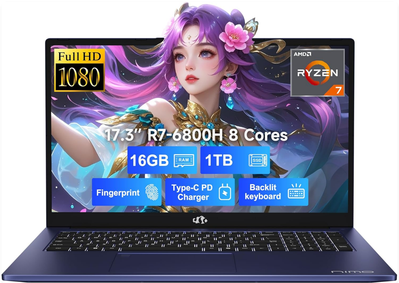
Figure 1: NIMO 17.3" IPS FHD Gaming Laptop

The NIMO laptop features an AMD Ryzen 7 6800H processor, AMD Radeon 680M integrated graphics, 16GB DDR5 RAM, and a 1TB PCIe 4.0 SSD, ensuring smooth and efficient operation for demanding tasks.