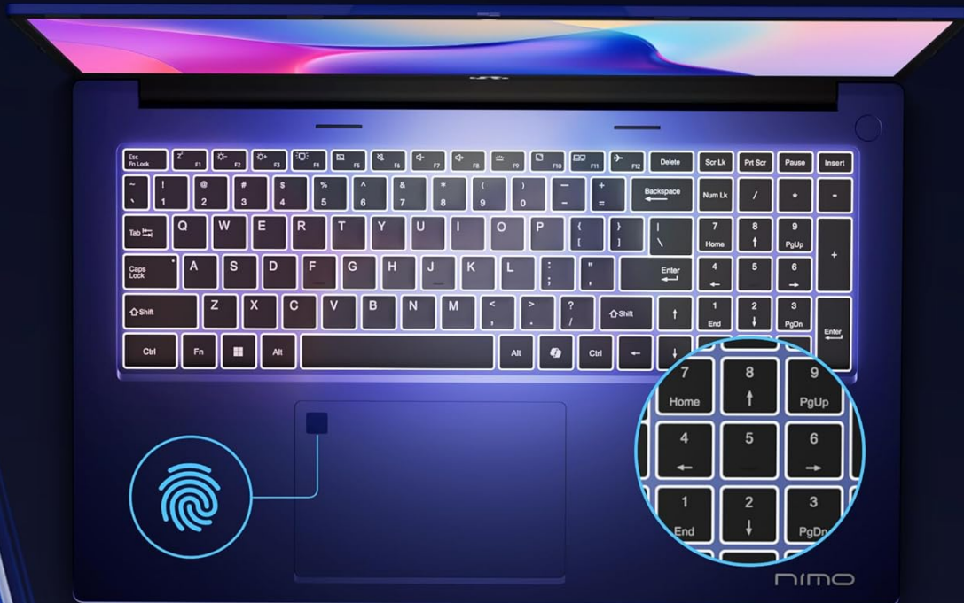
Figure 6: Backlit and Full Keyboard

This image showcases the laptop's backlit keyboard, HD Webcam, Webcam Shield, Fingerprint sensor, and Numeric Keypad, highlighting features designed for convenience and security.