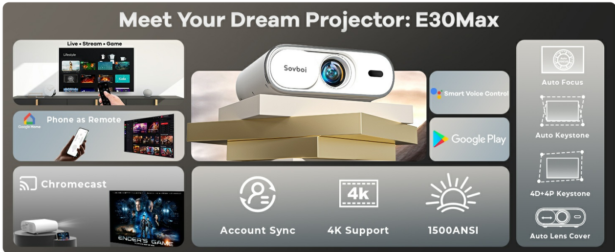
Image: Sovboi E30Max Projector highlighting its core features and connectivity options.