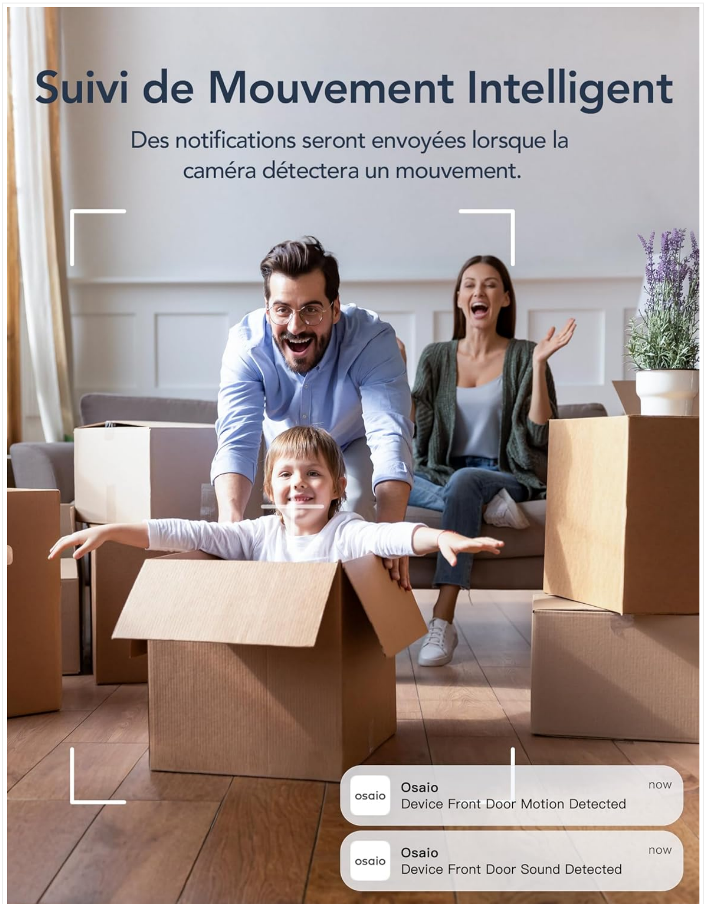
Figure 4.3: Motion Detection and Instant Notifications.