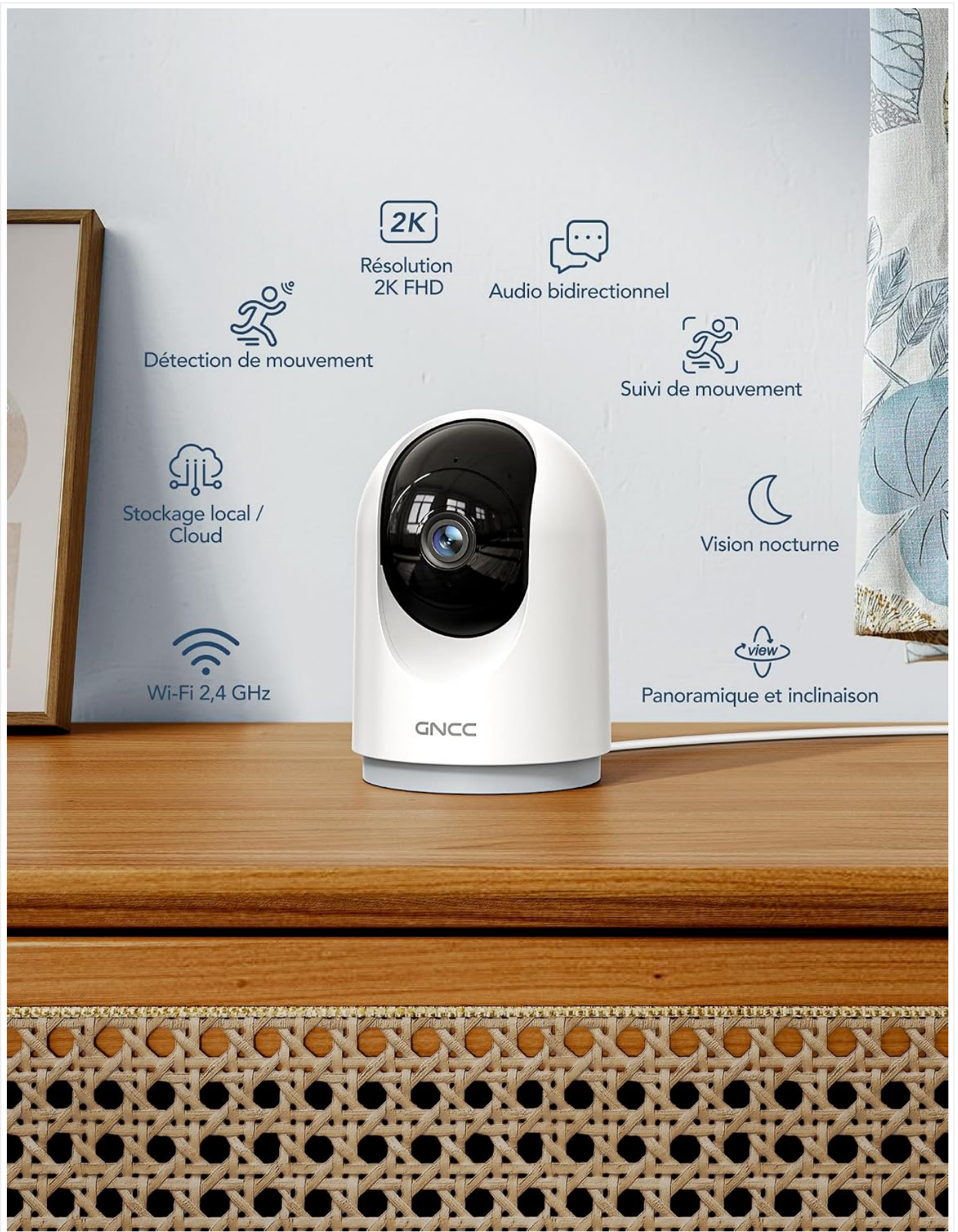
Figure 2.2: Key Features of the GNCC P5W Camera.