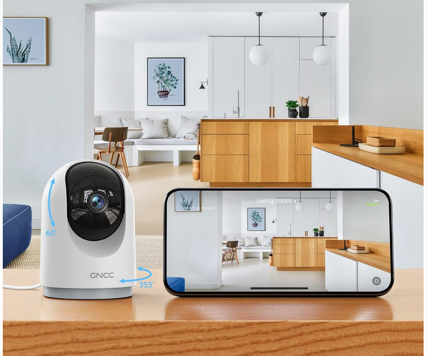
Figure 4.1: 360° Coverage of the GNCC P5W Camera.

Avec la vue en direct 2K FHD 24h/24 et 7j/7, vous êtes sûr de ne rien manquer.