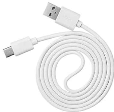
Câble d'alimentation de 2 m