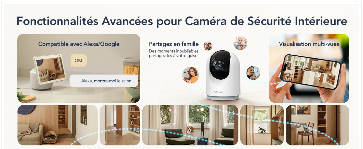
Figure 4.6: Smart Home Integration and Advanced Features.