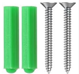
Paquet de vis