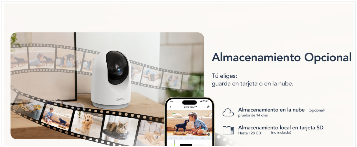
Figure 4.5: Cloud and Local Storage Options.