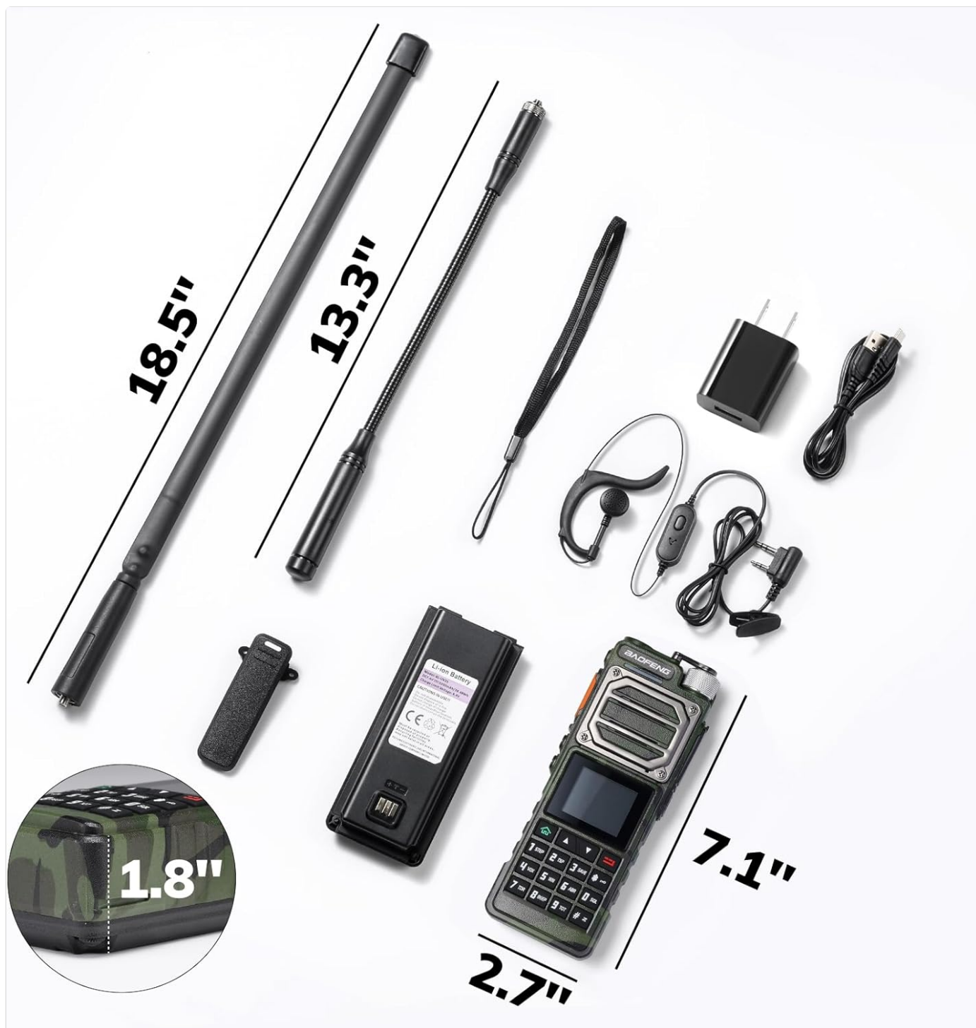
Figure 6: The robust metal design of the BAOFENG UV-25 radio.