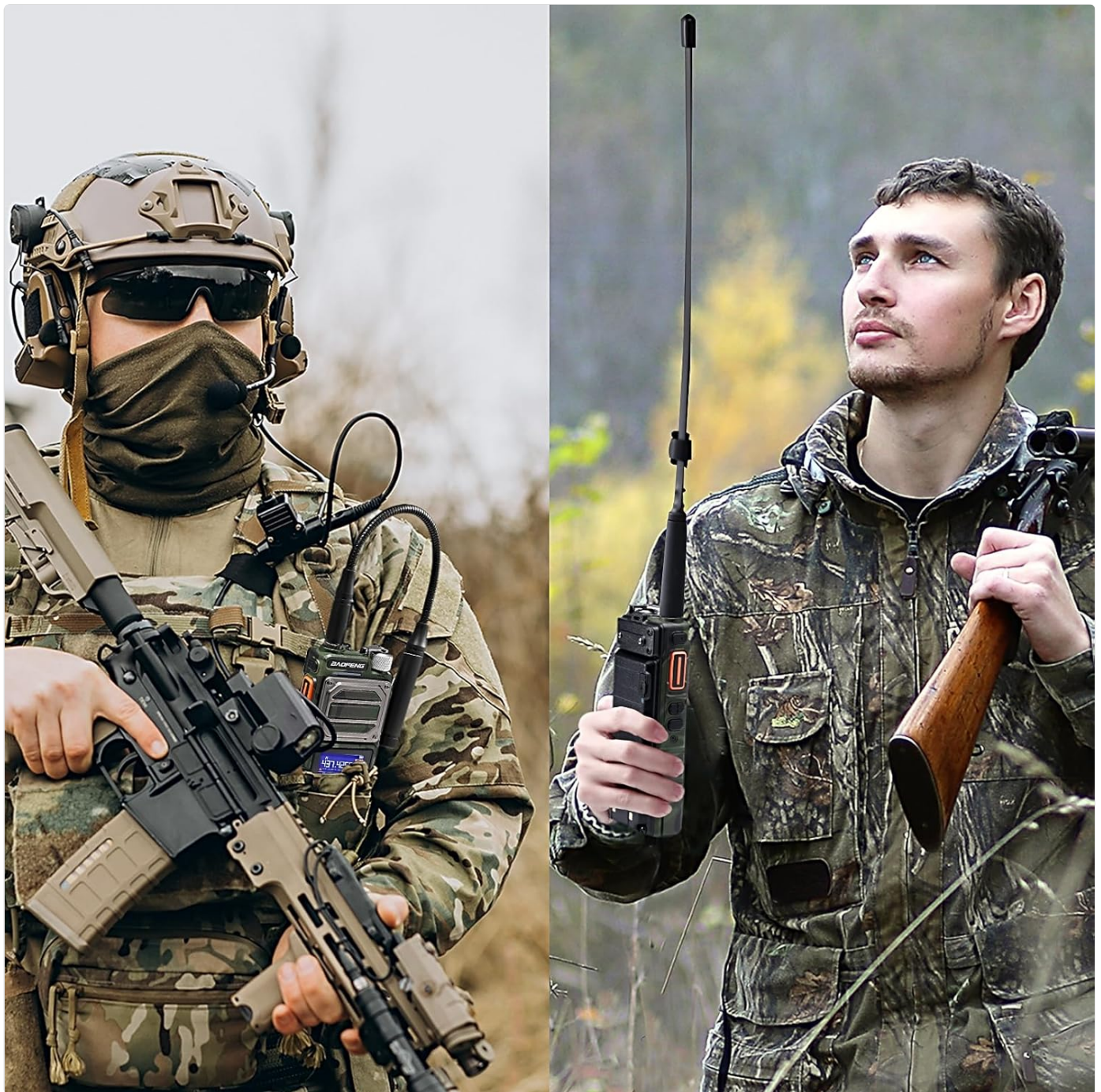
Figure 2: All components included in the BAOFENG UV-25 package.