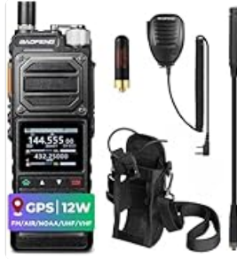
Figure 5: Using the numeric keypad for DTMF manual dialing on the UV-25 radio.