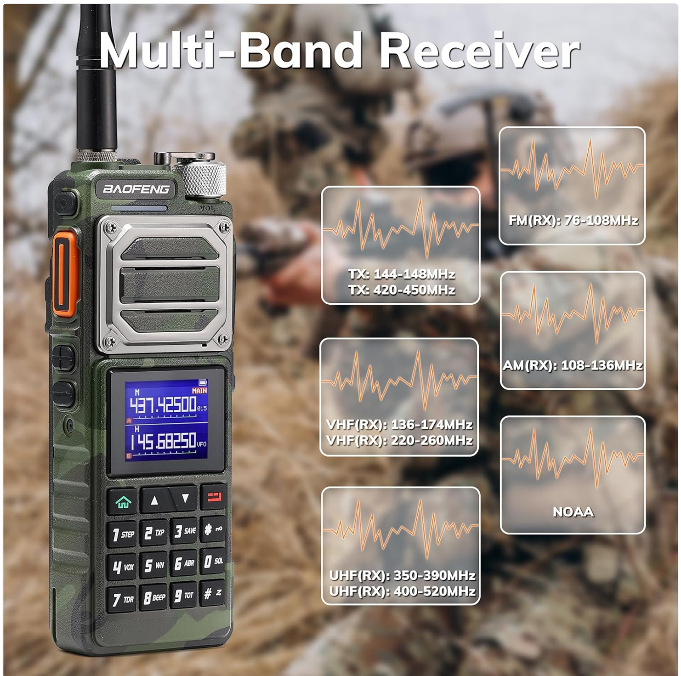
Figure 1: BAOFENG UV-25 Two Way Radio with its main features.