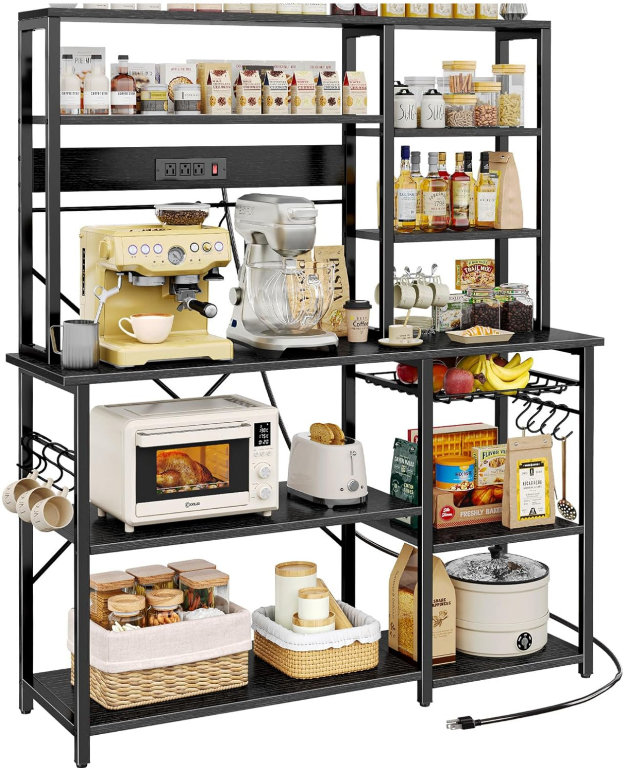
Image: The SUPERJARE 6-Tier Bakers Rack, showcasing its multi-level storage and integrated power outlets, organized with various kitchen items.