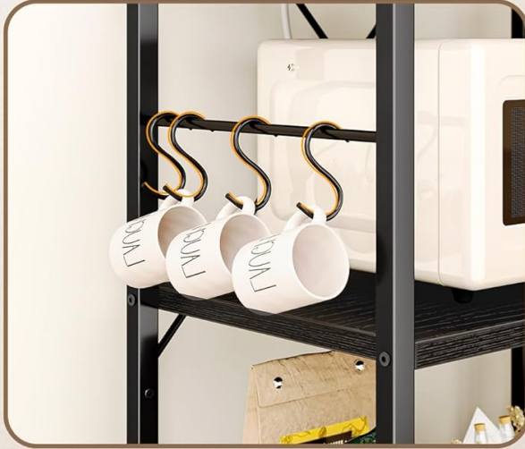
12 S-shaped Hooks