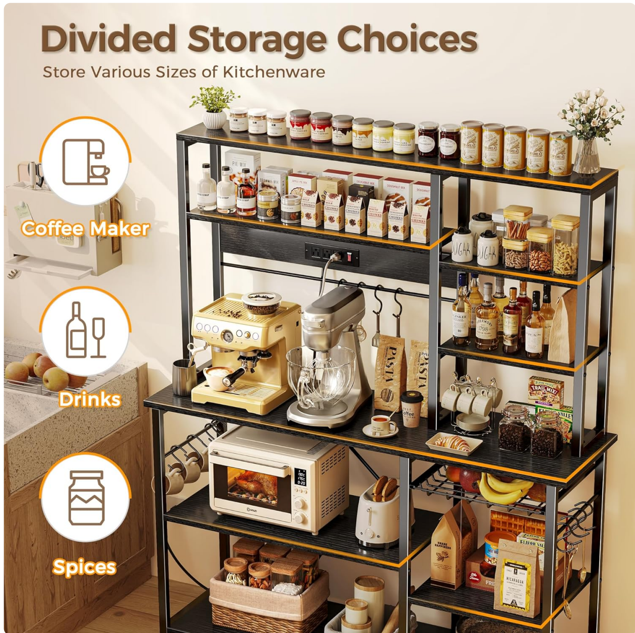
Image: An example of the rack's divided storage, showing how different kitchen items can be neatly arranged.