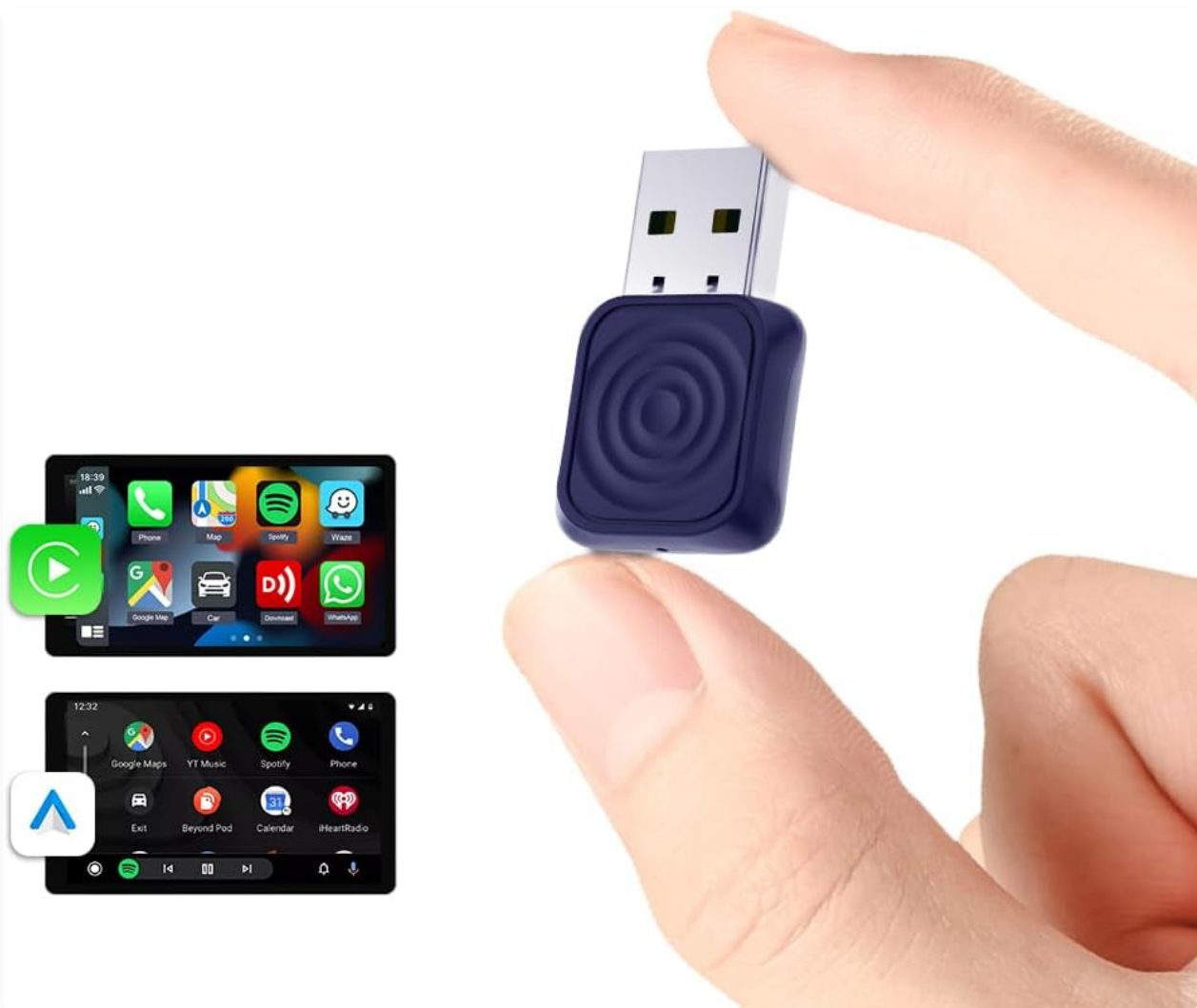
Image: The Carlinkit Mini Ultra wireless adapter, shown next to car display interfaces for both Apple CarPlay and Android Auto.