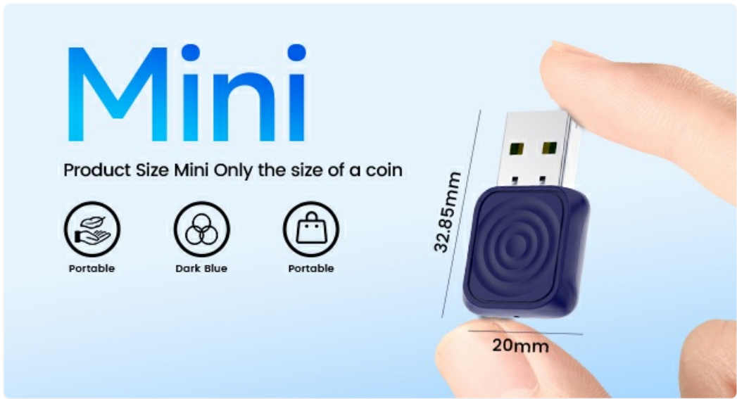
Image: The Carlinkit Mini Ultra adapter shown with its dimensions (32.85mm x 20mm) for scale, highlighting its compact size.