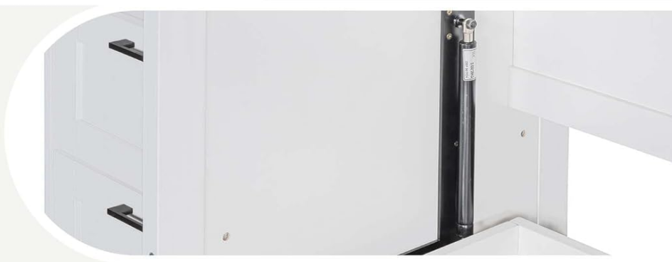
Image: Close-up views illustrating the sturdy construction of the bed, highlighting the use of pine wood and MDF, the design of the support legs, and the sliding track mechanism for smooth operation.