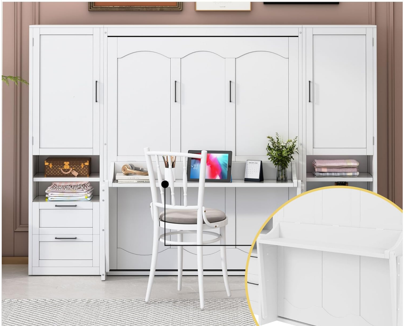
Image: The Polibi Murphy Bed in its cabinet configuration, showcasing the integrated desk feature. A chair is positioned at the desk, indicating its use as a workspace.

When not in use, simply fold it up that provides a table for you to study or work at, which is very convenient. .