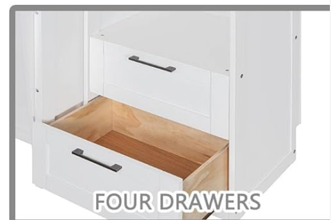
Image: The Polibi Murphy Bed with its integrated storage solutions visible, including open side wardrobes, accessible shelves, and pull-out drawers, demonstrating ample space for organization.