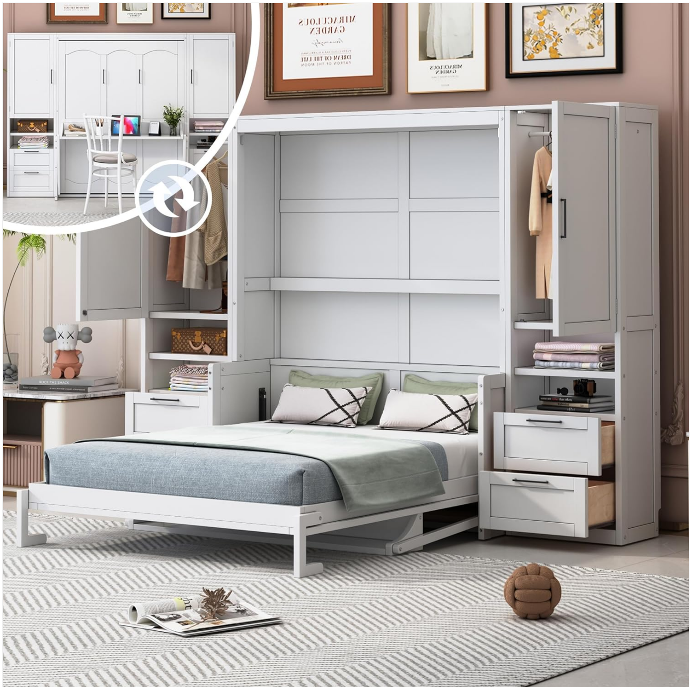
Image: The Polibi Queen Size Murphy Bed system, showcasing its dual functionality as a space-saving cabinet and a comfortable bed. The inset image highlights the transformation from desk to bed.