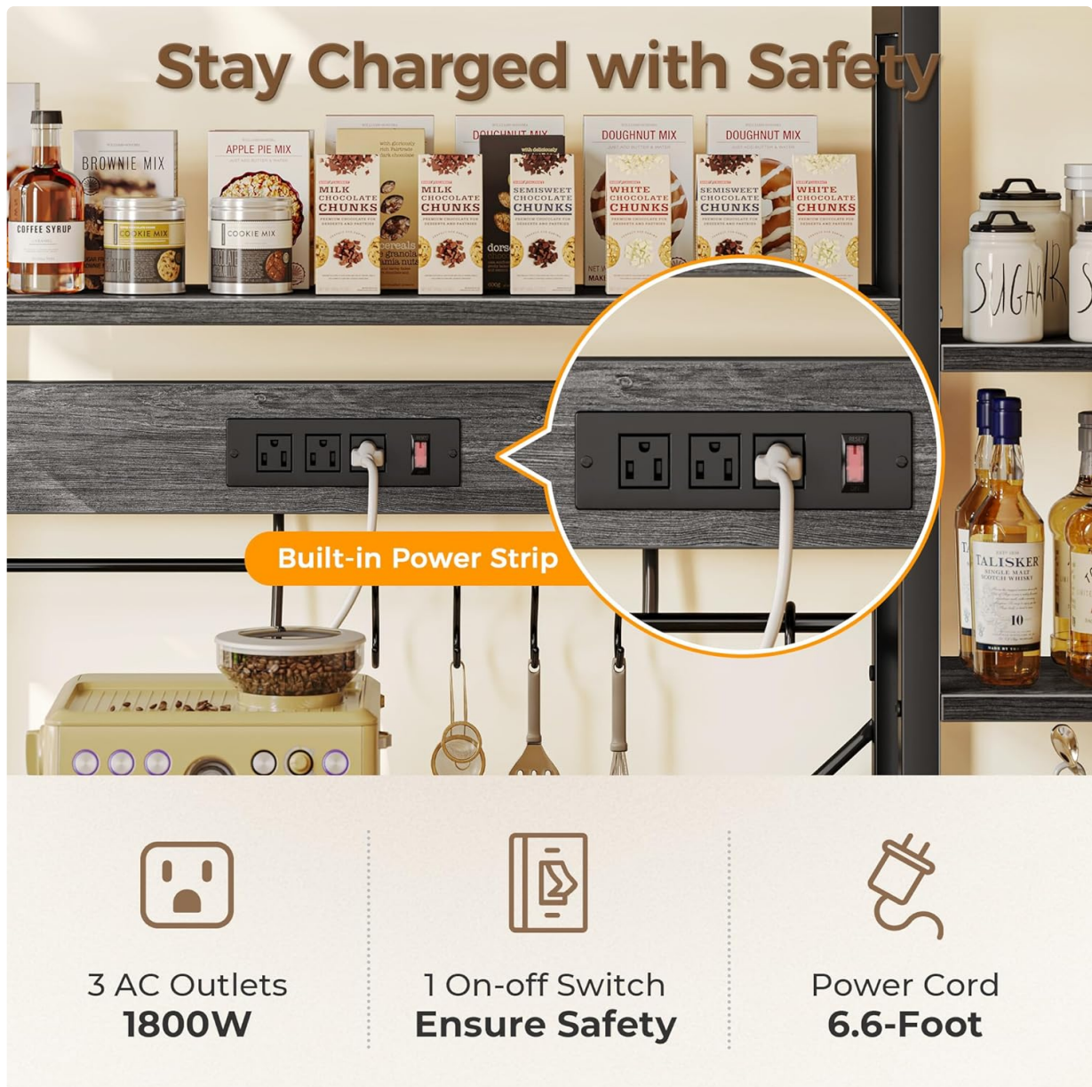
Figure 4: The built-in power strip, featuring two AC outlets and a safety on/off switch, designed for convenient appliance use.