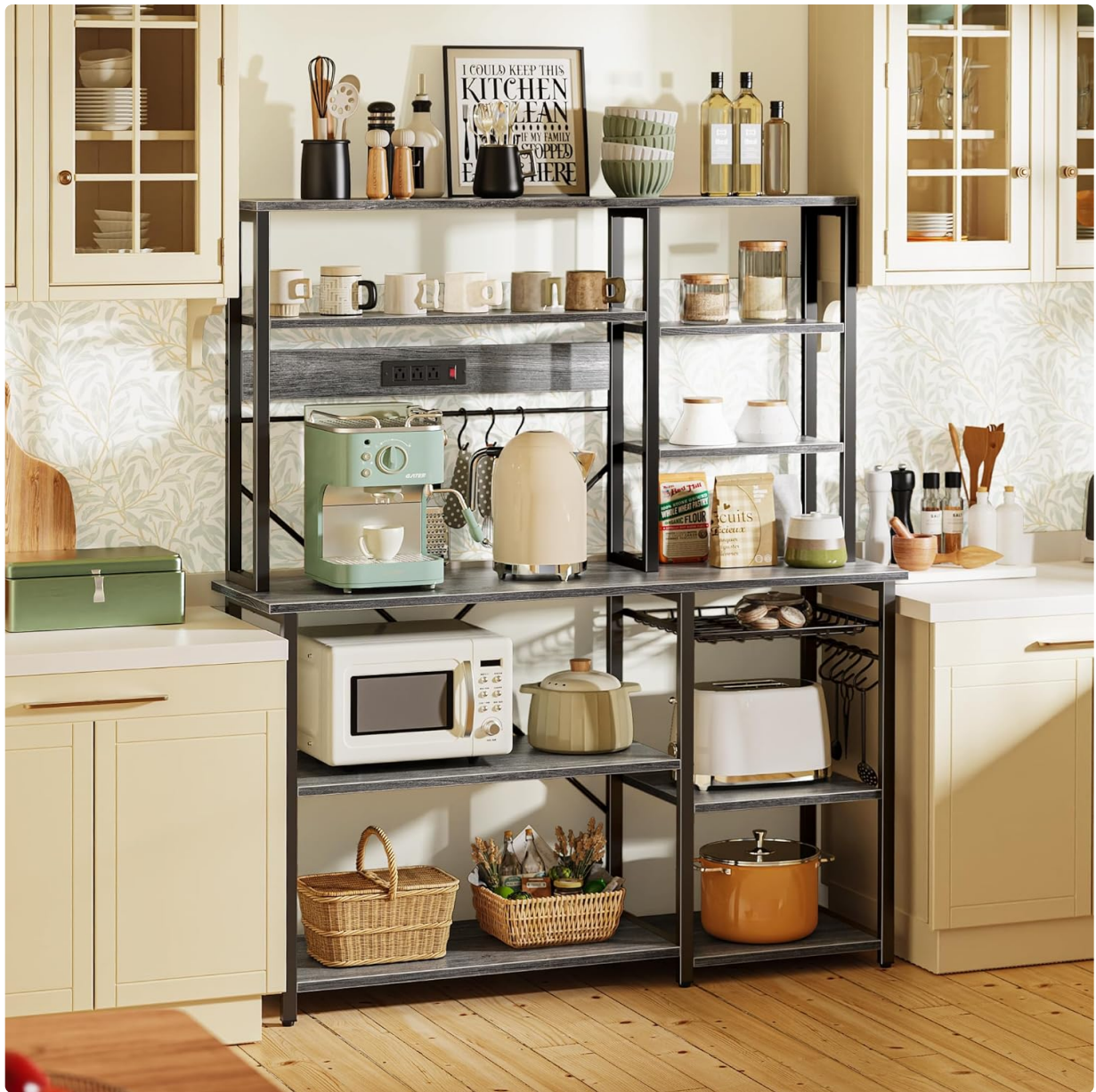
Figure 1: The SUPERJARE 6-Tier Bakers Rack, showcasing its design and storage capacity in a kitchen environment.