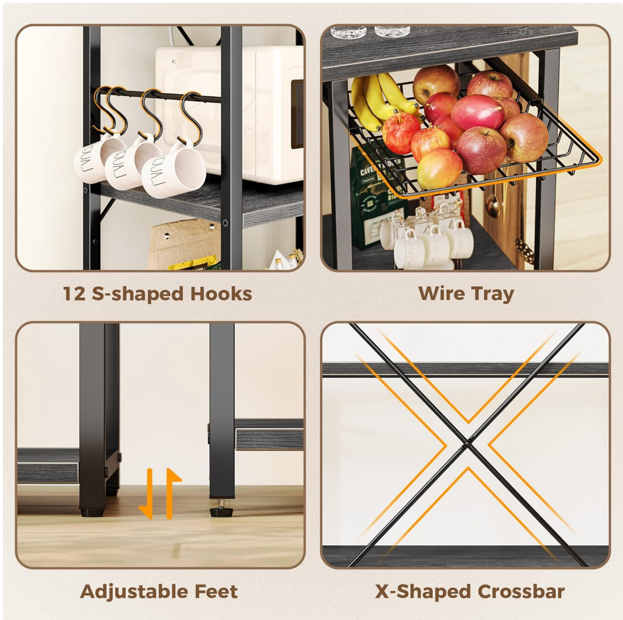
Figure 3: Detailed view of key components including S-shaped hooks, the pull-out wire basket, adjustable leveling feet, and the X-shaped crossbar for enhanced stability.

During assembly, pay special attention to the orientation of the side frames, particularly the one that accommodates the power outlet. Some holes may appear similar, but incorrect orientation can prevent proper installation of the power strip or shelves. Refer to the numbered parts and diagrams carefully.