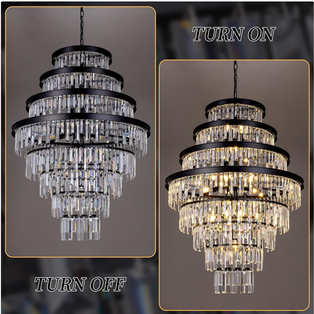
Image 3: This image displays the chandelier in its unlit (left) and lit (right) states, demonstrating the illumination effect.