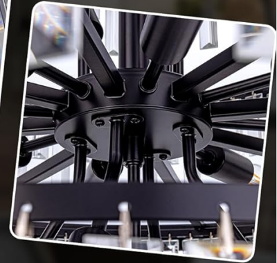
Image 2: This image provides a detailed view of the K9 crystal droplets and their attachment points on the metal frame, illustrating the cascading design.