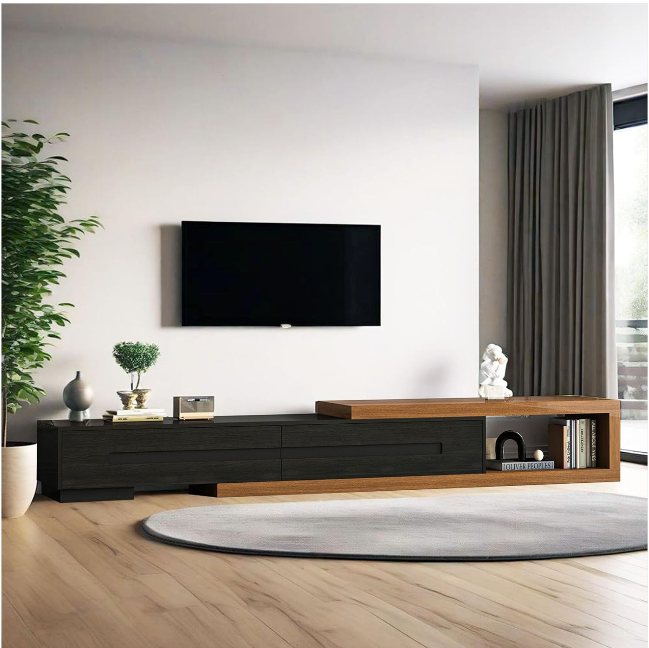
Figure 2.1: The CayugaCrekrd Extendable TV Stand in a modern living room.