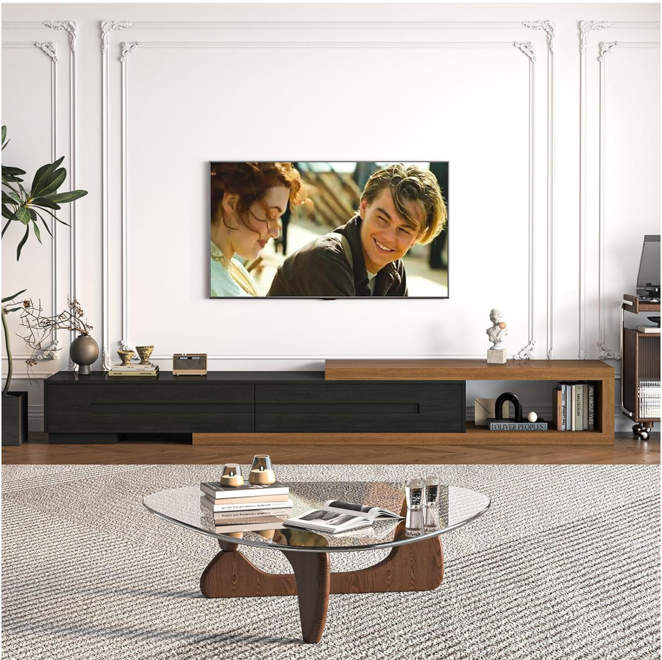
Figure 4.2: The TV stand fully assembled and extended, demonstrating its capacity for a large television and decorative elements.