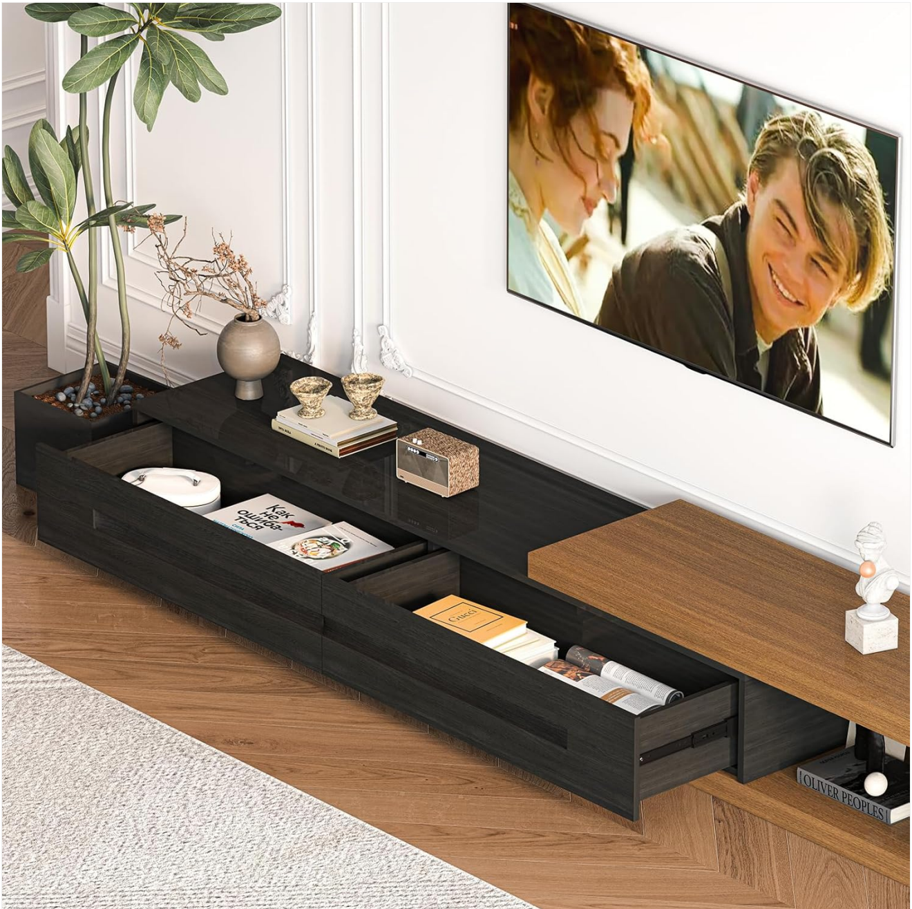
Figure 4.1: The two integrated drawers offer convenient storage for various items.