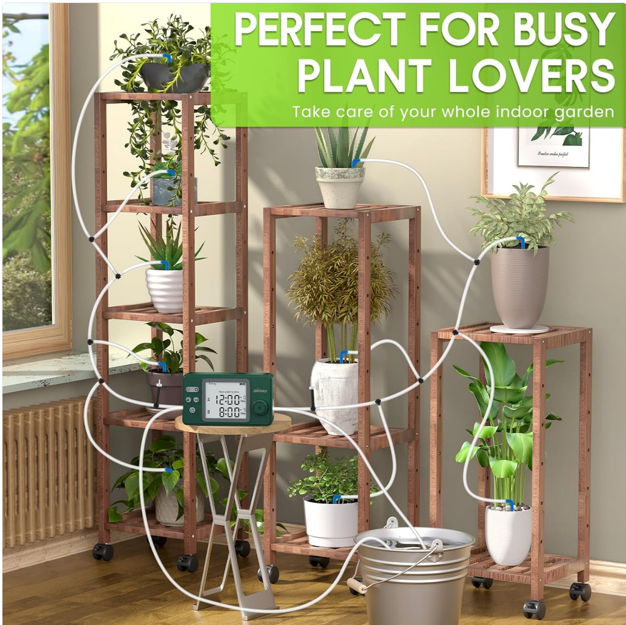
Figure 3.1: The beday watering system in an indoor plant setup.