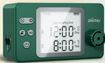
Watering System x1