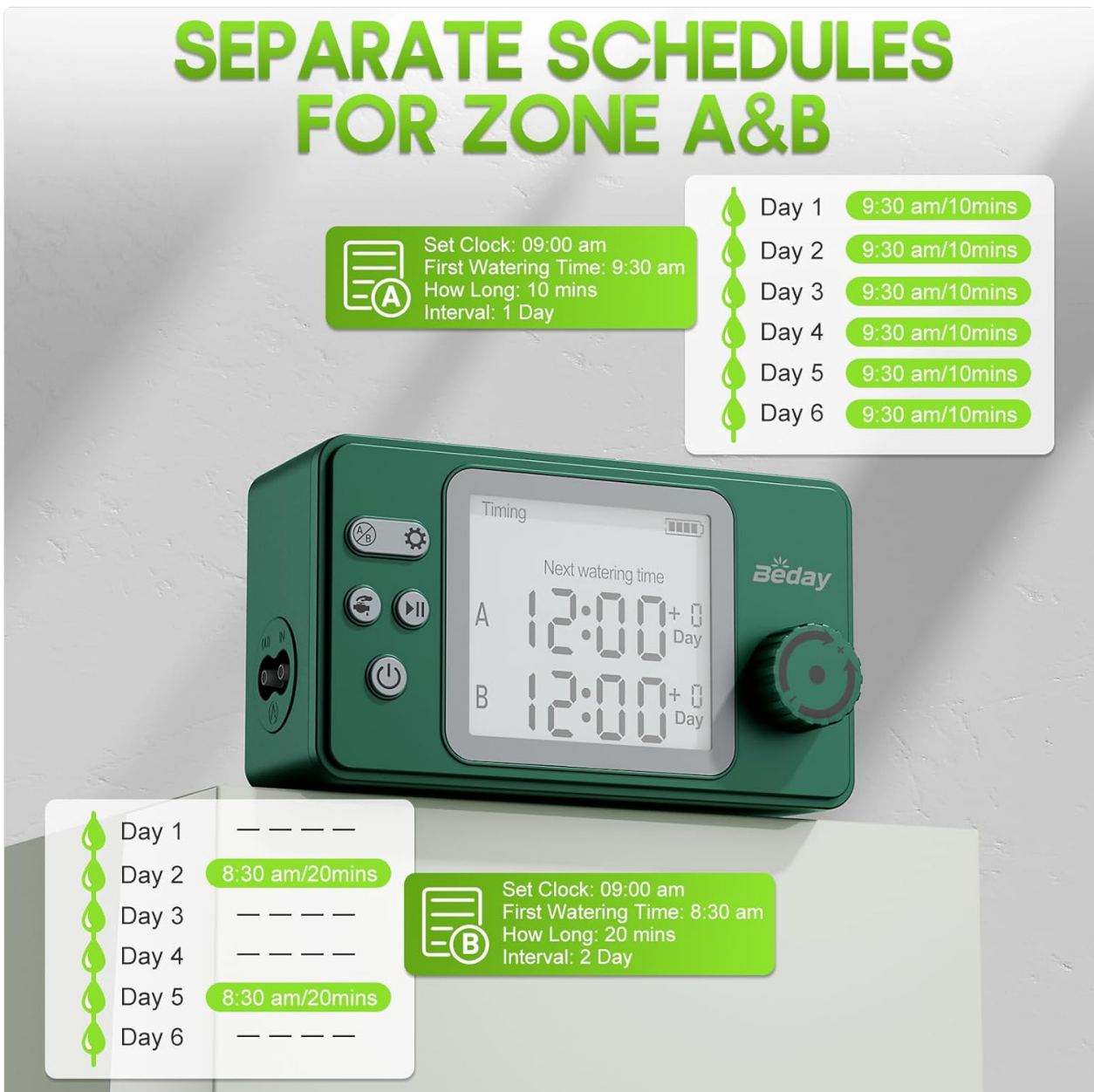
Figure 5.3: Independent scheduling for Zone A and Zone B.