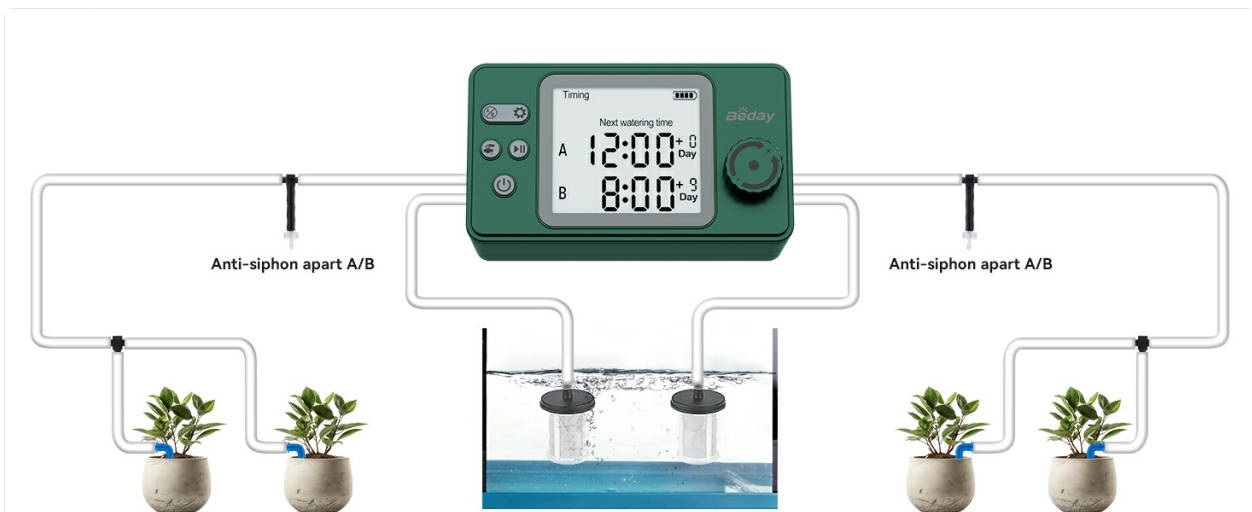
Figure 5.2: Setting watering interval and duration.