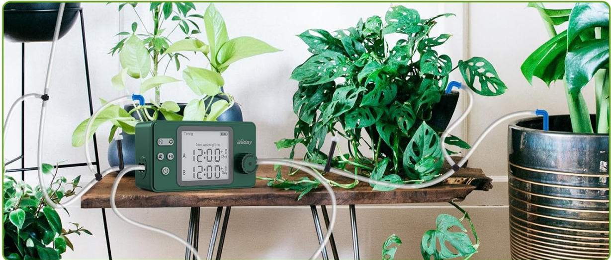
Figure 3.2: The system provides worry-free plant care during travel.