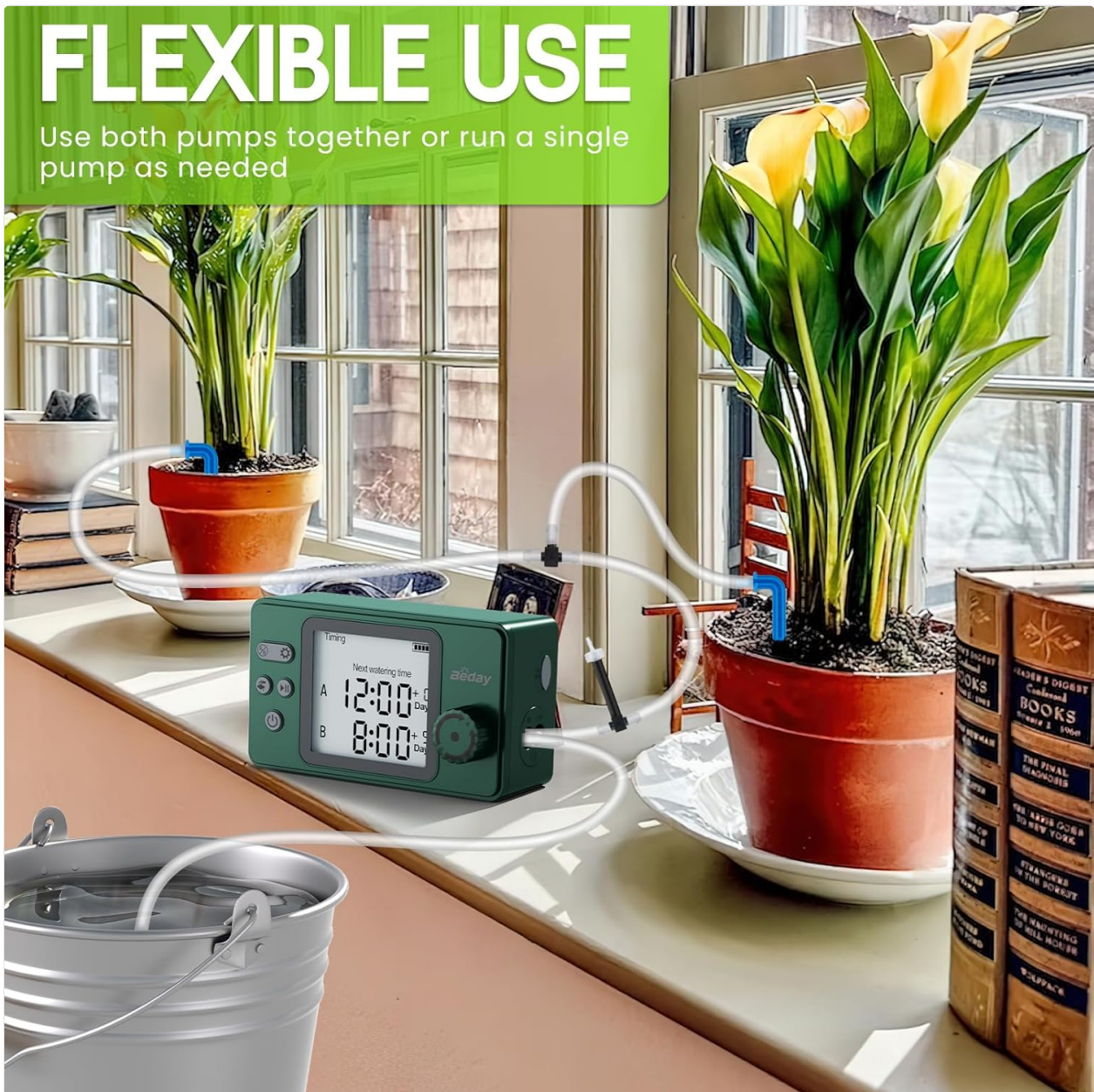
Figure 4.1: Flexible setup for different plant arrangements.