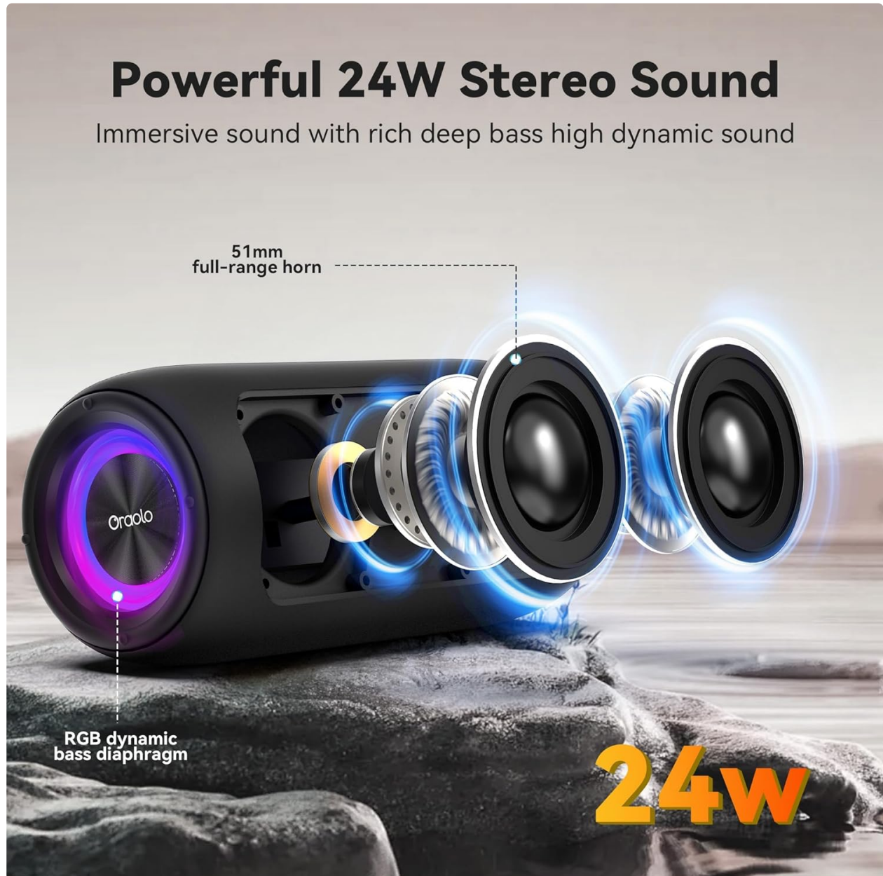
Image: An exploded view of the Oraolo BS02 speaker, highlighting its internal 51mm full-range horn and RGB dynamic bass diaphragm, contributing to its powerful 24W stereo sound.

The Oraolo BS02 speaker features advanced audio components for a rich sound experience.