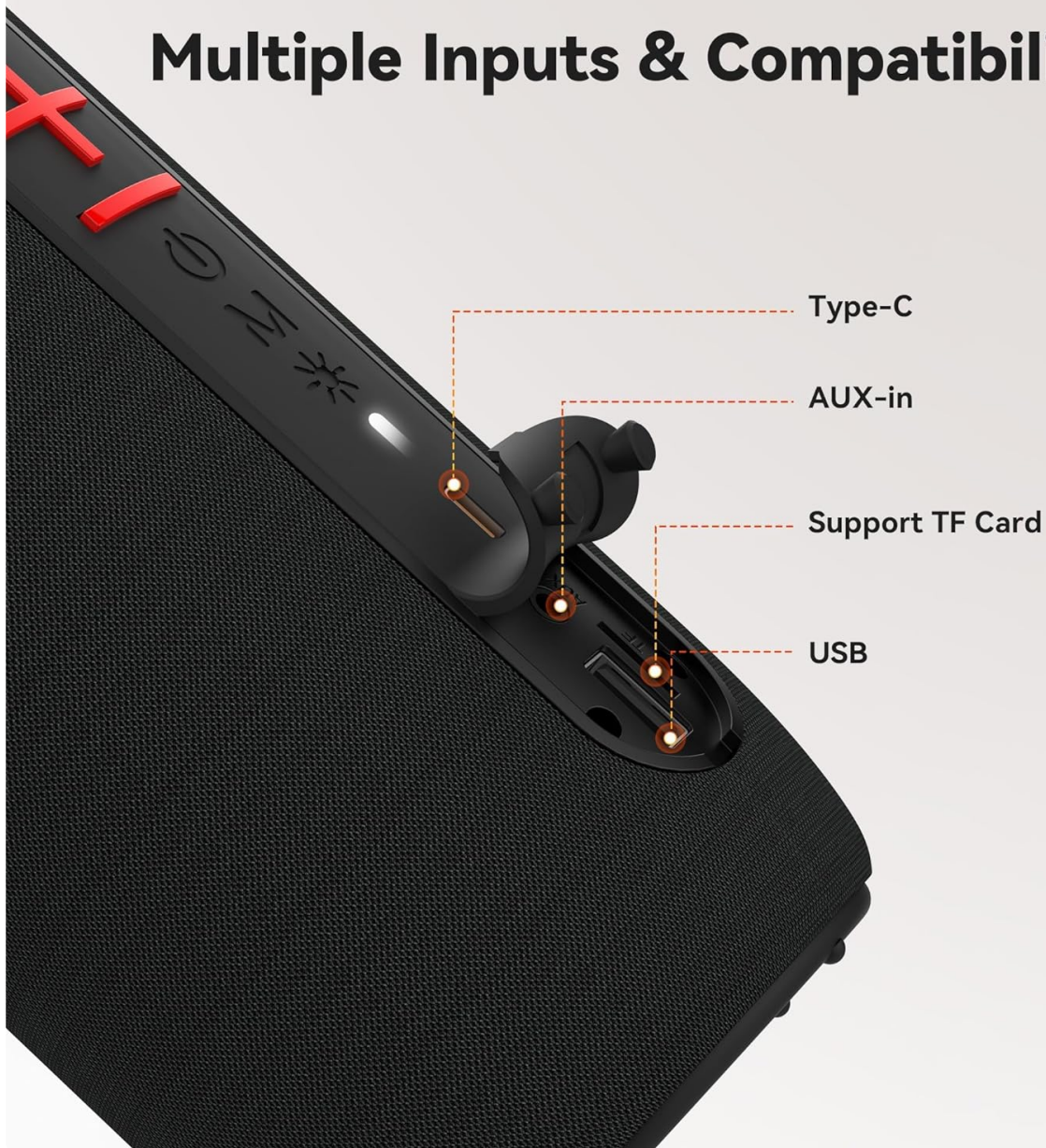
Image: A detailed view of the Oraolo BS02 speaker's input panel, showing the Type-C charging port, AUX-in port, TF Card slot, and USB port.