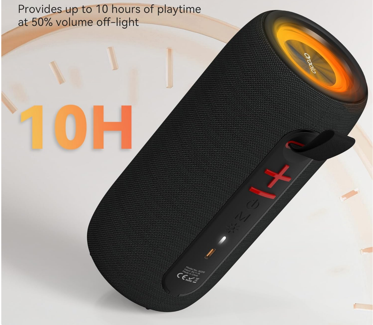
Image: The Oraolo BS02 speaker with an overlay indicating '10H Extended Playtime', signifying its long-lasting battery performance.

Provides up to 10 hours of playtime at 50% volume off-light