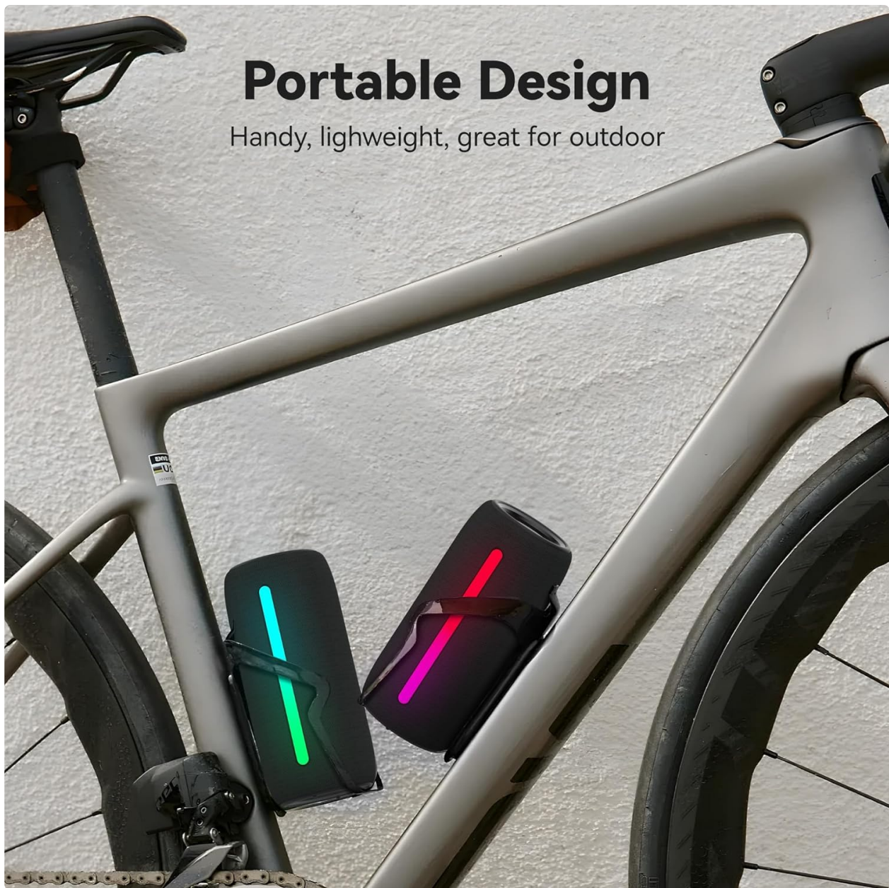
Image: Two Oraolo BS02 speakers attached to a bicycle frame, demonstrating the product's portable design for outdoor activities.