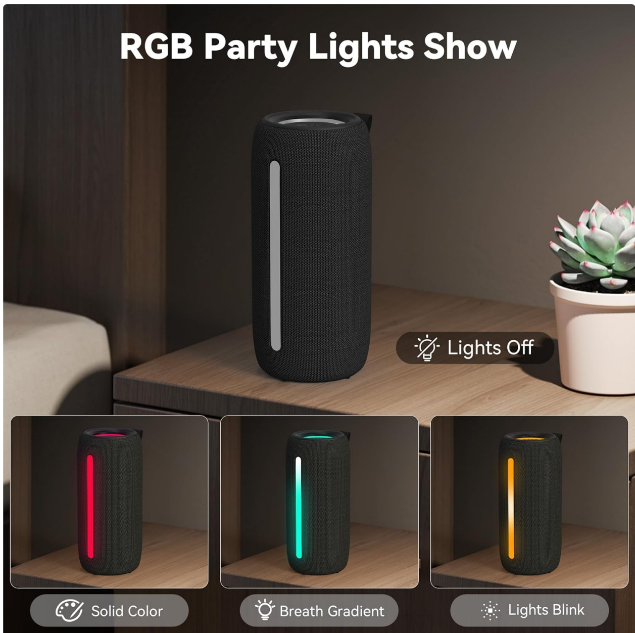
Image: The Oraolo BS02 speaker displaying various RGB lighting effects, including Lights Off, Solid Color, Breath Gradient, and Lights Blink, demonstrating its party light show feature.