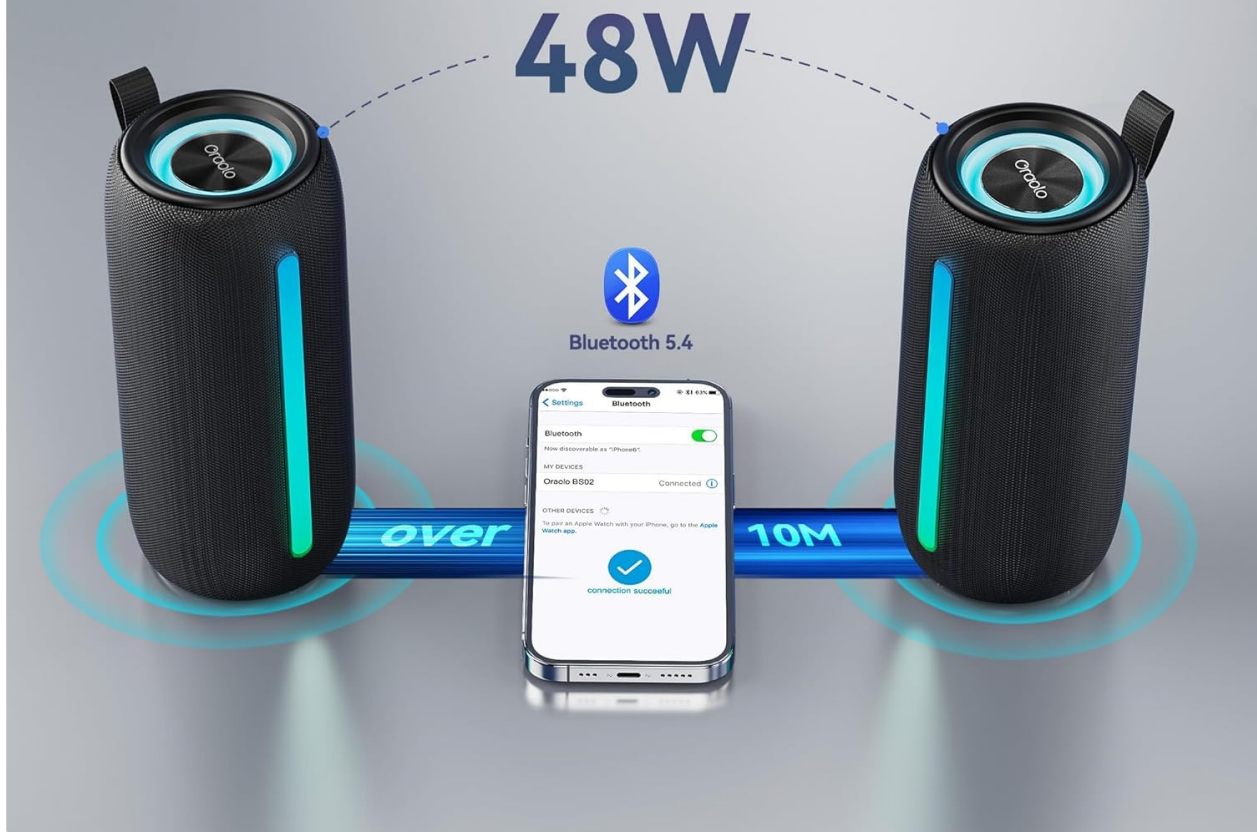
Image: Two Oraolo BS02 speakers wirelessly connected to each other and a smartphone, illustrating the True Wireless Stereo (TWS) pairing feature for enhanced sound.

Double the Oraolo speakers for 48W of thunderous 360° sound