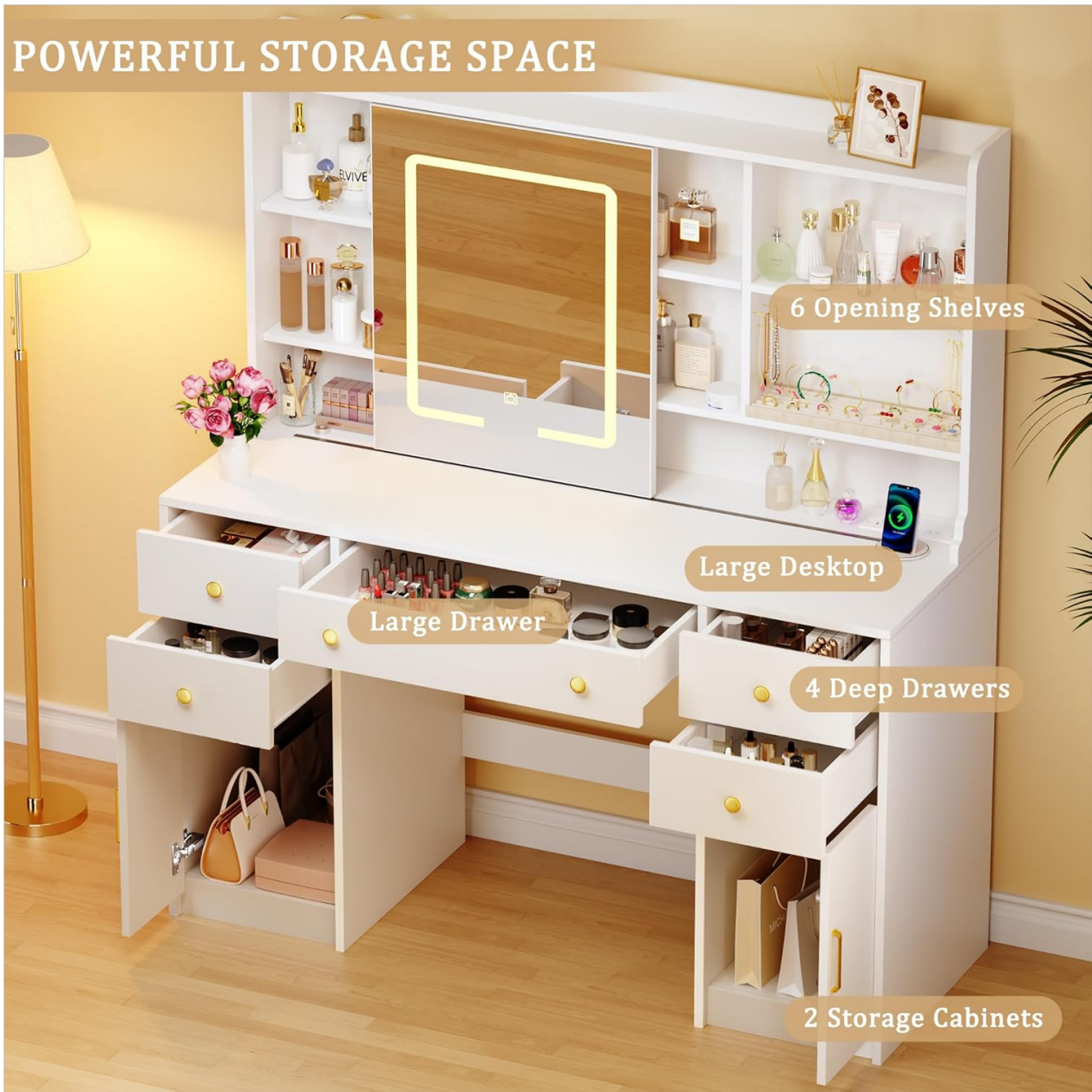
Image 5.4: Overview of the vanity desk's powerful storage space, including drawers, shelves, and cabinets.