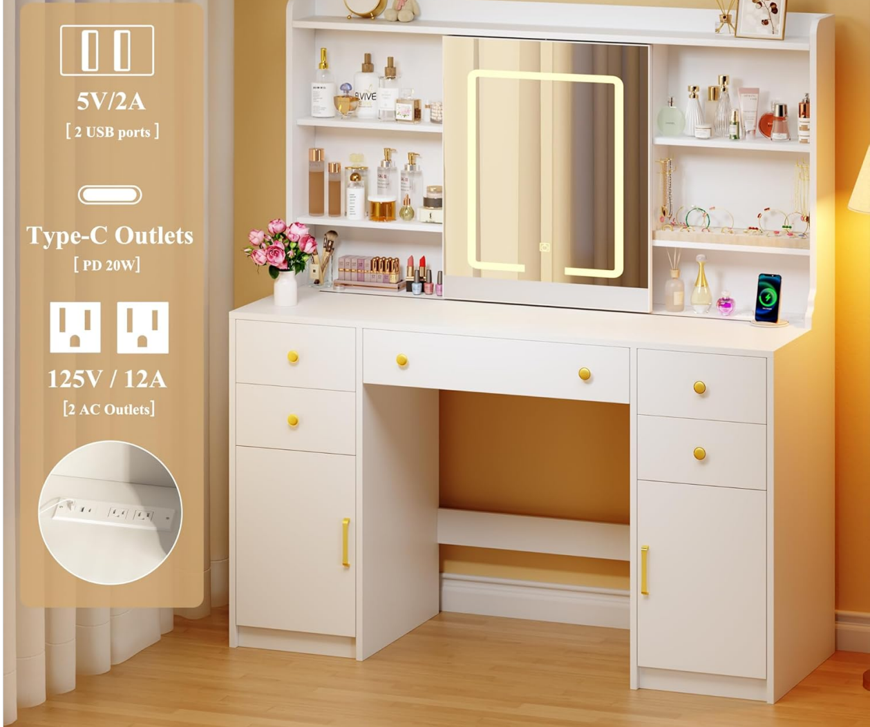
Image 5.3: The built-in charging station with various power outlets.