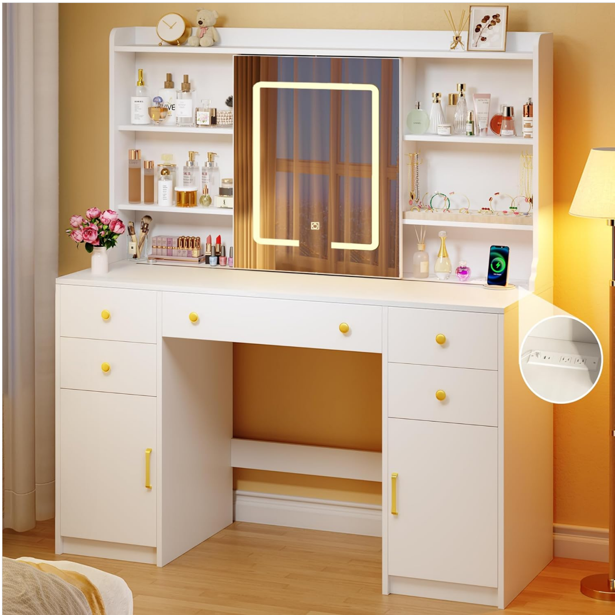
Image 1.1: The HUAHUU Vanity Desk, featuring its LED-lit mirror, multiple drawers, and open shelves.