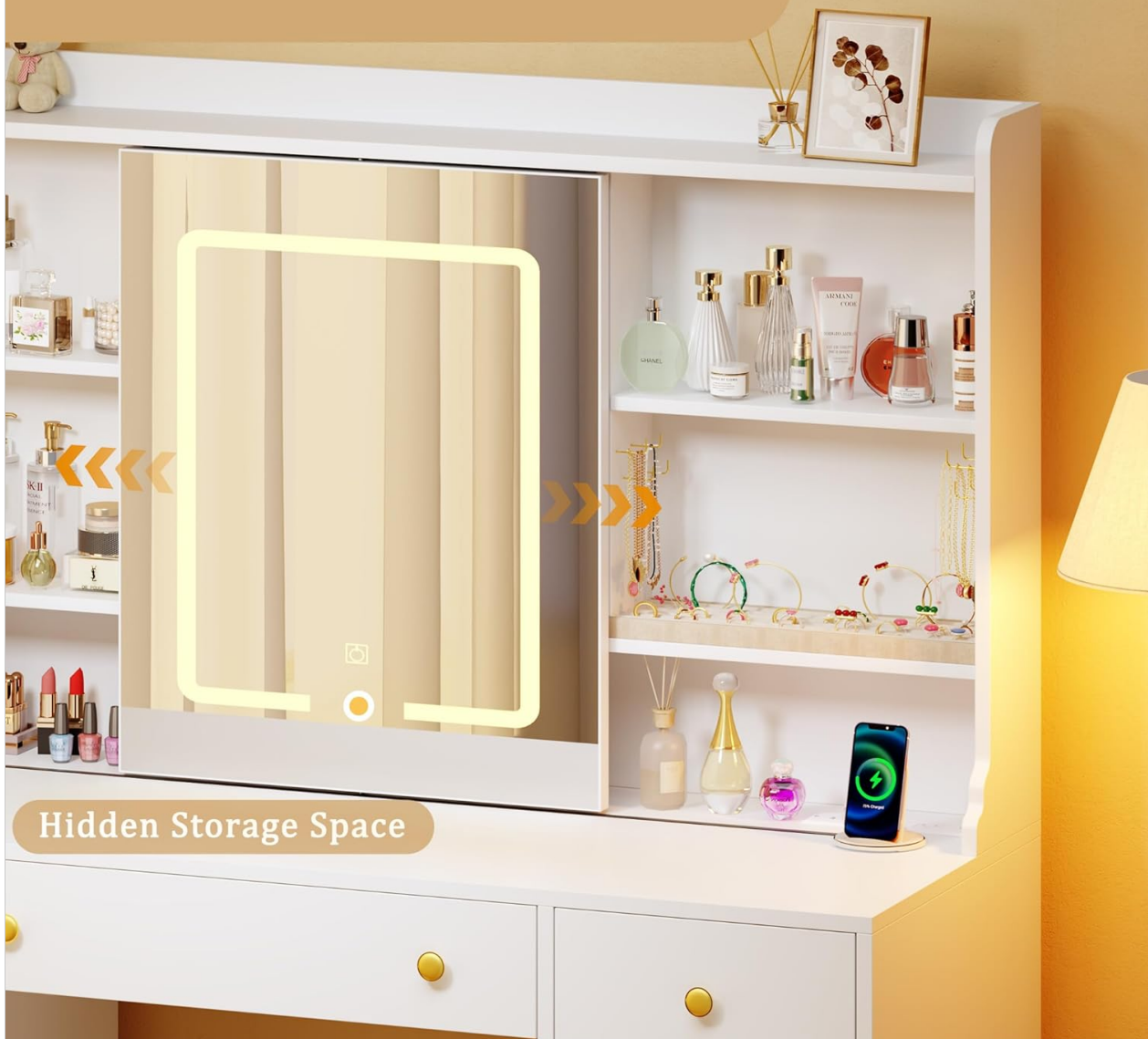
Image 5.2: The sliding mirror feature, showing access to hidden storage space.