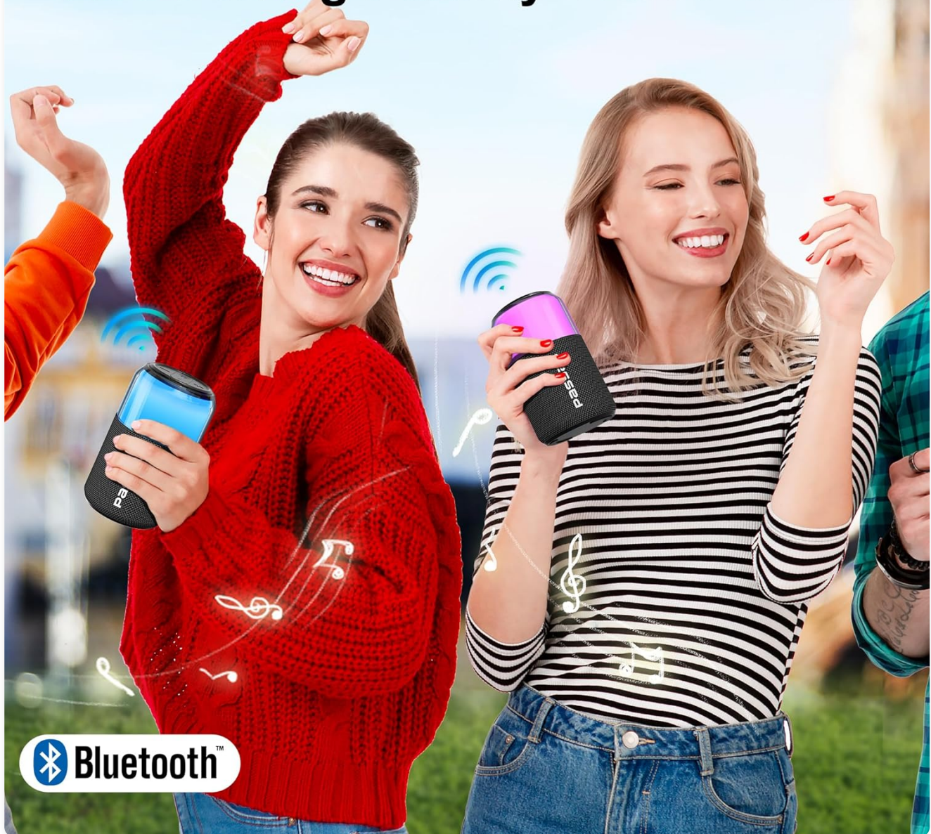
Image: Two Passau S225B speakers shown wirelessly connected, illustrating the True Wireless Stereo (TWS) pairing feature for a wider soundstage.