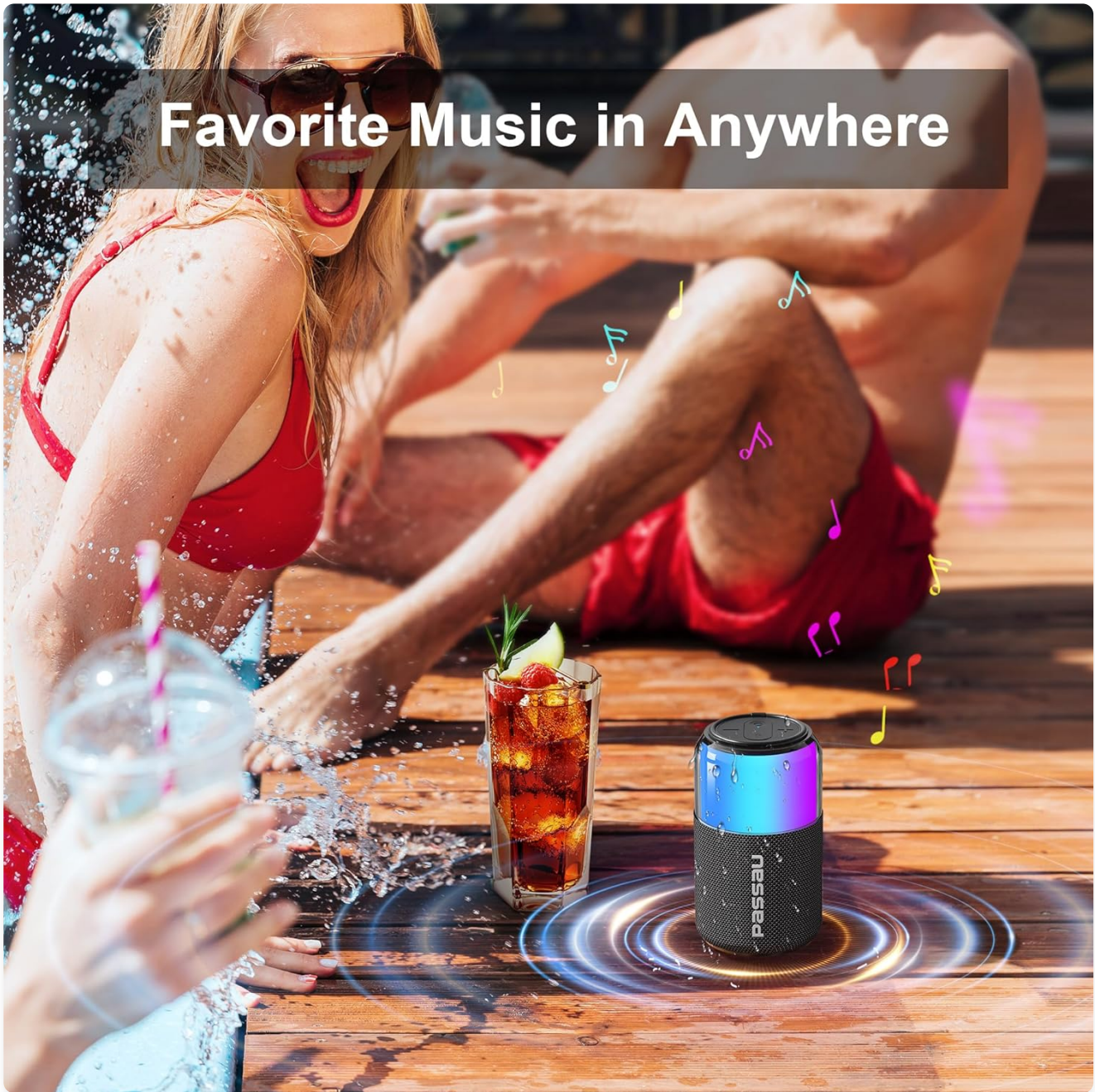
Image: The Passau S225B speaker placed near a swimming pool, illustrating its water-resistant design for outdoor enjoyment.