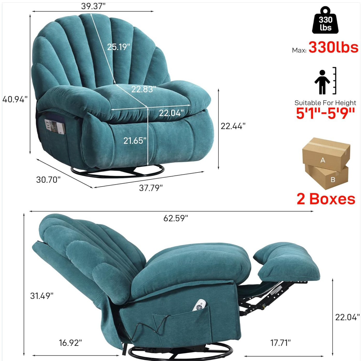
Figure 2: The recliner is shipped in two boxes, labeled A and B, which may arrive separately.