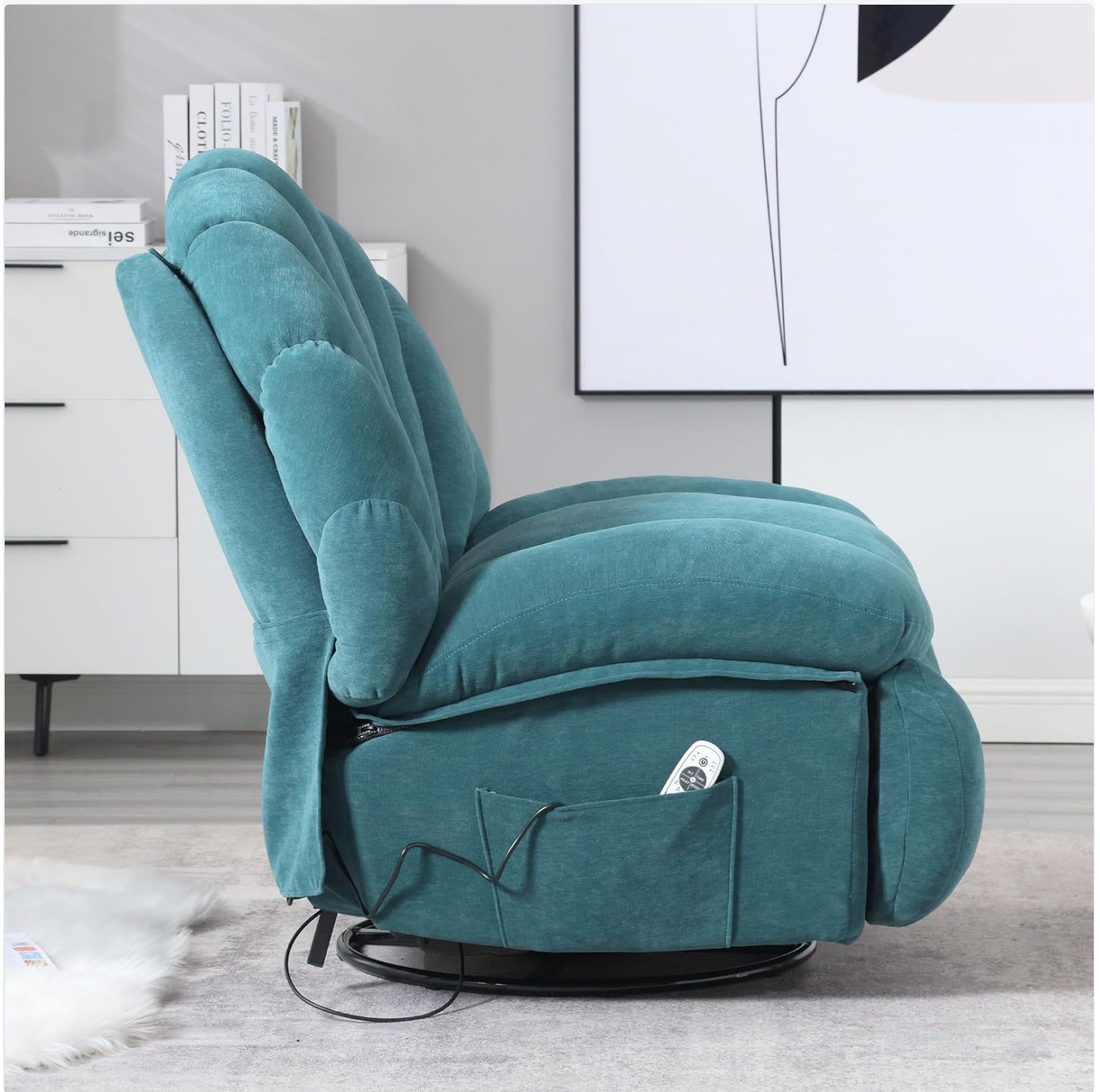
Figure 4: The recliner features convenient storage pockets on the armrests.

The recliner includes four oversized storage compartments, conveniently located on the sides of the armrests. These are ideal for storing remote controls, magazines, or other small items.