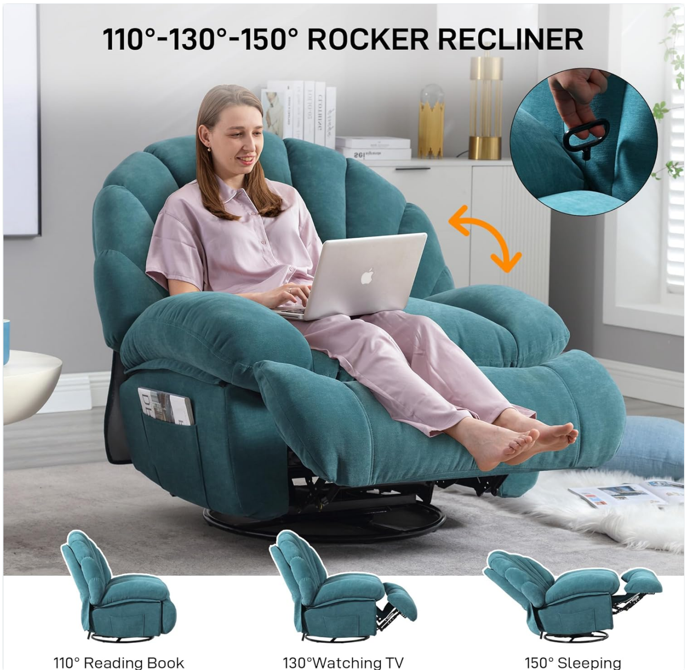
Figure 3: The recliner offers multi-angle adjustment for reading, TV watching, and sleeping.