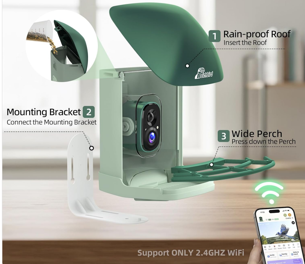
Image: A visual guide illustrating the simple assembly process of the bird feeder, including attaching the roof and perch.