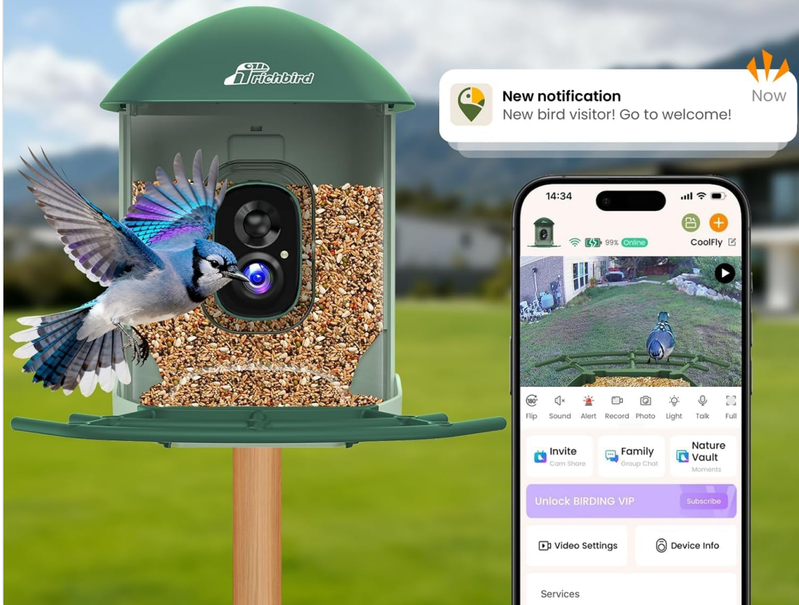
Image: A blue jay is shown at the feeder, with a smartphone screen illustrating the live video feed and instant notification feature.

Never miss a feathery visitor, bird watching anywhere and anytime