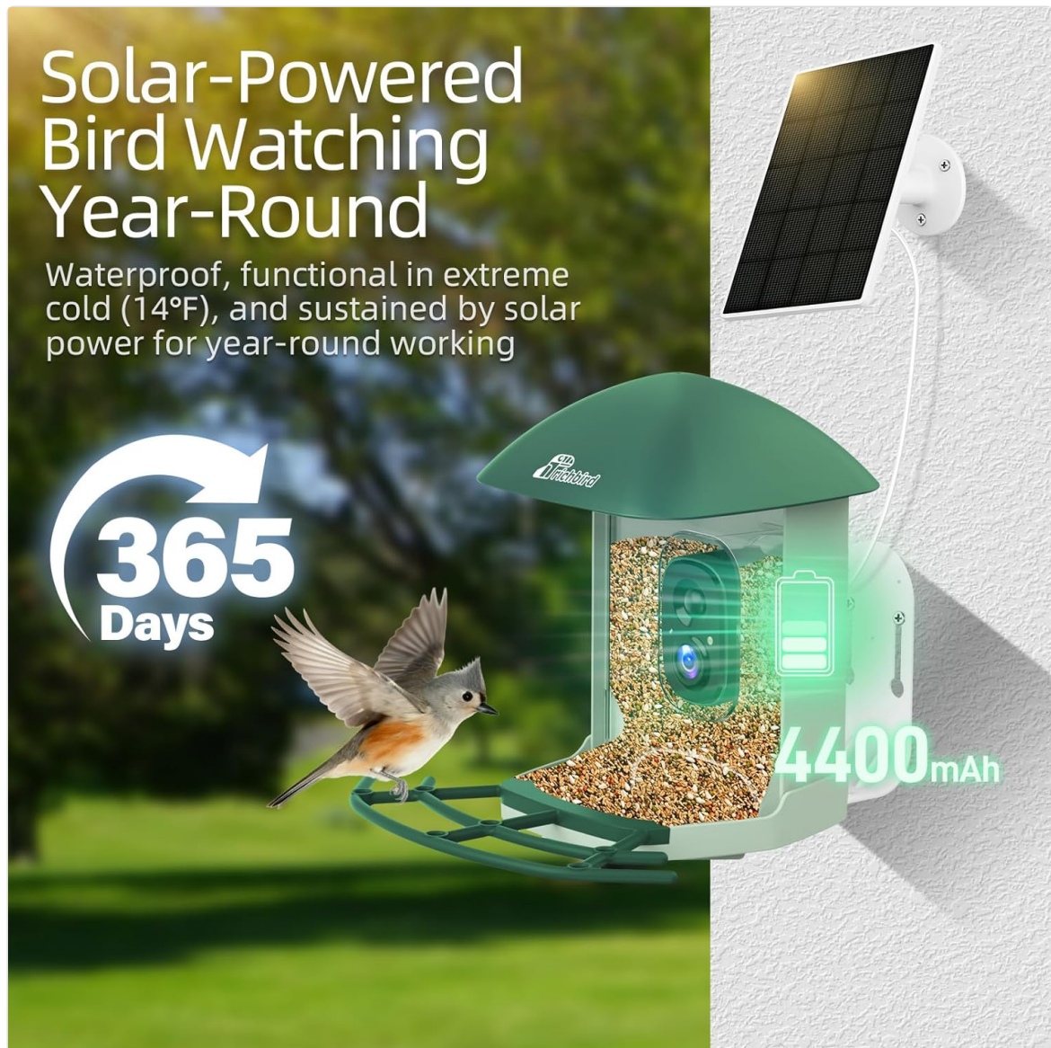
Image: The bird feeder is shown with its solar panel, highlighting its ability to operate year-round using renewable energy.

The feeder is equipped with a 4400mAh battery and a solar panel for continuous power. Connect the solar panel to the feeder's charging port to ensure sustainable operation without frequent manual charging.