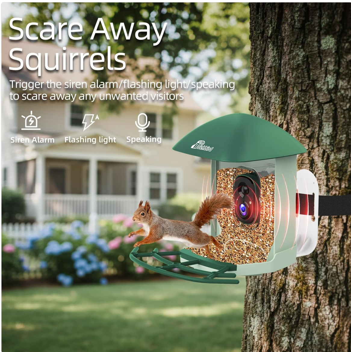
Image: A squirrel is shown near the feeder, with icons indicating the siren, flashing light, and two-way audio features for deterrence.