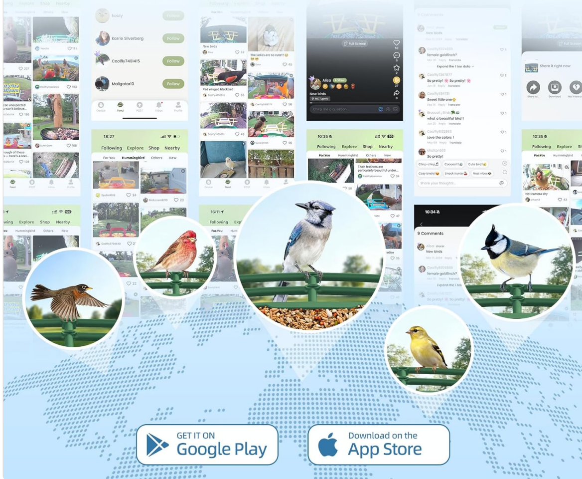
Image: Multiple smartphone screens showcasing the COOLFLY app's community features, where users can share and explore bird sightings.

Share your discovers and watch all kinds of birds from all over the world