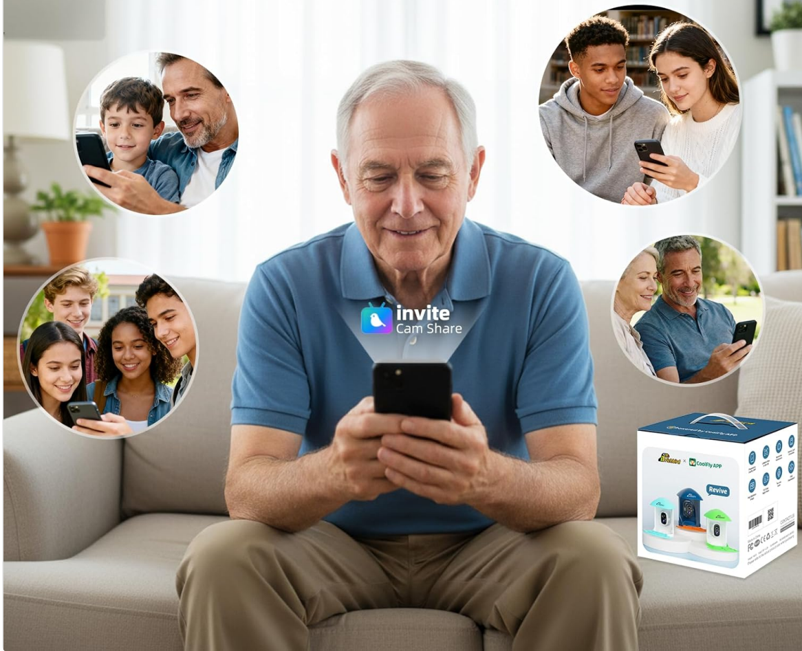
Image: Depicts multiple users enjoying live bird visits on their phones, emphasizing the shared viewing experience.