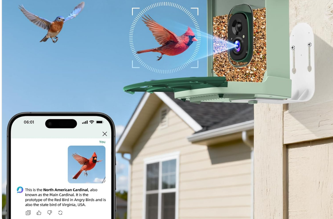
Image: A cardinal is featured at the feeder, demonstrating the AI bird recognition identifying the species on a mobile device.

Video: An official RichBird guide explaining the AI bird identification feature and how to use it within the app.