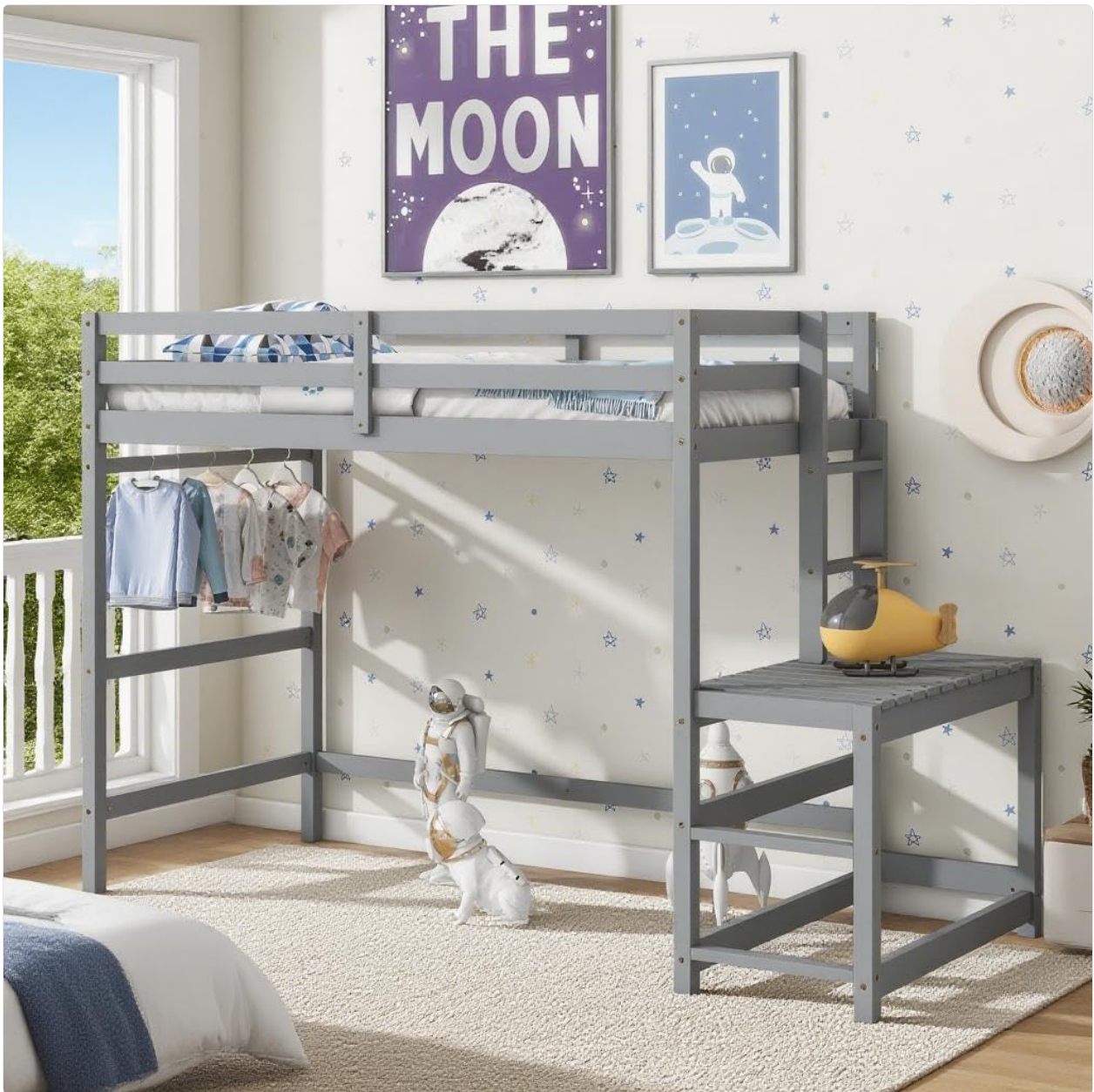
Image: The LINKHOO Twin High Loft Bed, showcasing its elevated design, integrated ladder, and the versatile space available beneath the sleeping area. The bed is grey and fits well in a child's bedroom setting.