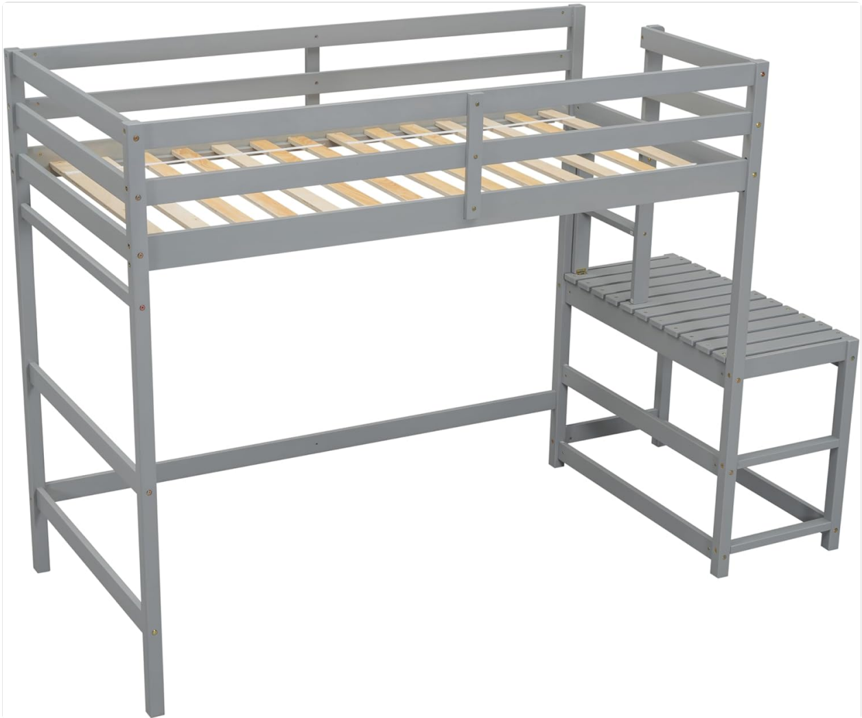
Image: A view of the LINKHOO Twin High Loft Bed frame components, illustrating the wooden structure and bed slats prior to full assembly.

Important Safety Note: Ensure the bed is placed on a level surface. Regularly check all connections to confirm they remain tight and secure.