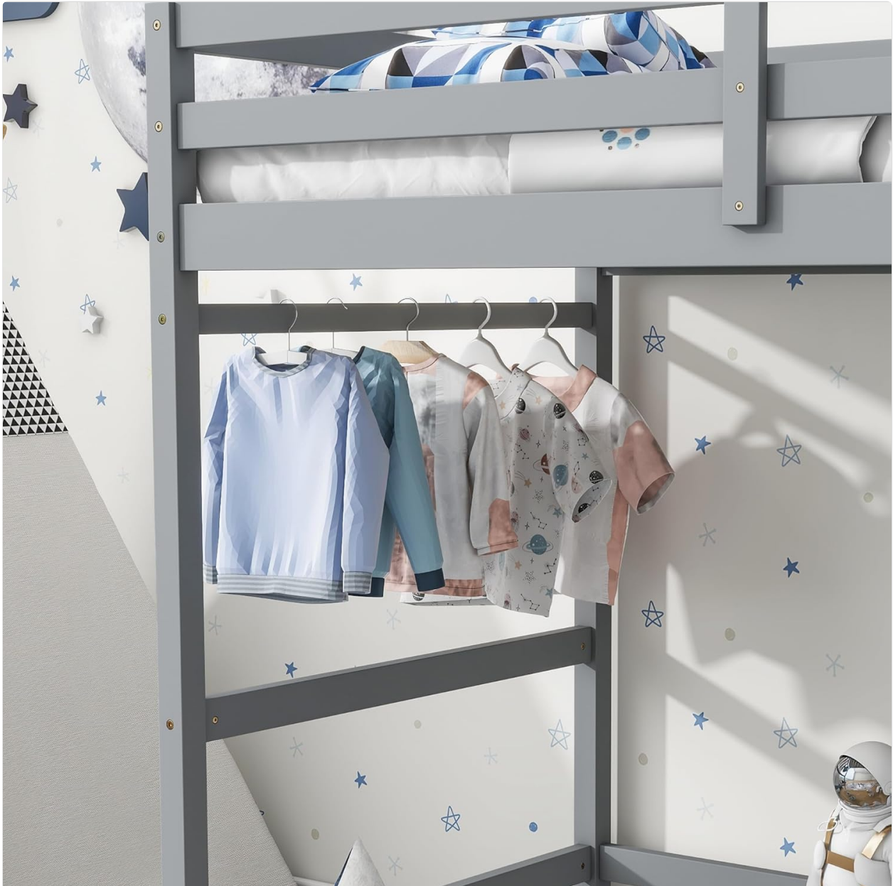
Image: The under-bed area of the LINKHOO Twin High Loft Bed, illustrating its potential for practical use, such as hanging clothes, highlighting its space-saving design.