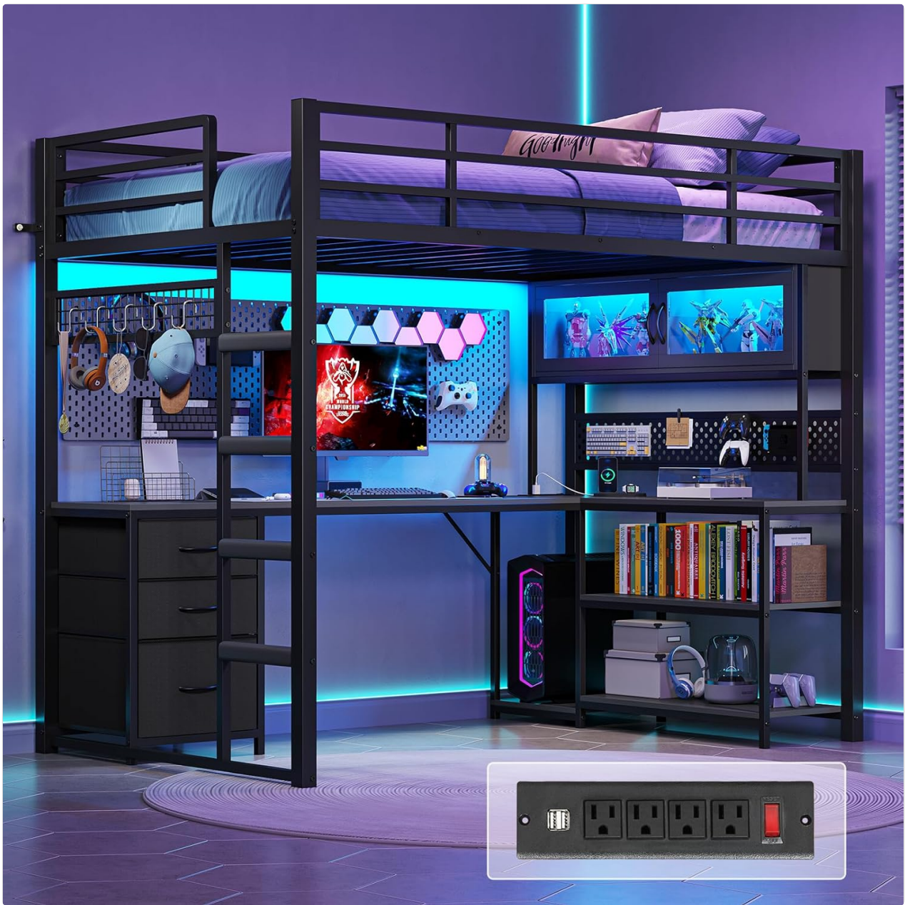
Figure 1.1: Overview of the ADORNEVE Twin Size Loft Bed, showcasing the integrated L-shaped gaming desk, storage drawers, hutch, and RGB lighting.