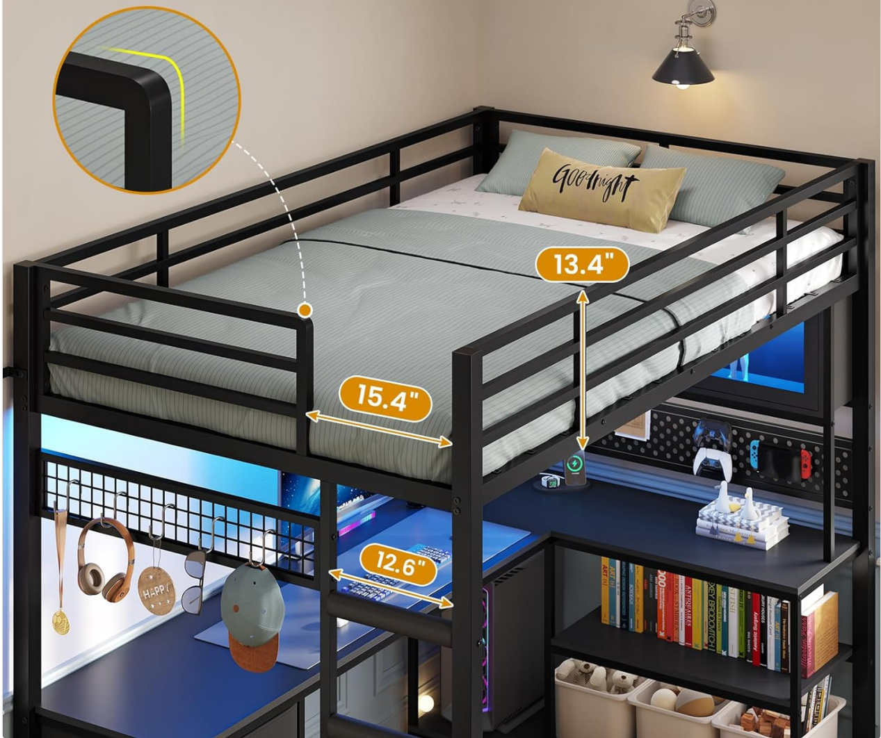
Figure 2.2: Detail of the 13.4-inch full-length enclosed safety rail, designed to prevent falls from the bed.