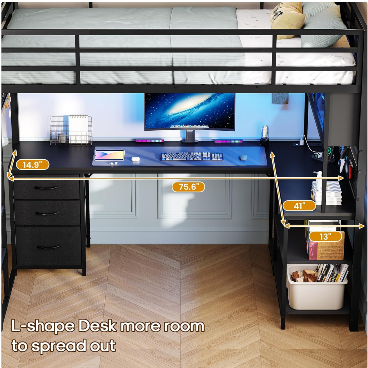
Figure 8.2: Specific dimensions of the L-shaped desk, highlighting the 75.6-inch length and 41-inch width for the workspace.