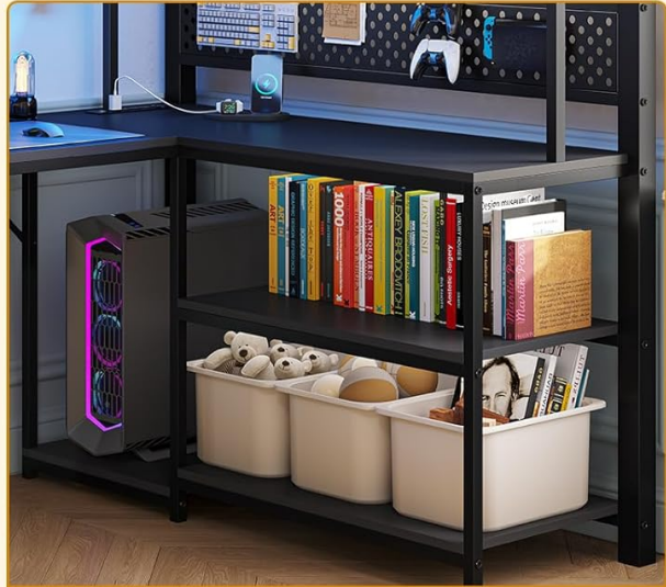
3 Shelves for tower, books and ect