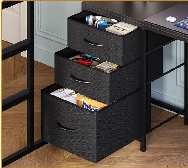
3 various sized drawers