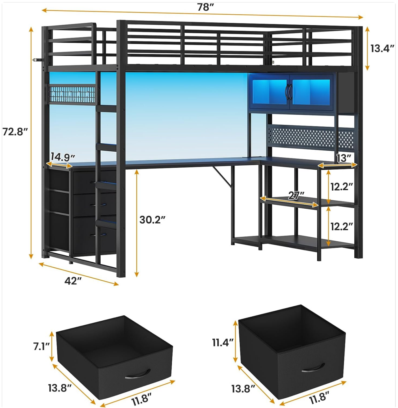
Figure 8.1: Comprehensive dimensions of the ADORNEVE Twin Size Loft Bed, including bed frame, desk, and drawer measurements.