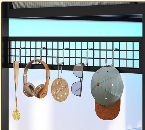
Grid for s-clips to hang stuff from