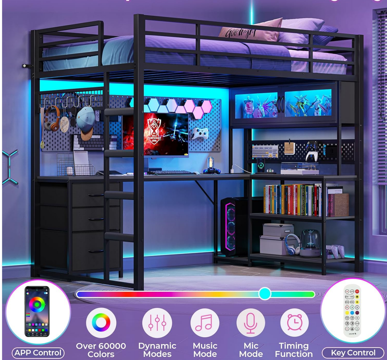
Figure 5.4: The RGB ambient lighting system, illustrating control options via mobile app and remote, with various color and mode capabilities.