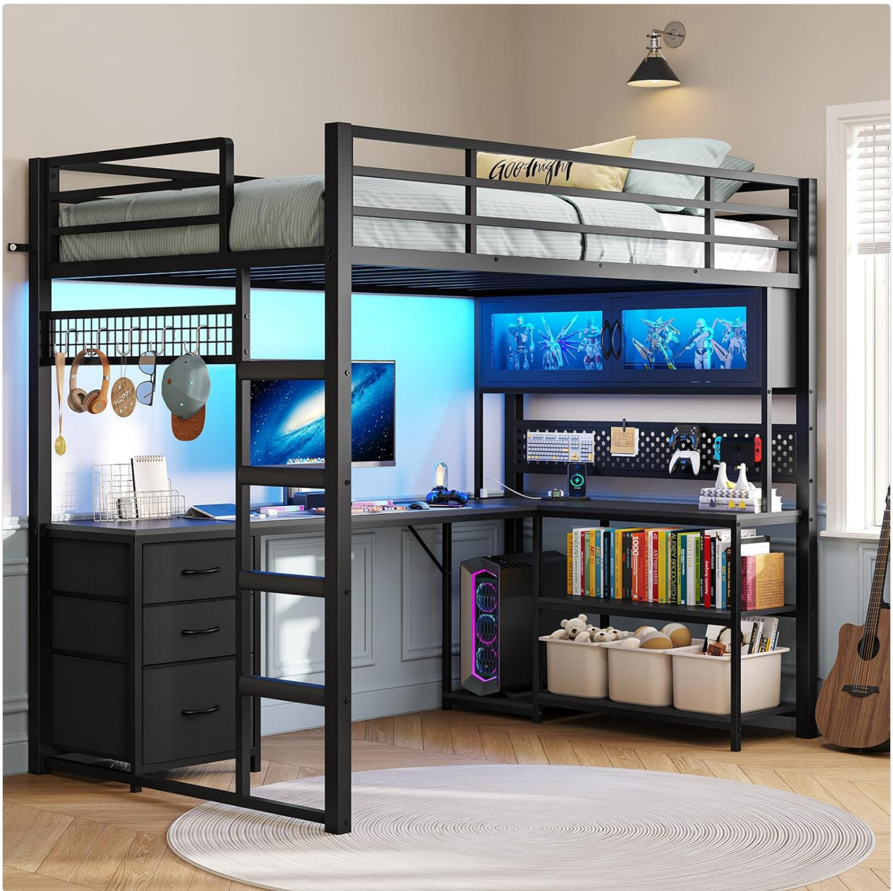
Figure 4.1: The fully assembled ADORNEVE Twin Size Loft Bed, ready for use.