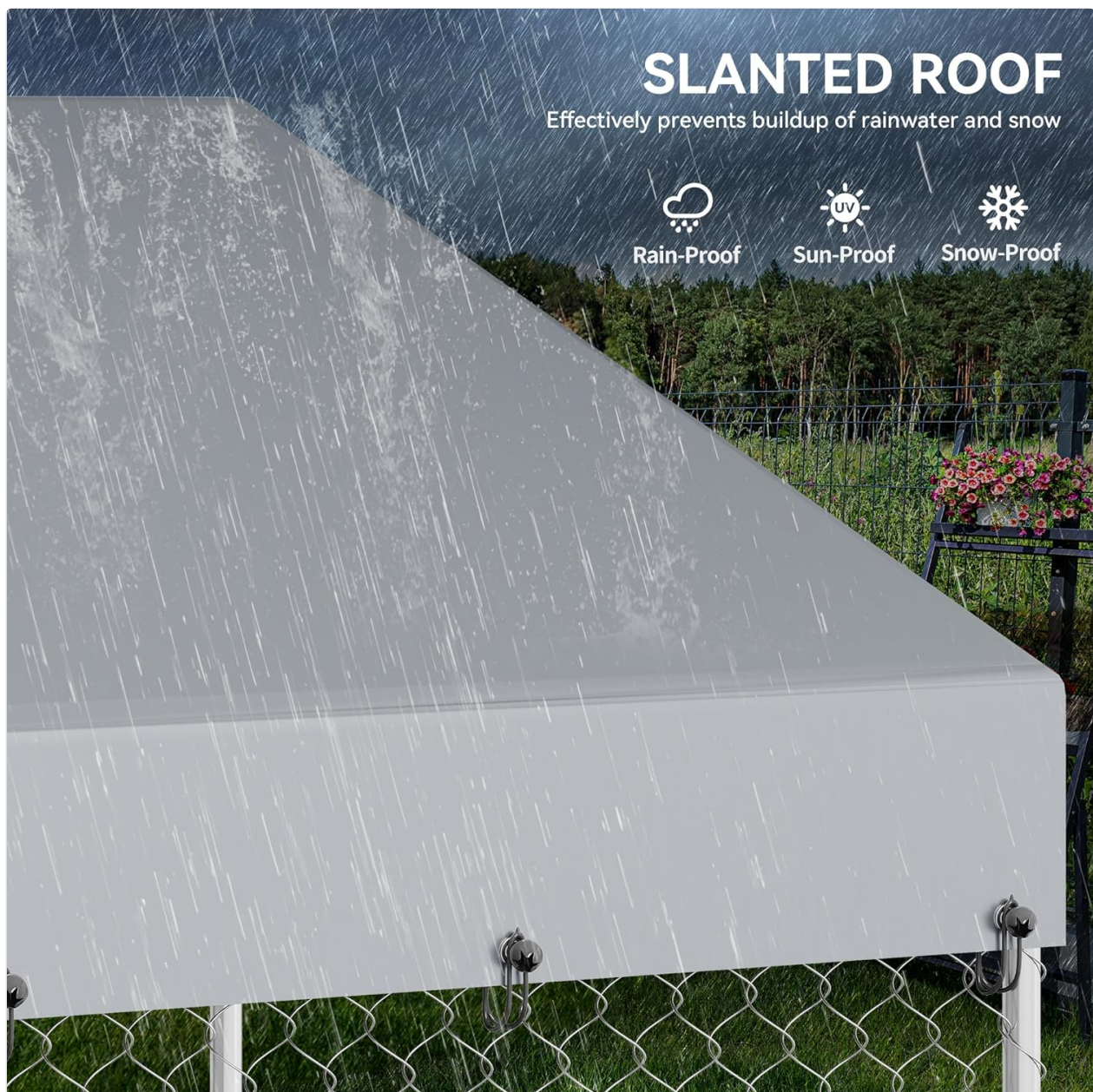
Figure 3: Slanted roof design for effective water and snow runoff.

This image highlights the slanted roof design, which effectively prevents the buildup of rainwater and snow, providing continuous protection for your pets.