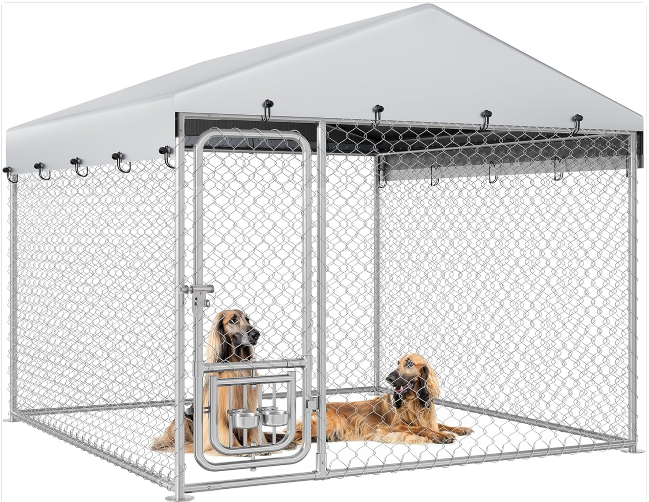
Figure 1: Overview of the YITAHOME Outdoor Dog Kennel (7.5'x7.5' model).

This image displays the complete YITAHOME Outdoor Dog Kennel, showcasing its spacious interior and sturdy construction. Two dogs are comfortably resting inside, highlighting the ample room available for pets.