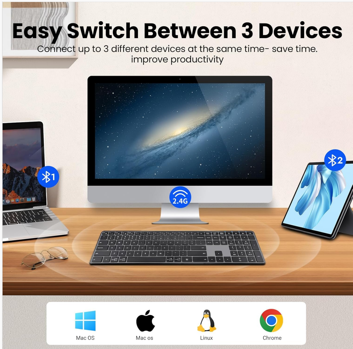
Image: The Bnnwa K925 keyboard positioned on a desk, simultaneously connected to a laptop via Bluetooth, a desktop computer via 2.4GHz USB, and a tablet via Bluetooth, demonstrating its multi-device capability.