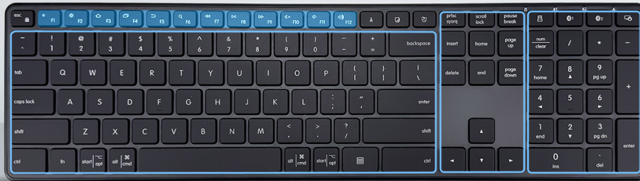
Image: The Bnwa K925 keyboard with the F1-F12 keys highlighted, showing their respective multimedia and function icons.