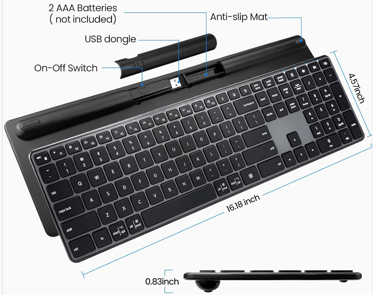
Image: The back of the Bnnwa K925 keyboard, illustrating the location of the battery compartment, the storage slot for the nano USB receiver, and the power on/off switch.