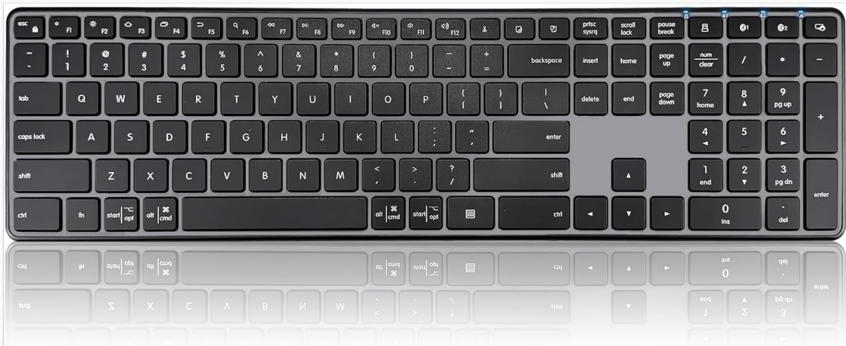
Image: A clear, top-down view of the Bnwa K925 full-size wireless keyboard, showcasing its complete QWERTY layout and numeric keypad.

The K925 features a standard QWERTY layout with a full numeric keypad. The scissor-switch keys provide a responsive and quiet typing experience.