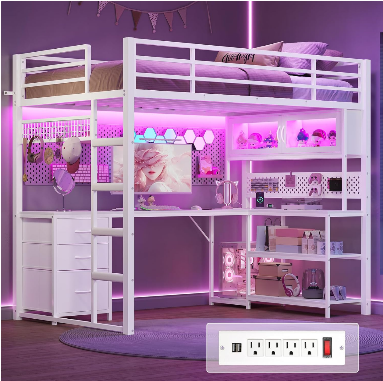
Figure 4.1: Assembled ADORNEVE Twin Size Loft Bed with L-shaped desk and RGB lighting.