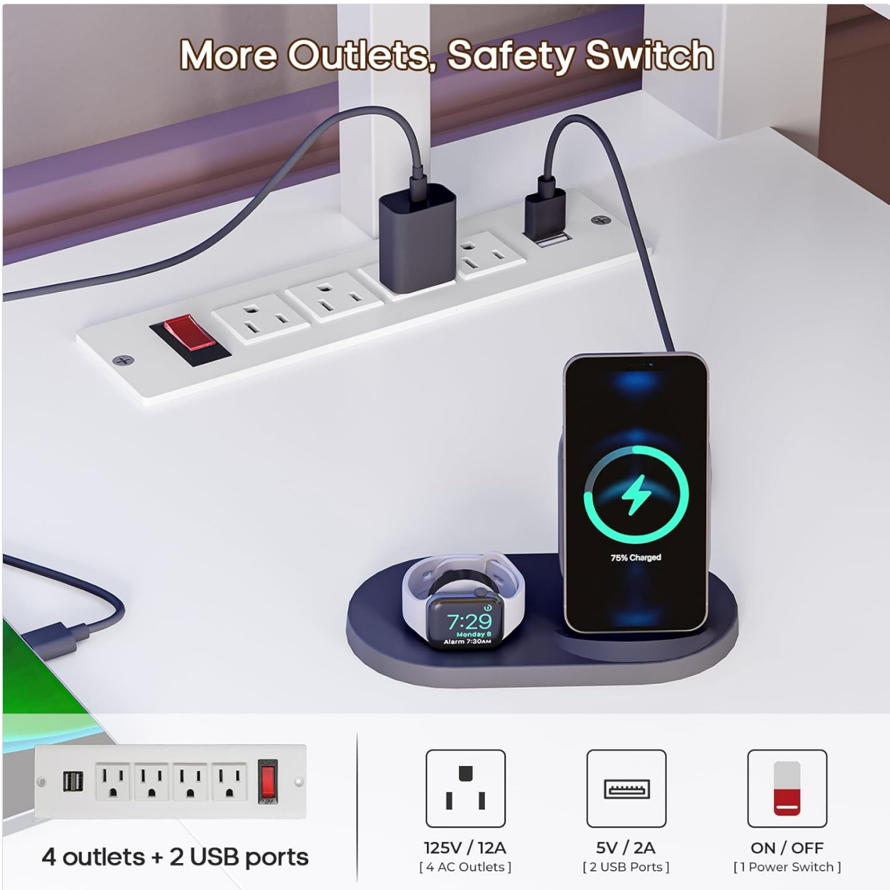
Figure 5.2: Integrated power outlet with safety switch.