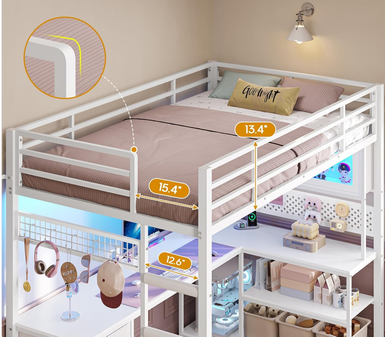
Figure 4.3: Safety guardrails and wide-step ladder.