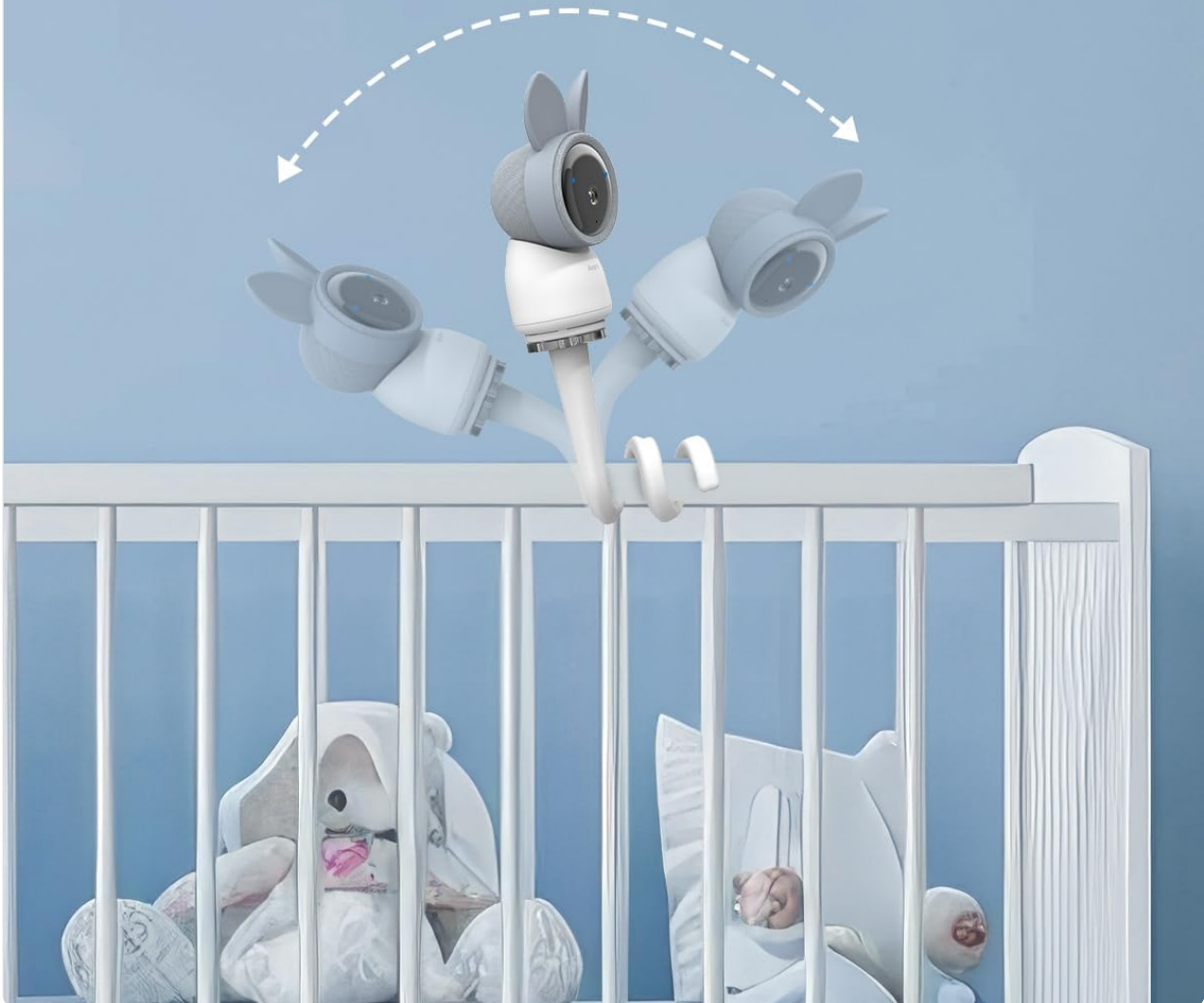
Image: The flexible gooseneck allows for a wide range of adjustments, enabling you to position the camera for the optimal view of your baby in the crib.