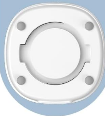
Image: The mount is designed to fit various ARENTI camera models, including Alnanny A4, D3, B2, P2T, P2Q, and P2F, by attaching to their respective base plates.