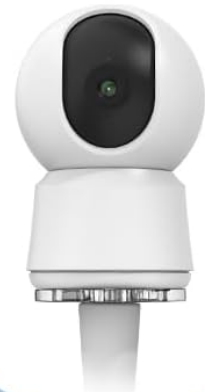
P2T P2Q P2F