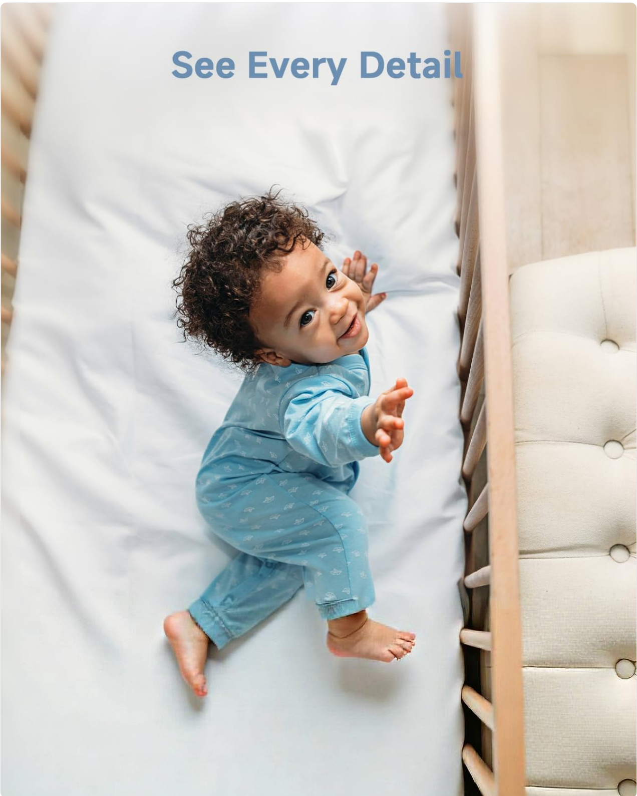
Image: A clear view of a baby in a crib, demonstrating the effective monitoring capability provided by the properly positioned mount.