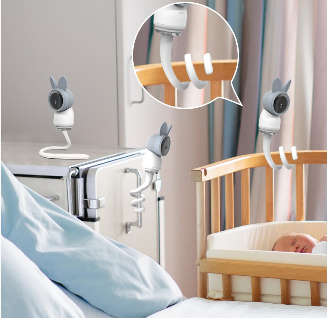
Image: Examples of how the flexible gooseneck can be positioned and secured to different furniture pieces like a crib or a bedside table.