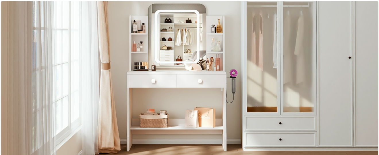
Image: Illustrates the storage capacity for cosmetics, skincare, and jewelry within the vanity's drawers and shelves.