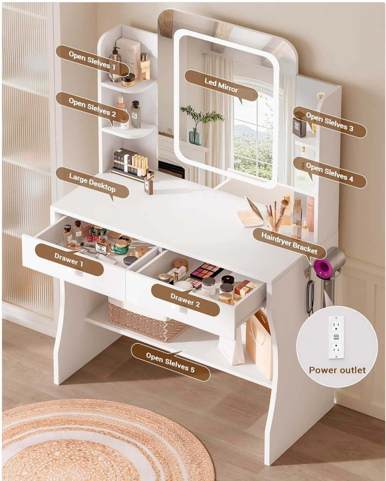
Image: Overview of the LIVELYGLOW Vanity Desk with key components labeled for easy identification during assembly.