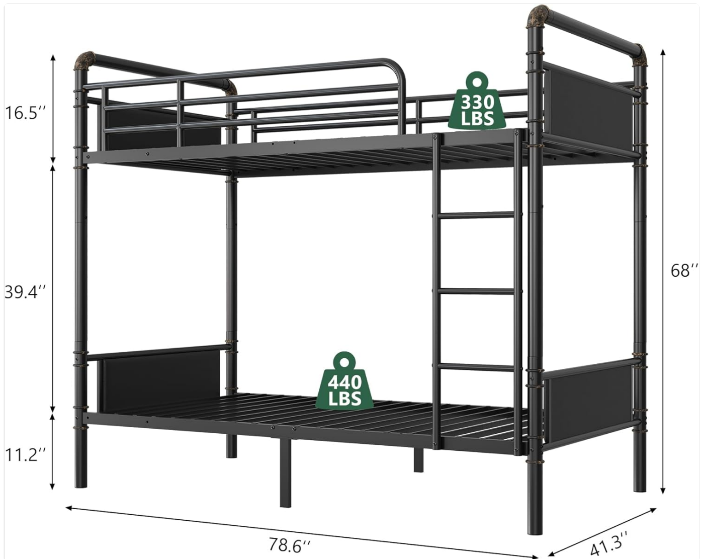
Image 2.1: Product dimensions and indicated weight capacities for both the top (330 lbs) and bottom (440 lbs) bunks.