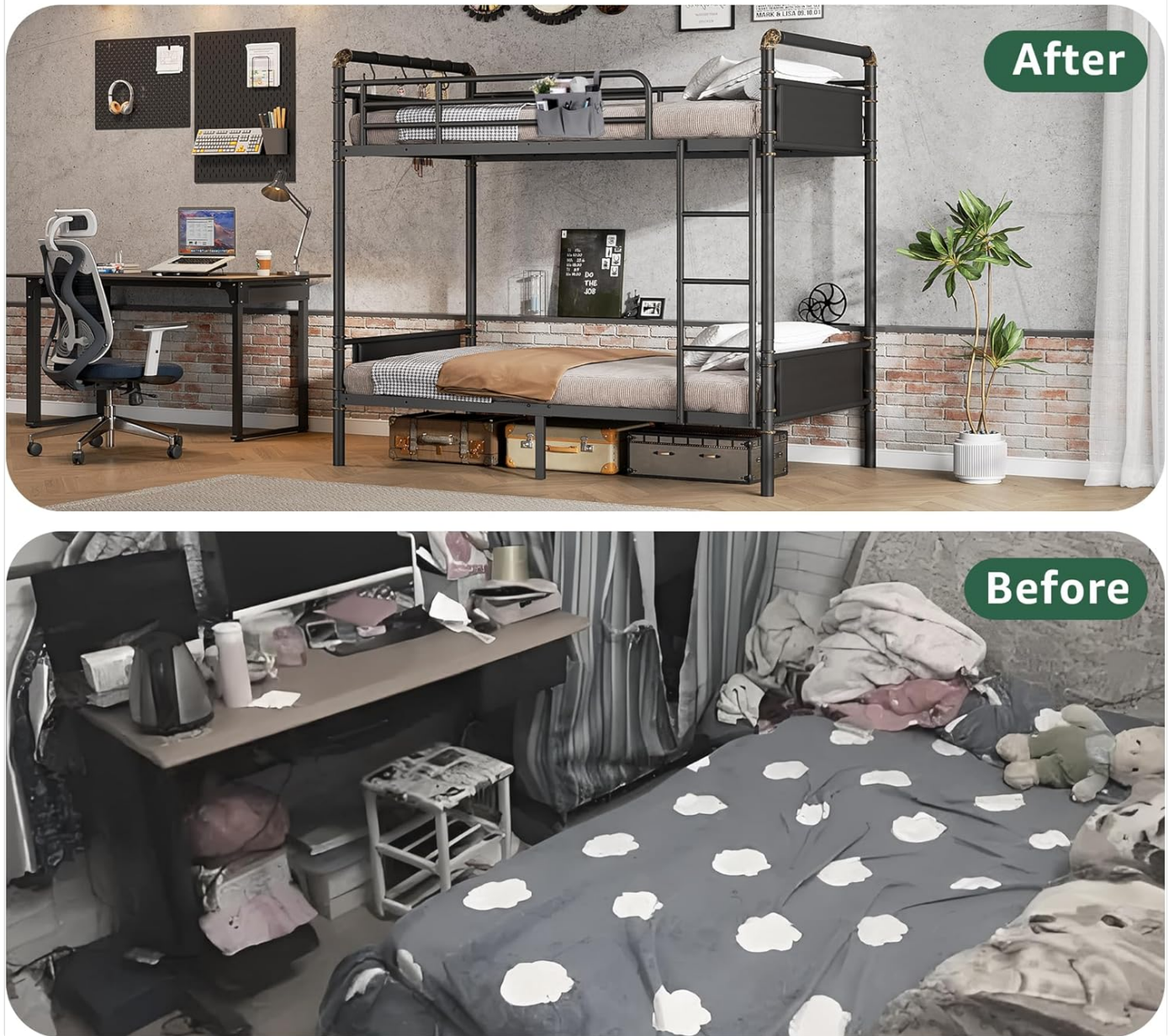
Image 5.4: A visual comparison showing how the 11.2-inch under-bed storage space helps organize a room.