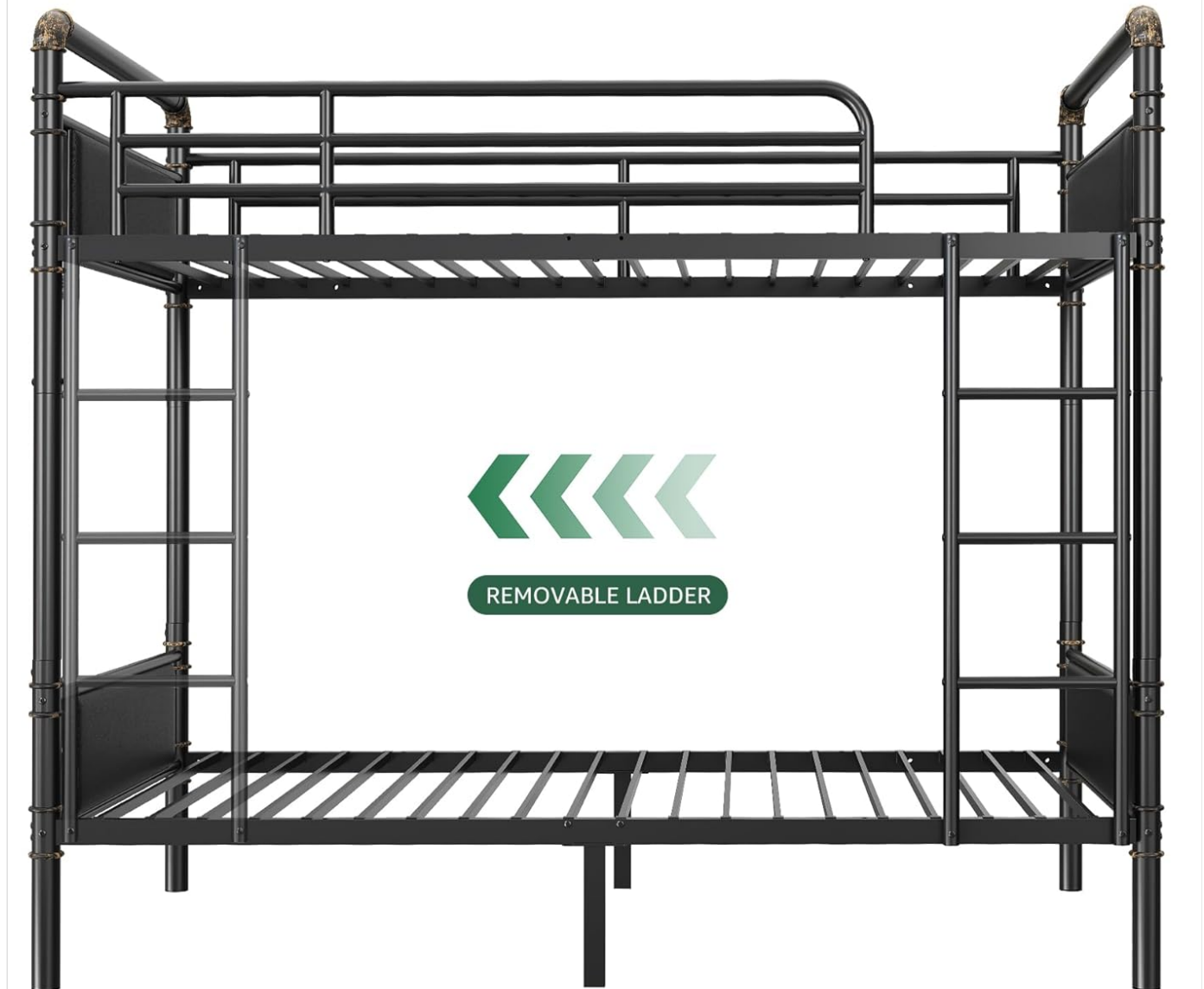
Image 4.1: The removable ladder can be attached to either side of the bunk bed to suit different room configurations.

Adjust the Ladder Installation Angle According to the Room Design