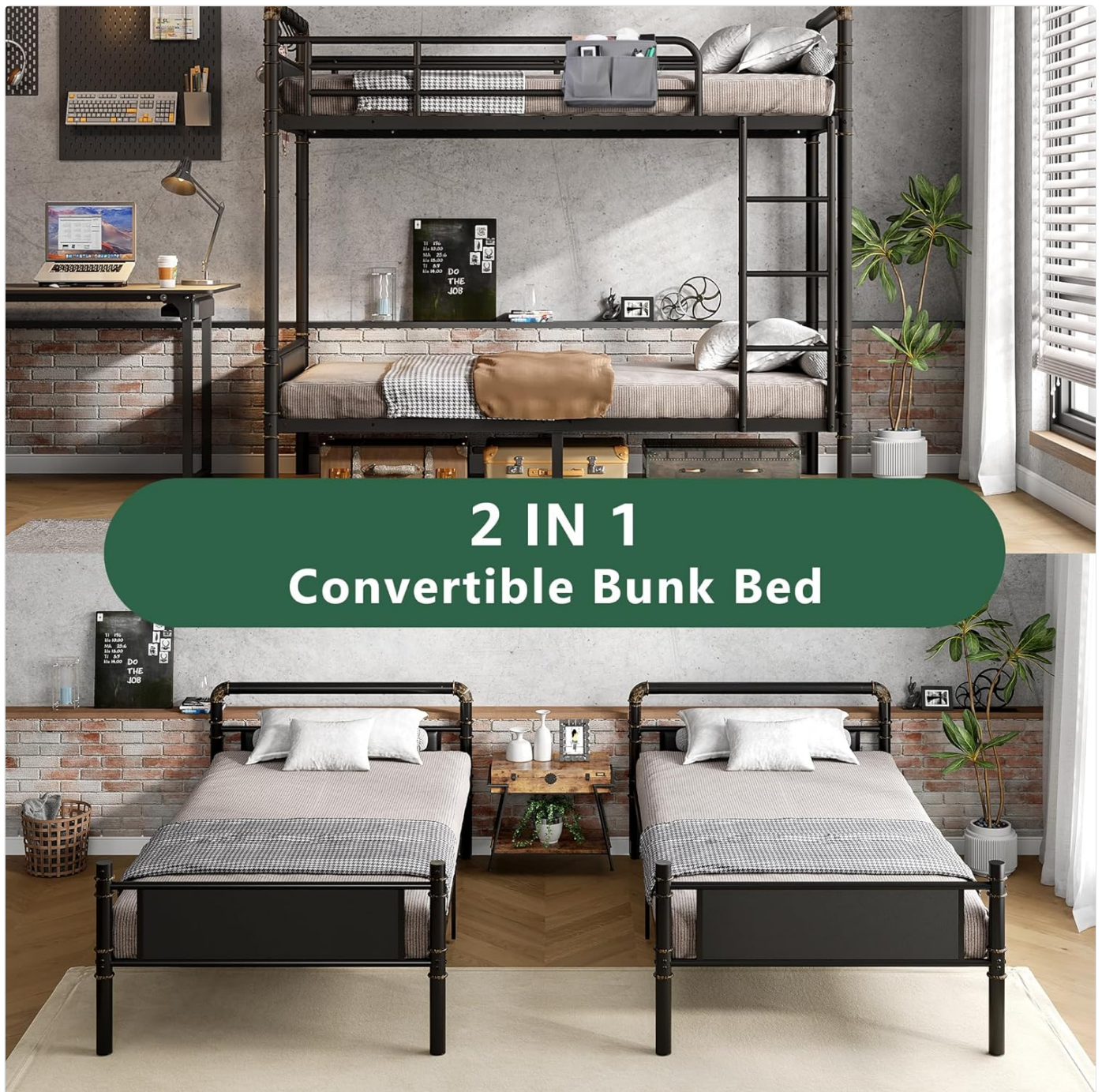
Image 5.1: Illustration of the bunk bed's ability to convert into two independent twin beds.

The Jocoevol bunk bed can be easily converted into two separate twin beds. This feature provides flexibility for changing family needs or room layouts.