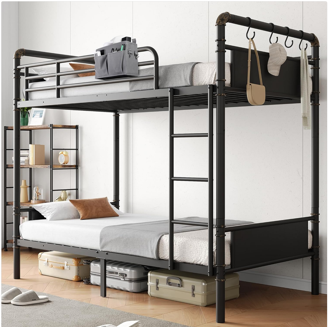
Image 1.1: The Jocoevol Twin Over Twin Bunk Bed, showcasing its design and under-bed storage capability.