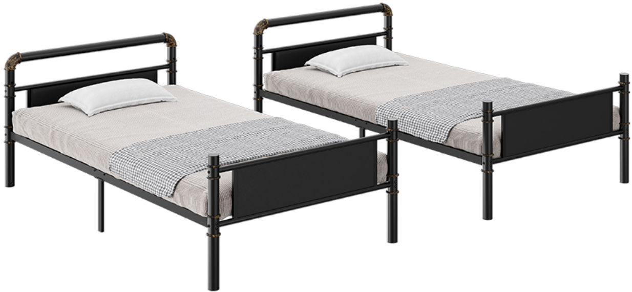
Image 8.1: Visual summary of key product specifications and features.

Conveniently Converts into 2 Twin Size Bed