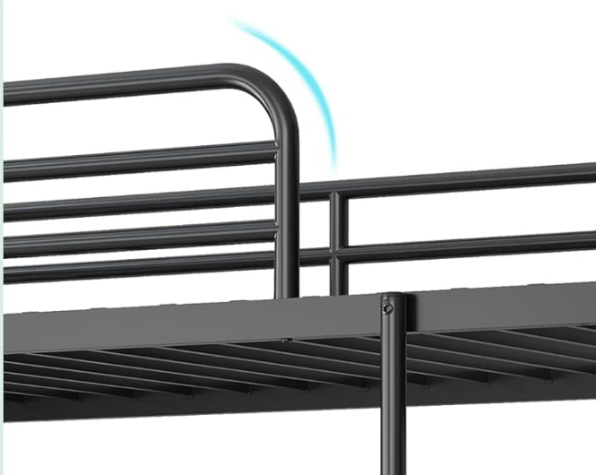
Image 5.2: Detailed view of the bedside storage organizer, movable hooks, high safety guardrails, and rounded corners for enhanced safety.