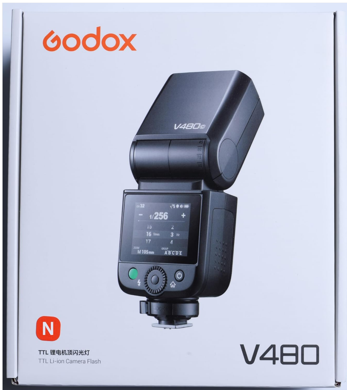
Figure 4: The 2.0-inch color touchscreen and tactile buttons provide intuitive control over flash settings.