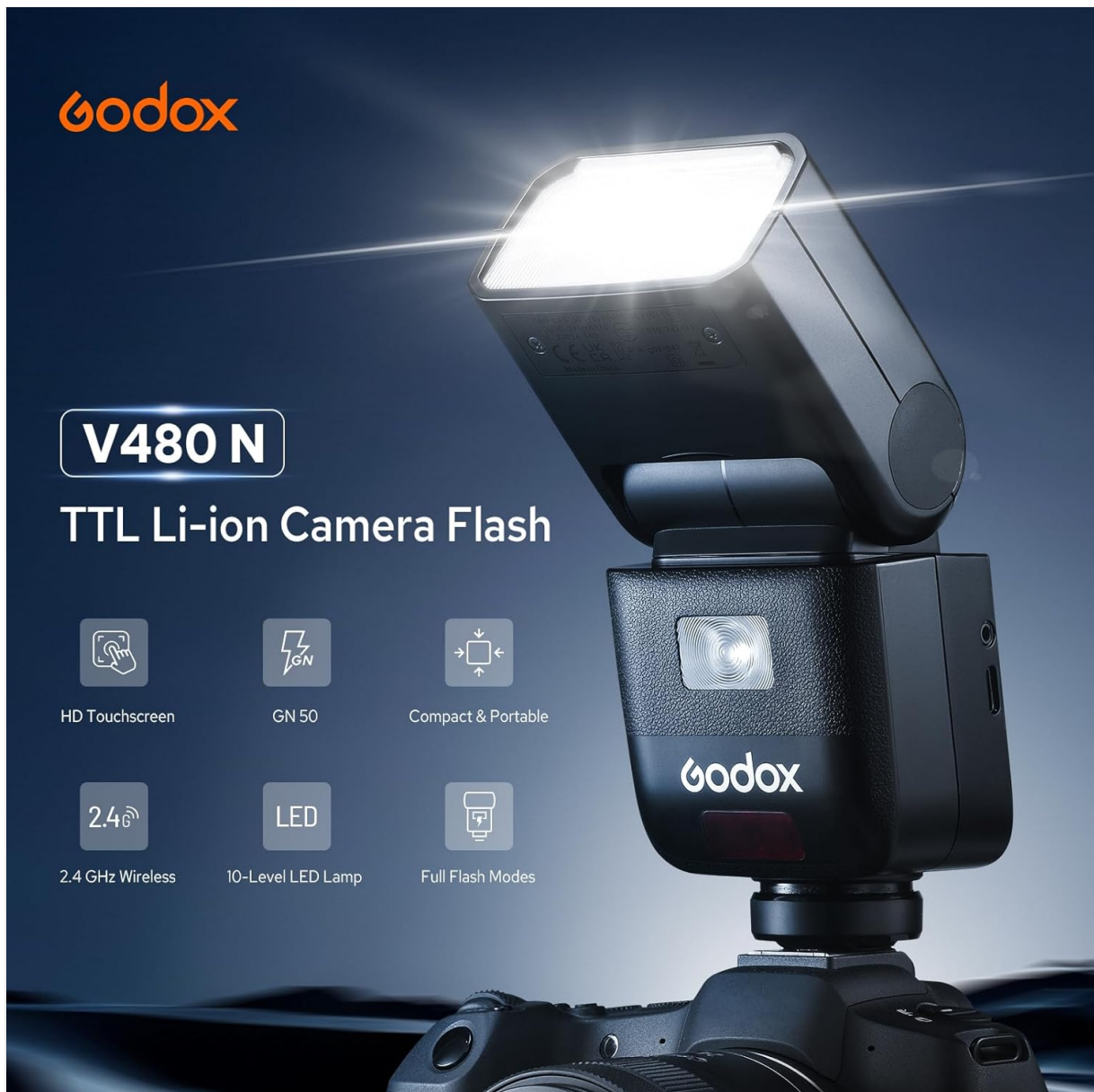
Figure 3: The Godox V480N TTL Flash securely mounted on a Nikon camera's hot shoe.