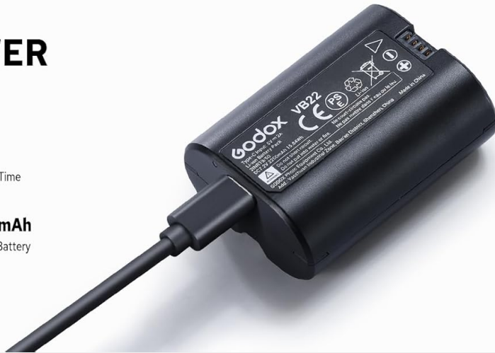
Figure 2: The V480N uses a 7.2V/2200mAh rechargeable lithium battery, which can be charged via USB-C.