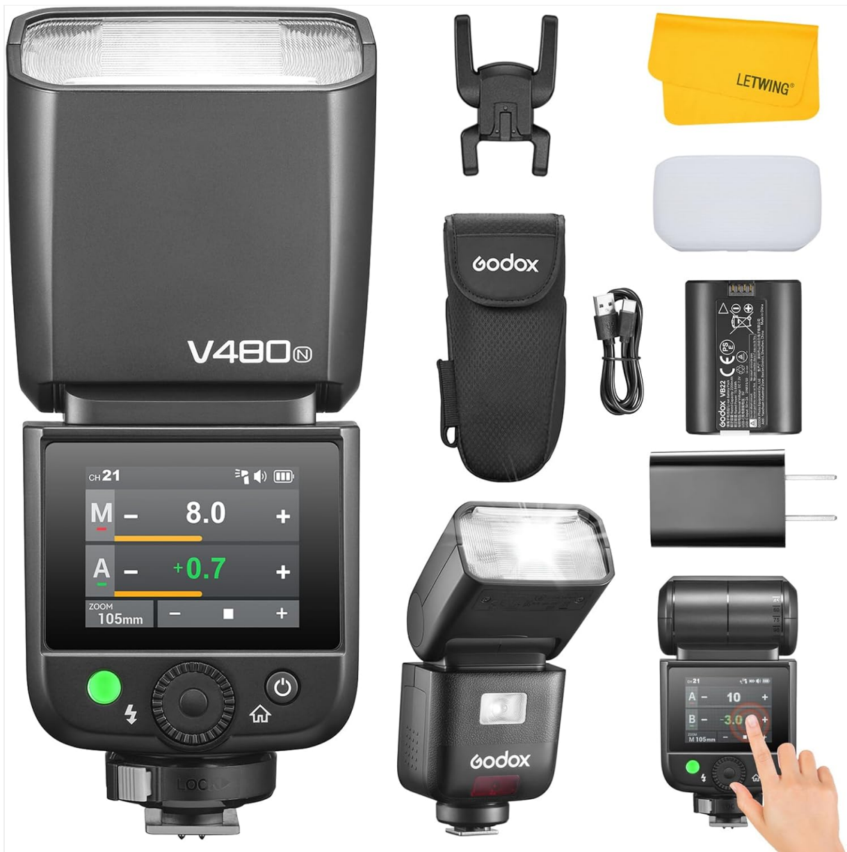
Figure 1: Godox V480N TTL Flash unit with included accessories including a mini stand, diffuser, storage bag, adapter, lithium battery, and USB-C charging cable.