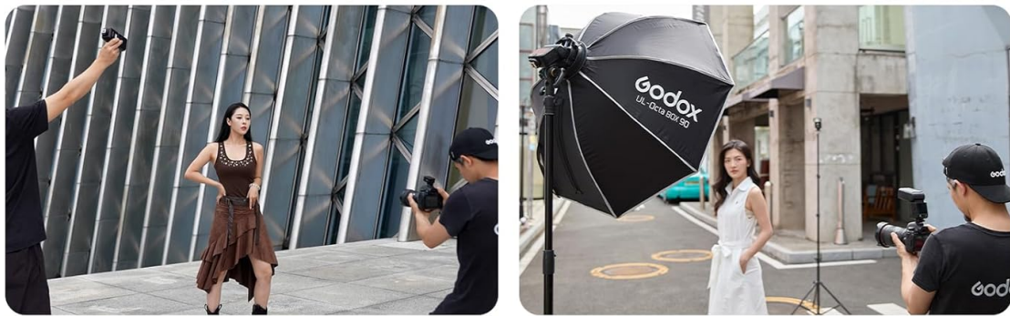
Figure 6: The V480N integrates with the Godox 2.4G X wireless system, allowing it to function as both a sender and receiver.