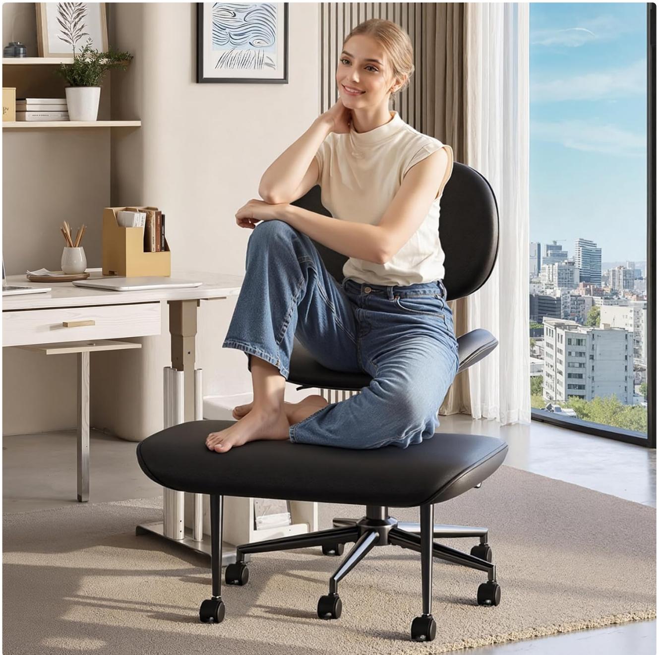
Figure 1: Pinmoco Upgraded Cross-Legged Office Chair in use.