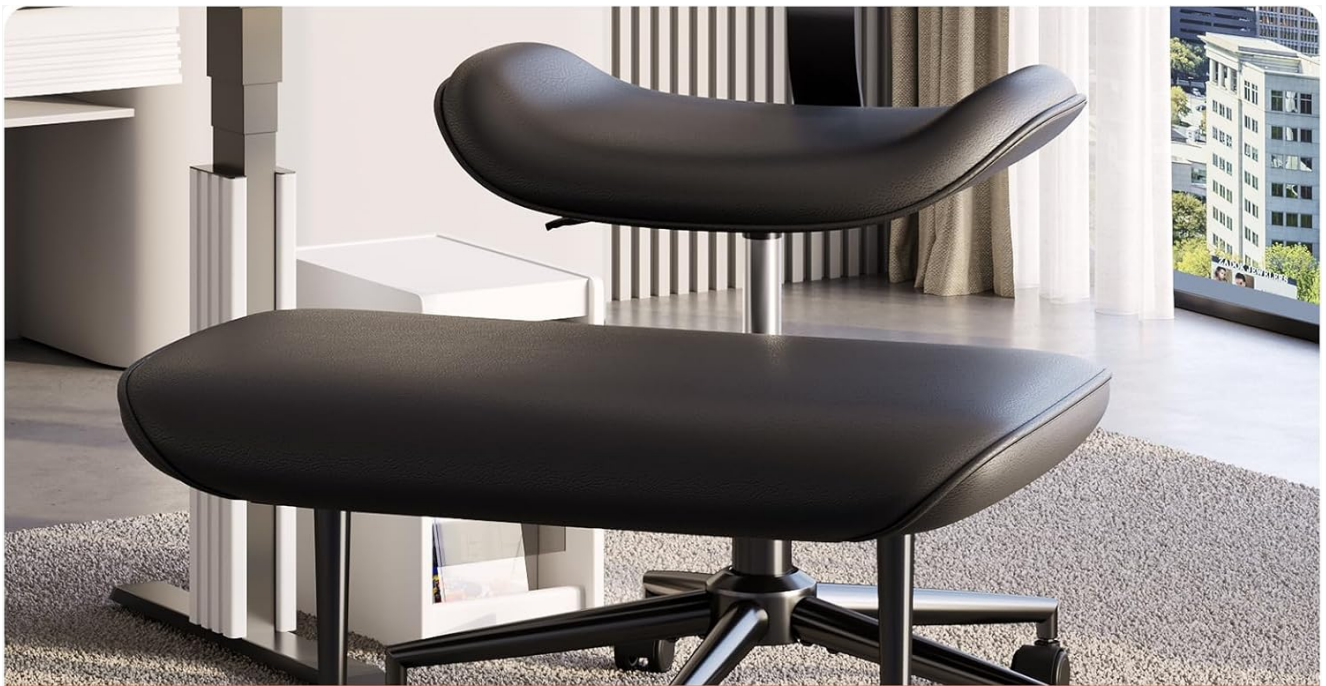
Luxury Faux PU Leather