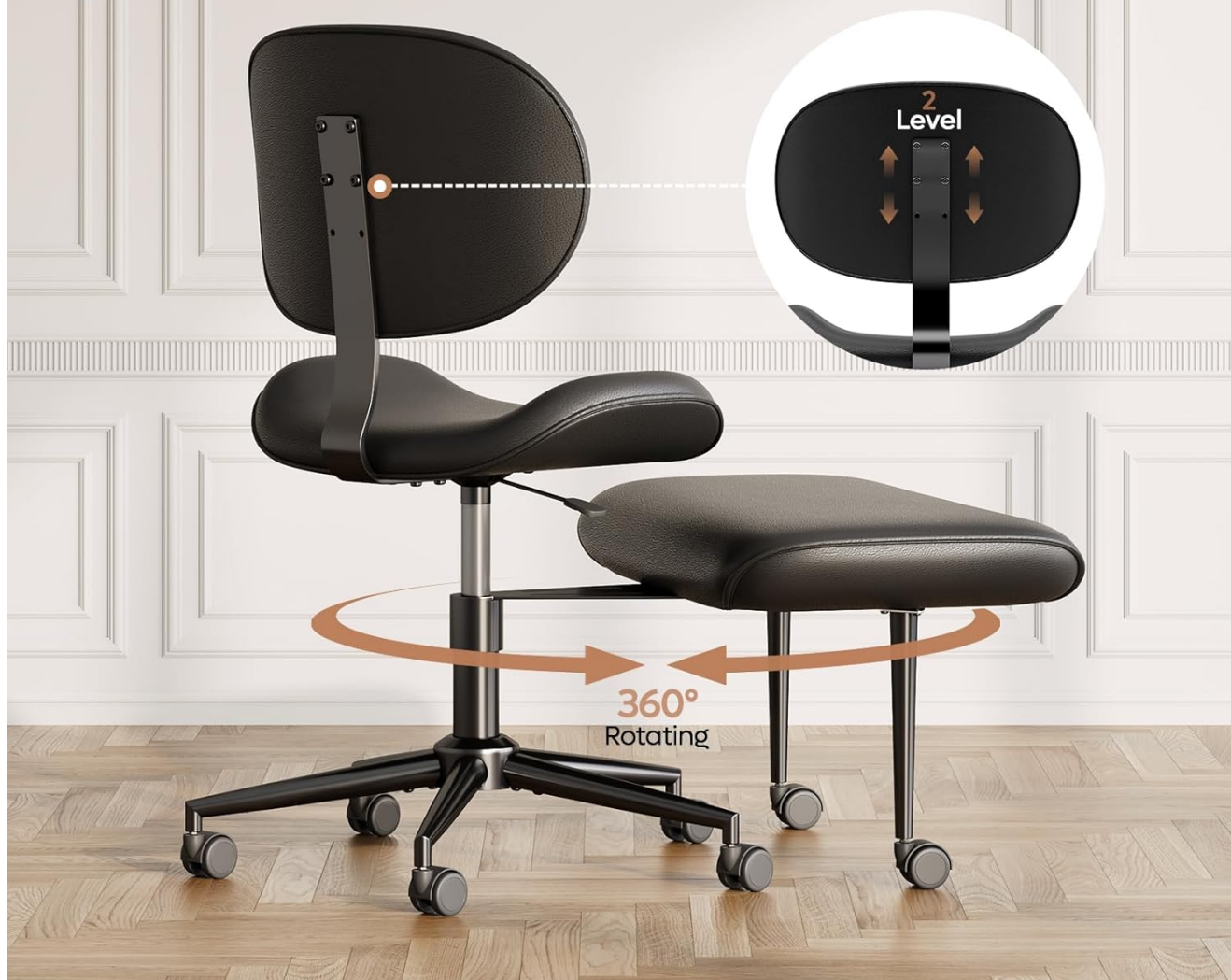
Figure 3: Backrest adjustment and 360-degree rotation features.

Designed to align with perfectly your body's natural posture