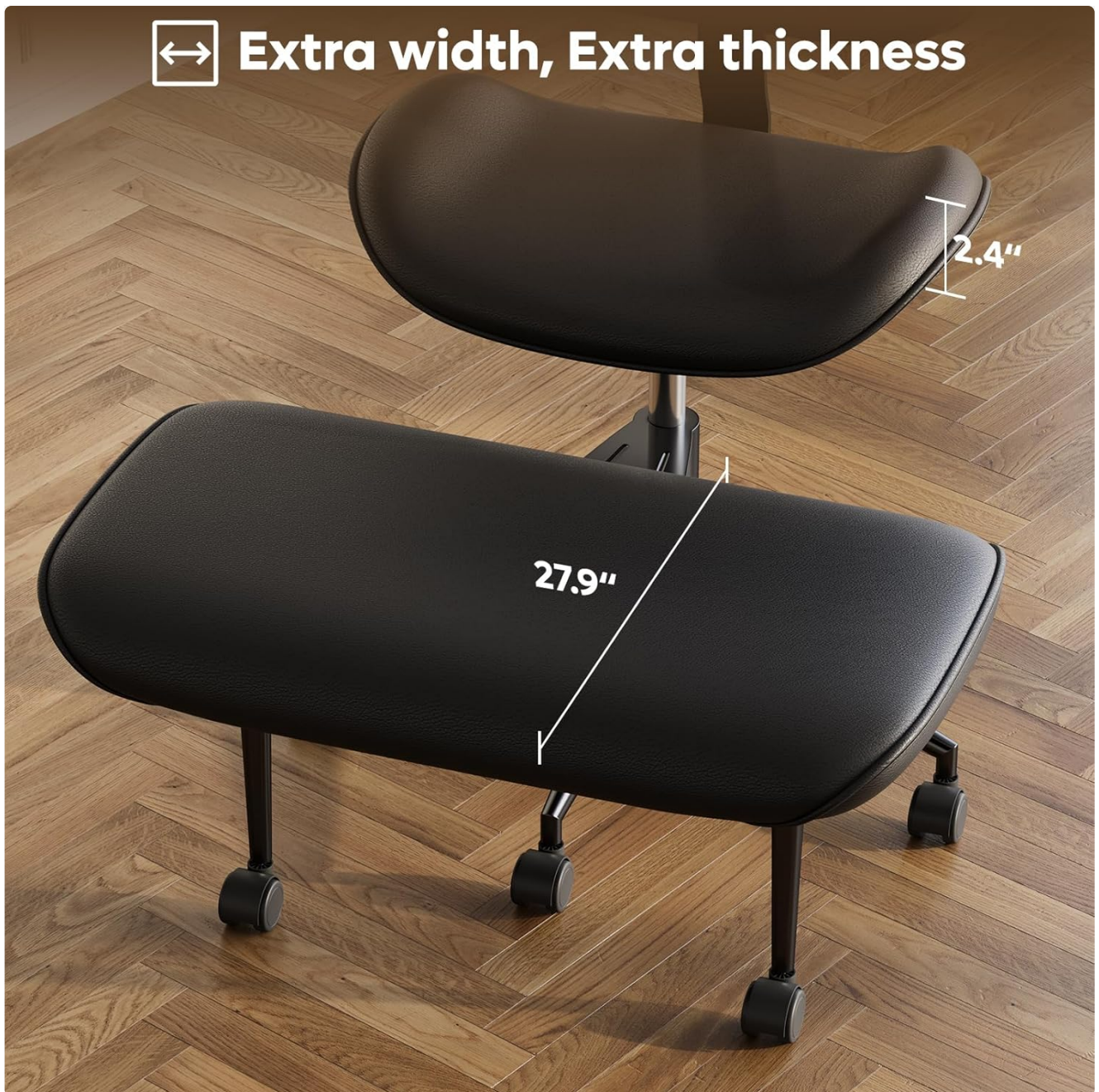
Figure 5: Detail of the extra-wide and thick seat and footrest for enhanced comfort.