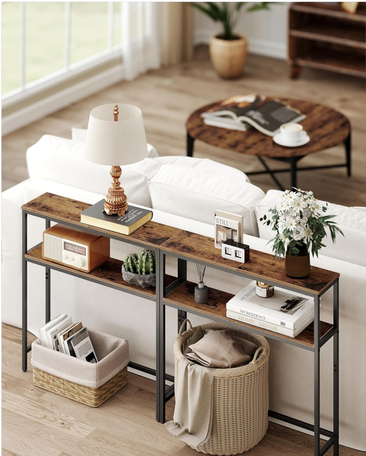
Figure 5: Console Table Used Behind a Sofa