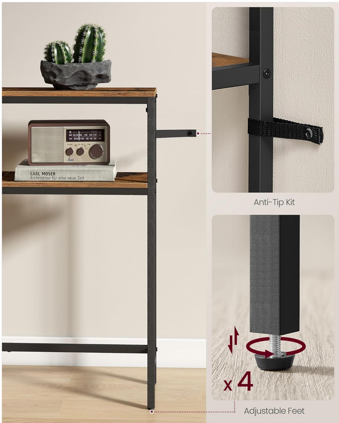
Figure 3: Sturdy Build and Easy-to-Clean Surface