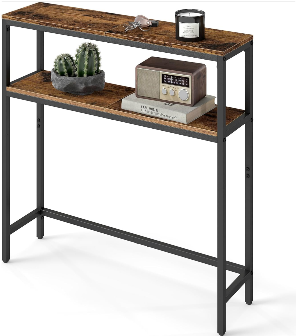
Figure 2: Fully Assembled Console Table