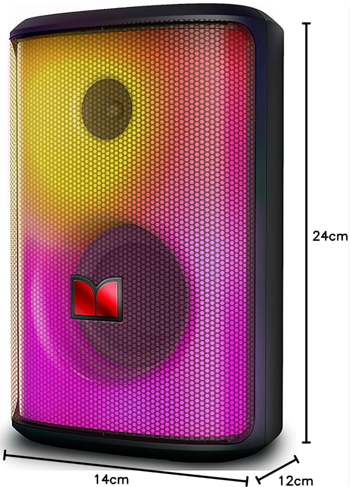
Physical dimensions of the Monster Sparkle speaker.