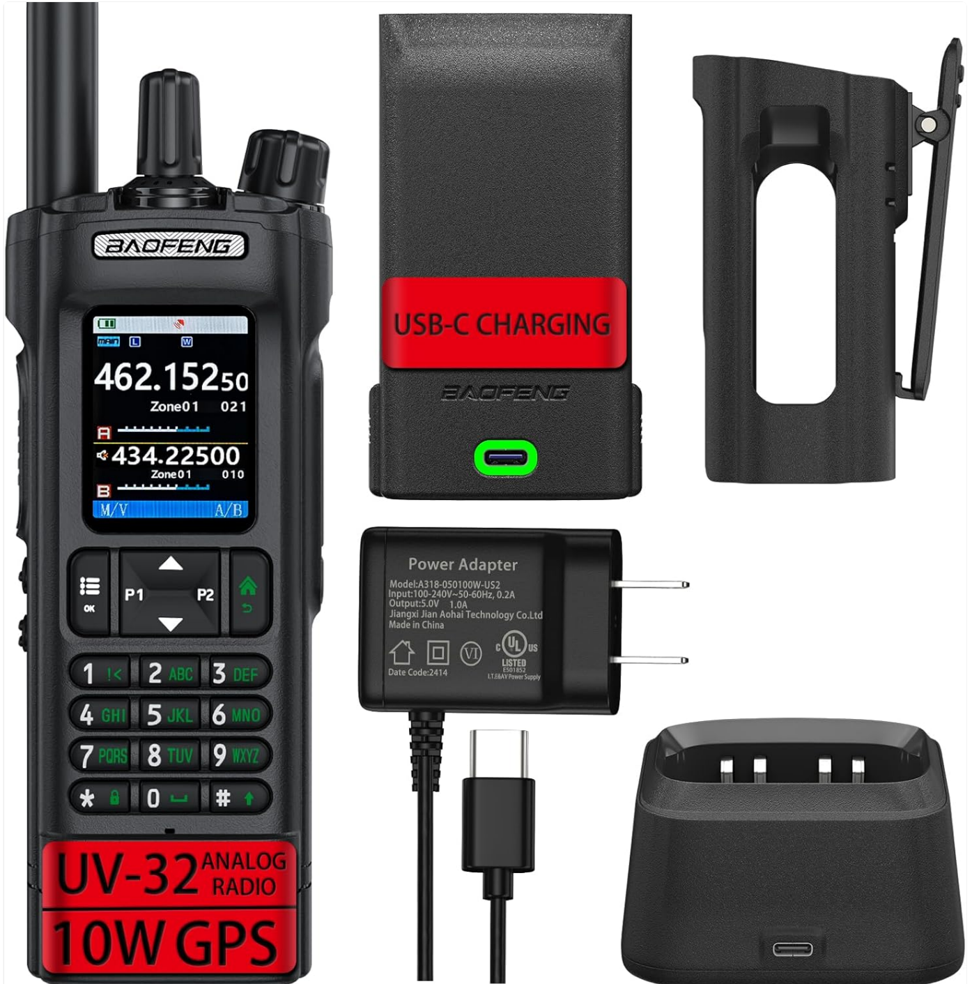
Image: The BAOFENG UV-32 radio with its back clip, demonstrating portability.