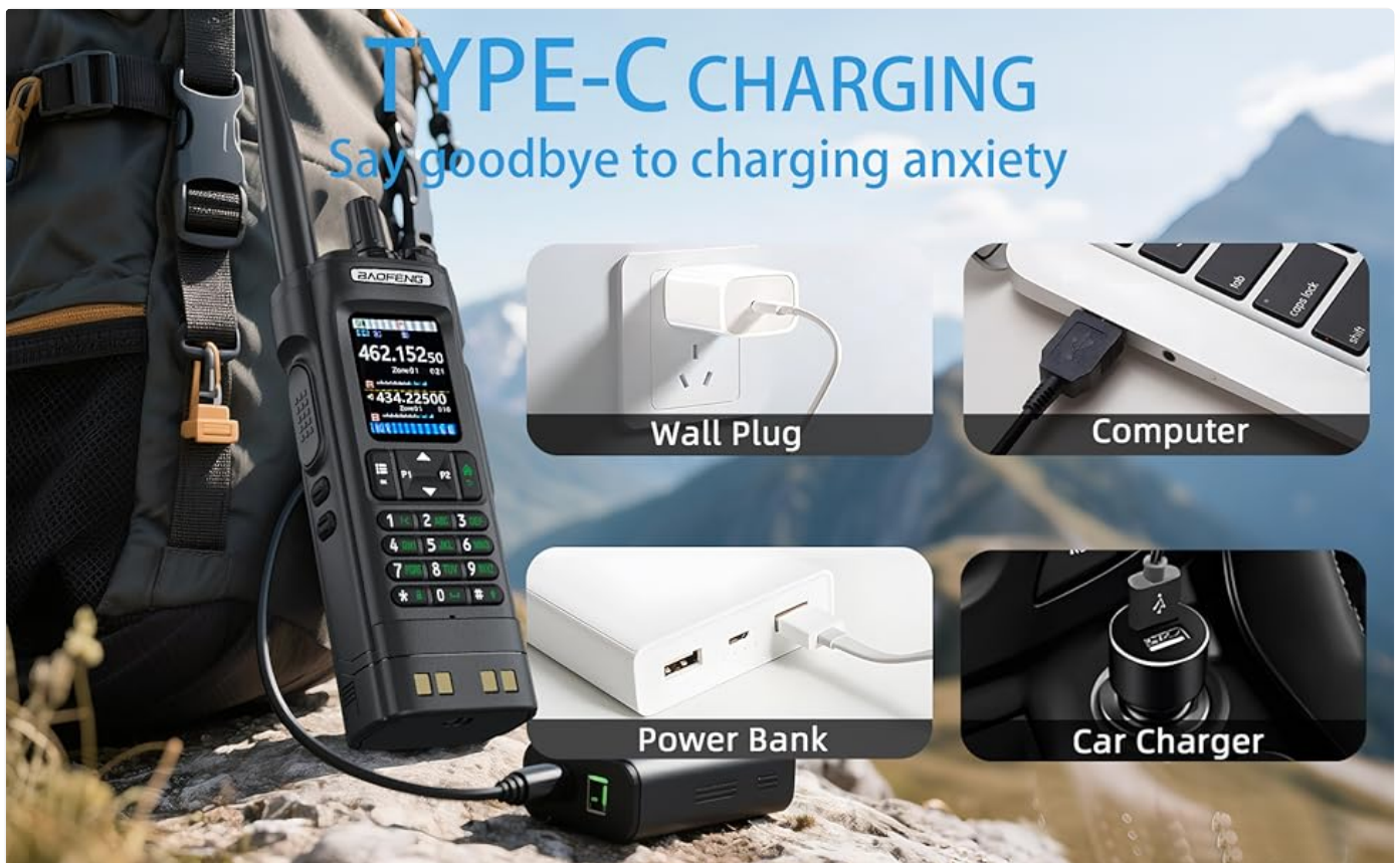
Image: Demonstrates the versatility of Type-C charging for the BAOFENG UV-32.

Charge the battery fully before first use. A full charge typically takes several hours.