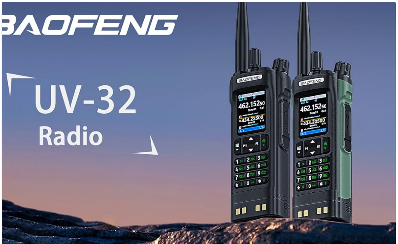
Image: The BAOFENG UV-32 Ham Radio, showcasing its display and robust design.

This manual provides comprehensive instructions for the operation and maintenance of your BAOFENG UV-32 Ham Radio. Please read this manual thoroughly before using the device to ensure proper function and safety.