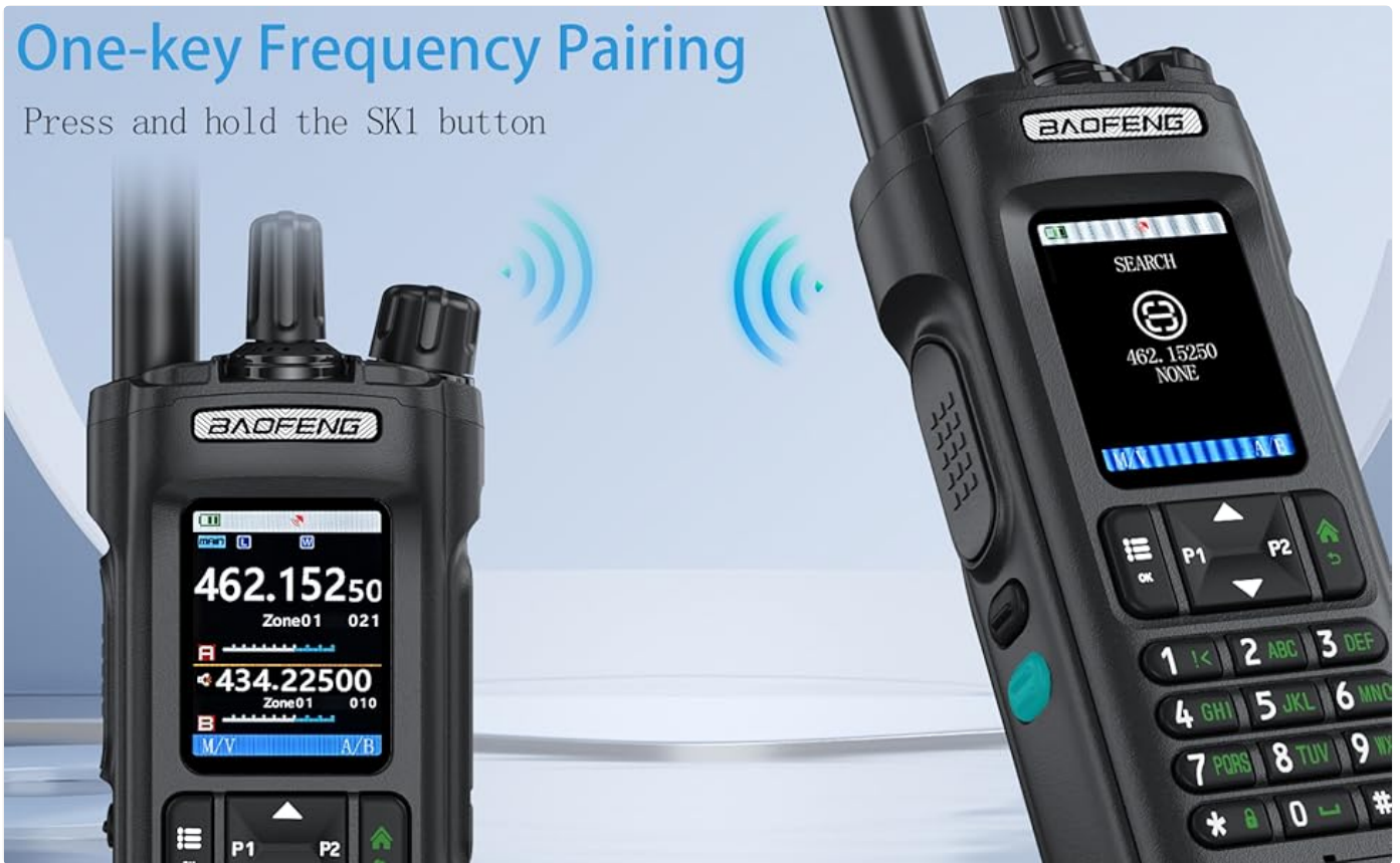
Image: Illustration of the one-key frequency pairing feature between two BAOFENG UV-32 radios.