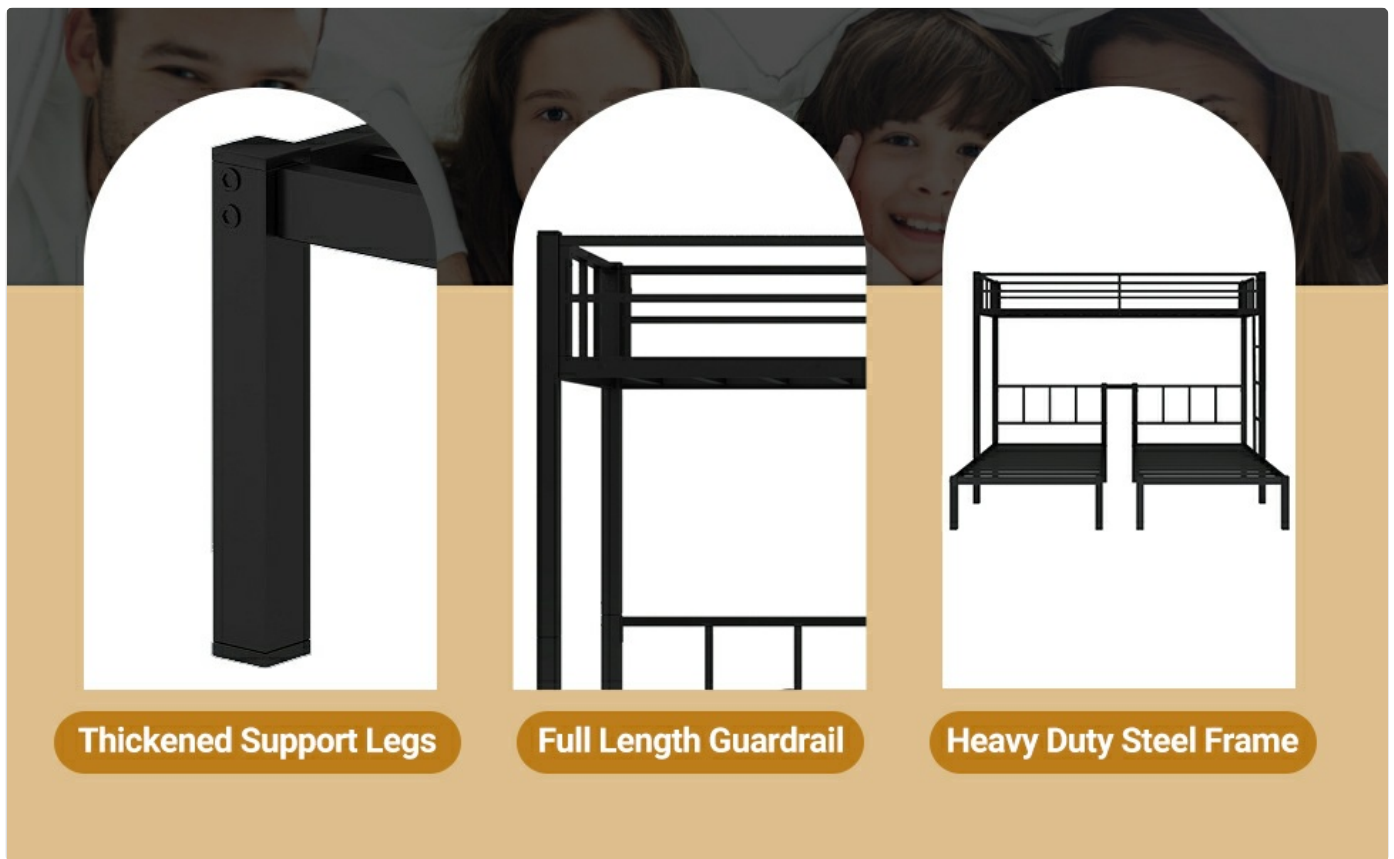
Image: Illustration of the bunk bed's robust metal construction, indicating a 250 lbs weight capacity for the upper bed and 350 lbs for each of the two lower beds.