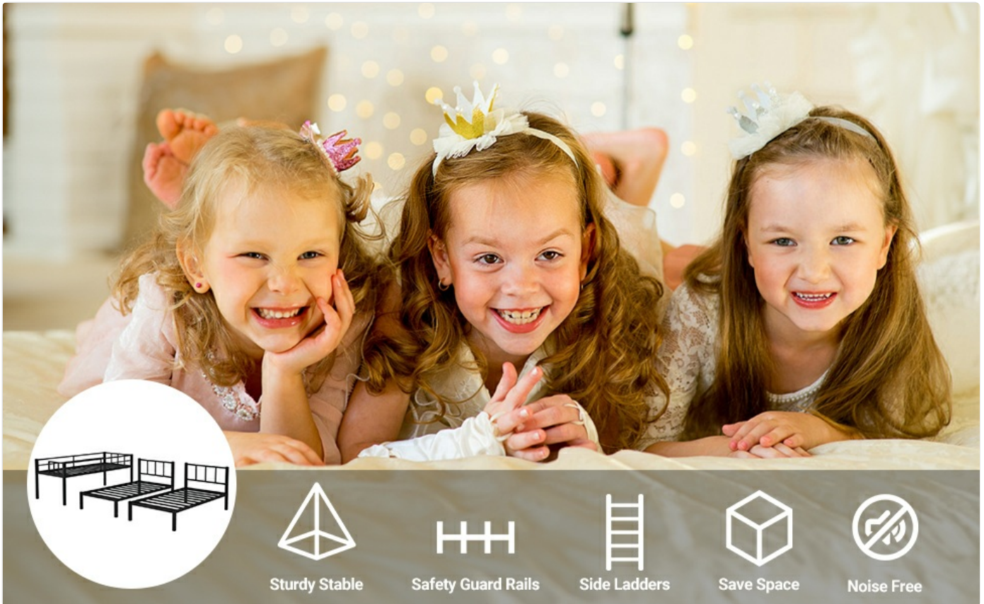
Image: The Zevemomo Triple Bunk Bed in its assembled configuration, demonstrating the upper twin XL bed and the two lower twin beds, designed for efficient space utilization.