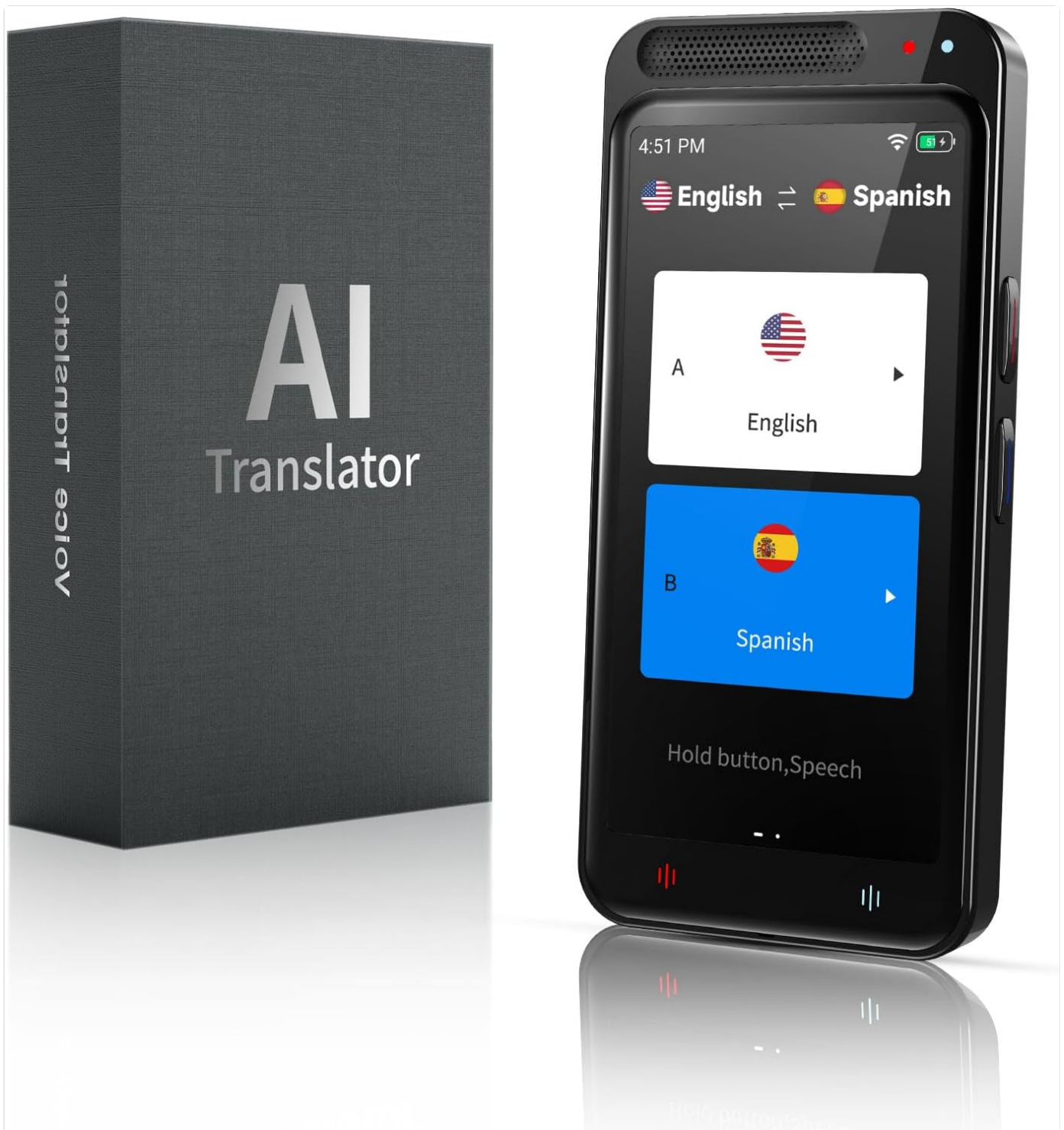
Figure 5.1: The translator device screen showing the interface for English to Spanish voice translation, with input and output fields clearly visible.