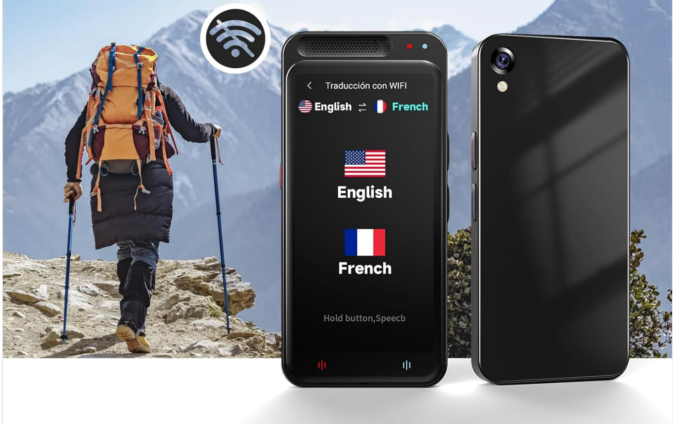
Figure 5.2: The translator device displaying its offline translation capability, with English and French selected as language options, set against a scenic mountain backdrop.

supports offline translation in 17 major languages without Wi-Fi. If you need it in special cases, please download the data of the corresponding language in advance (requires network status) Offline language packs are limited to a few simple everyday phrases.