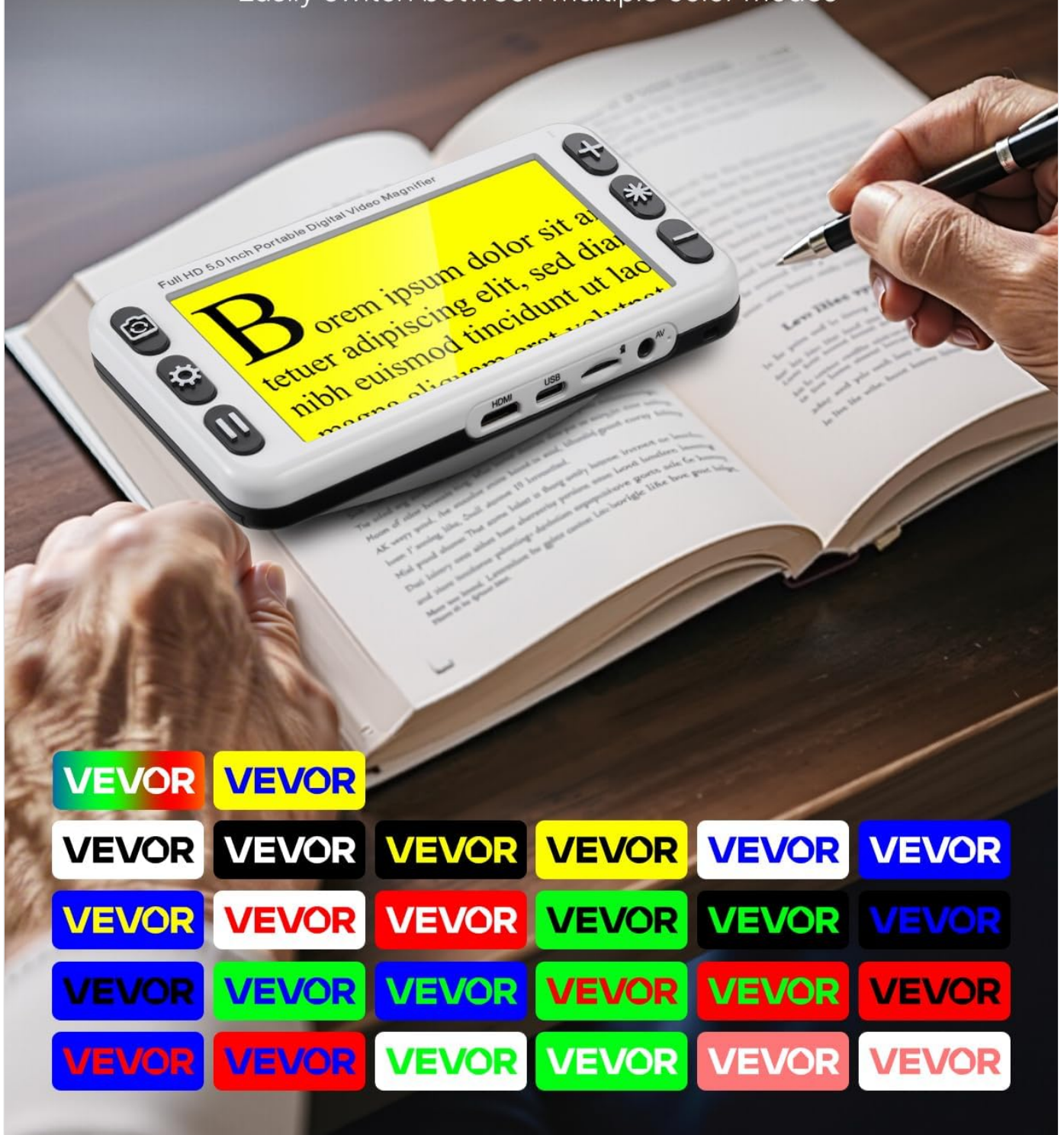
Figure 6.2: Available Color Modes

Easily switch between multiple color modes