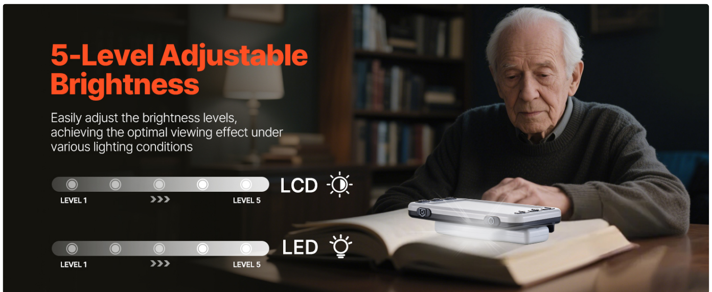
Figure 6.3: Adjustable Brightness Levels