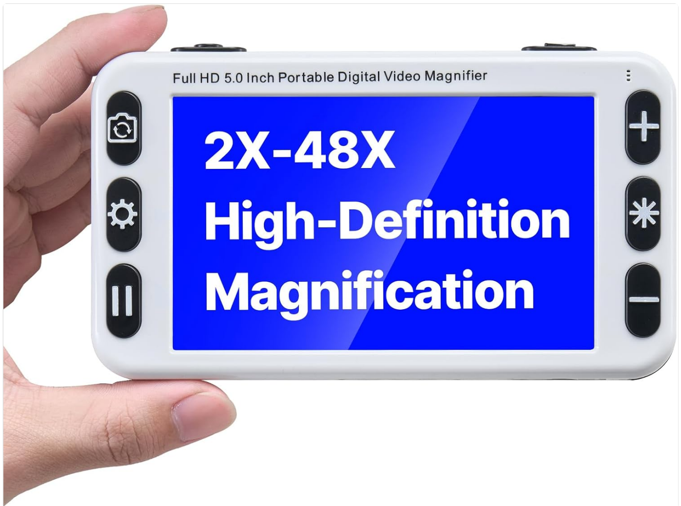
Figure 1.1: VEVOR Portable Digital Magnifier Overview