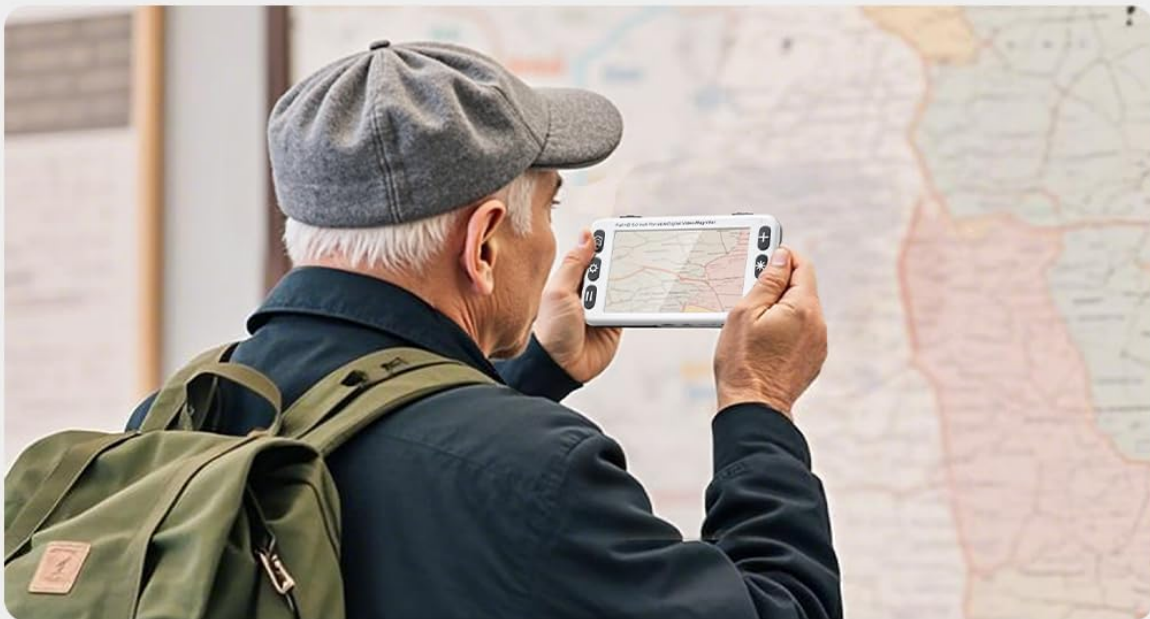
Far Focal Lens for Viewing