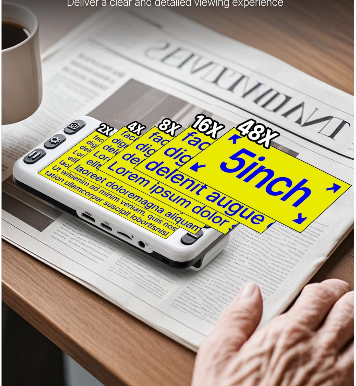
Figure 6.1: Magnification in Use

Deliver a clear and detailed viewing experience