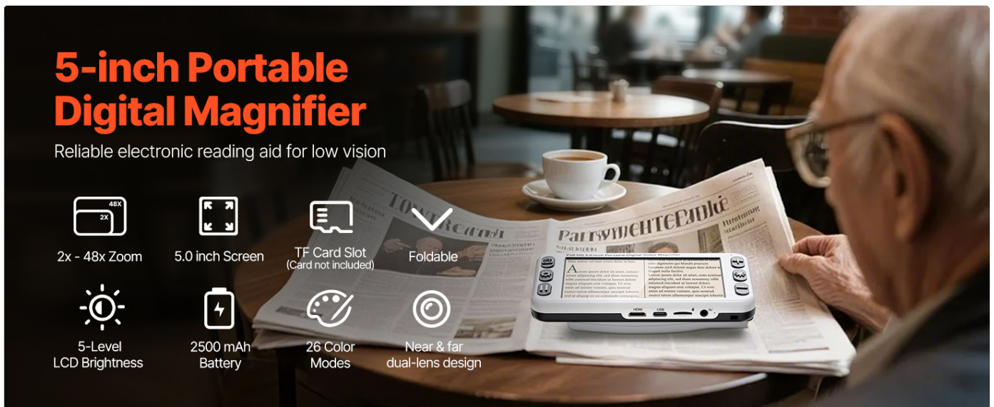
Figure 2.1: Key Product Features