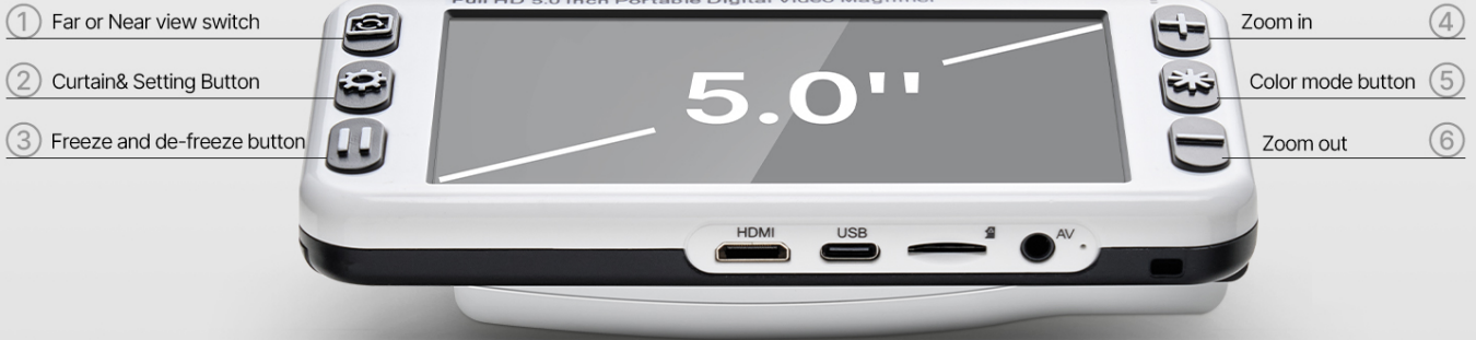
Figure 4.1: Device Controls and Ports