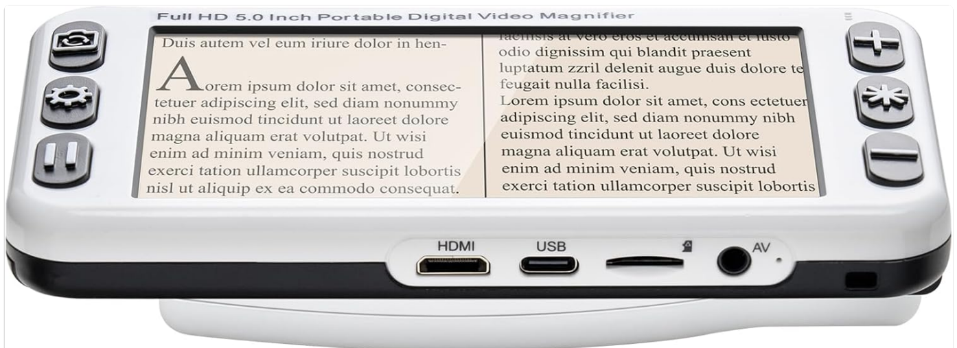
Figure 4.2: Side Ports (HDMI, USB, TF Card, AV)