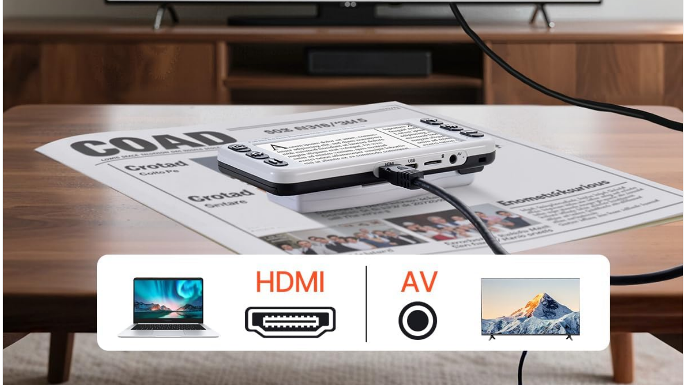
Figure 6.6: AV & HDMI Dual Ports Connection

odio dignissim luptatum zzril feugait nulla f Lorem ipsum adipiscing elit euismod tincid magna aliquar enim ad mmir exerci tation u nisl ut aliquip Lorem ipsum adipiscing elit