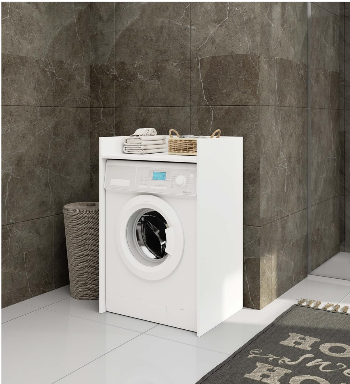
Image 1.1: The AKORD Washing Machine Cabinet installed in a bathroom, providing a clean and organized look around a washing machine.