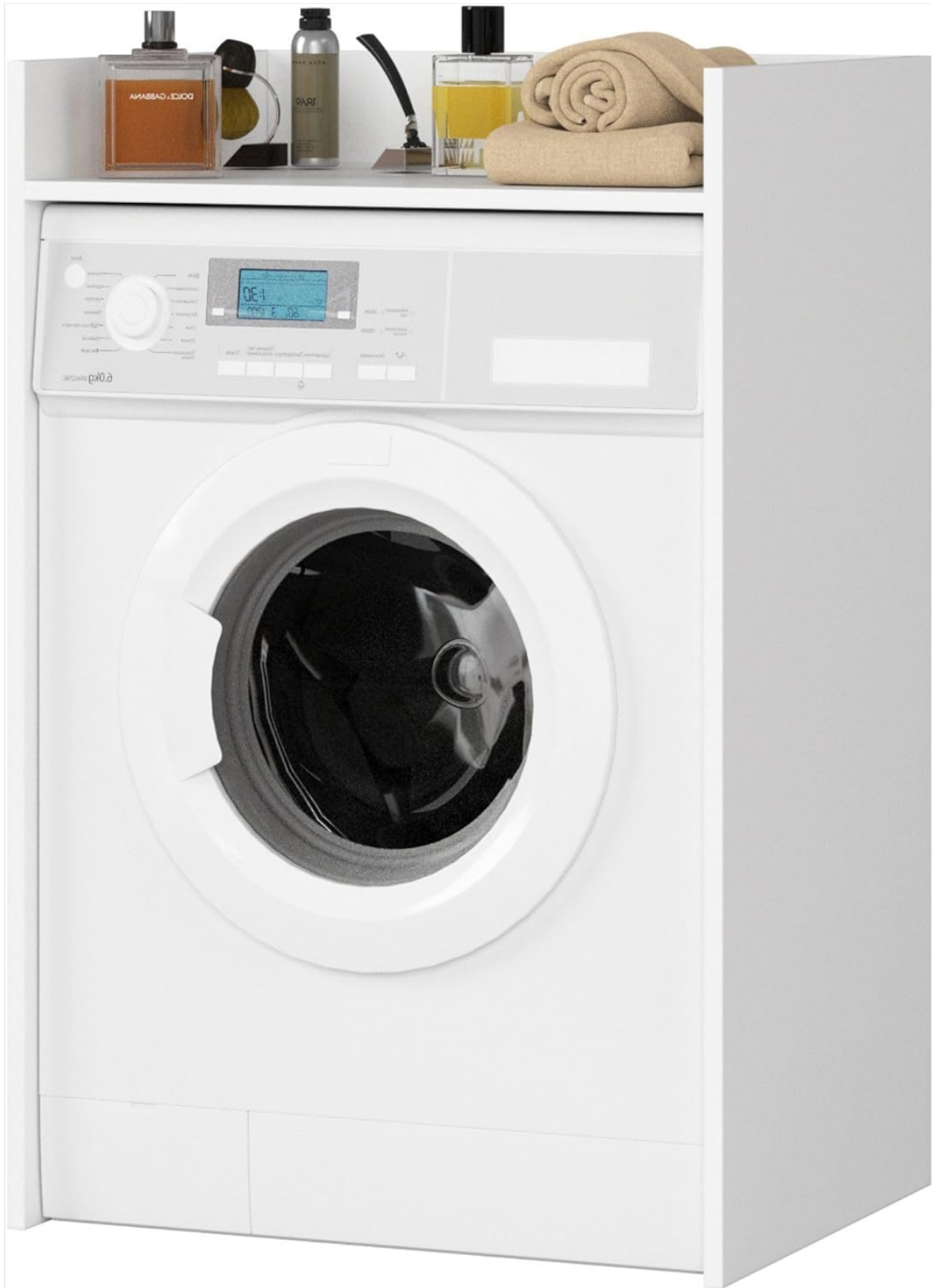
Image 4.1: A close-up view of the cabinet's top shelf, demonstrating its use for storing toiletries and folded towels, enhancing bathroom organization.