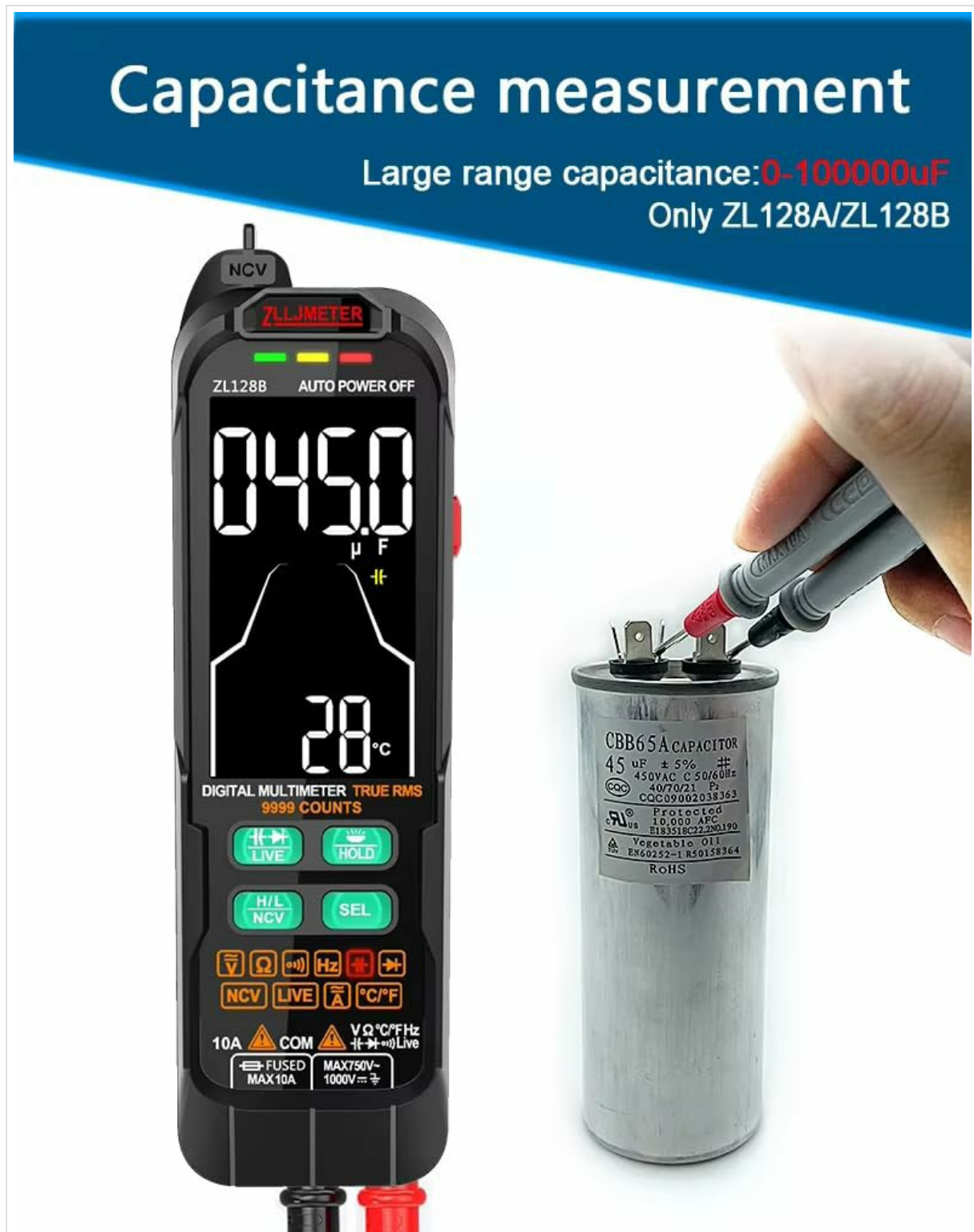
Figure 5: Measuring Capacitance. Always discharge capacitors before measurement.