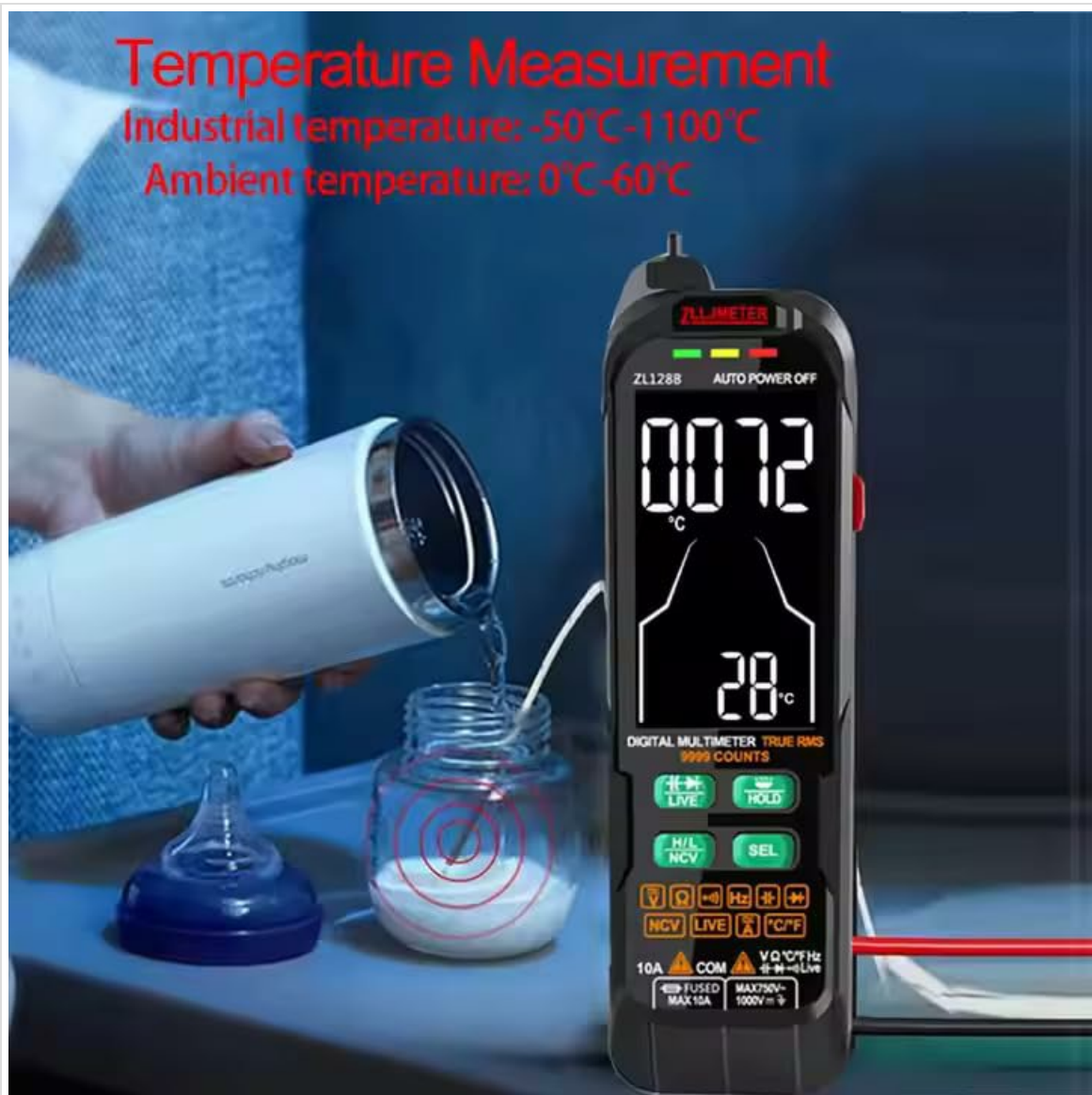
Figure 7: Measuring temperature using the included thermocouple probe.