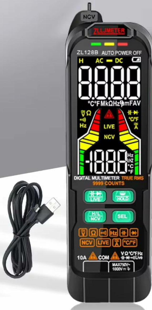
Figure 1: ZLLJMETER ZL128B Digital Multimeter with included accessories.