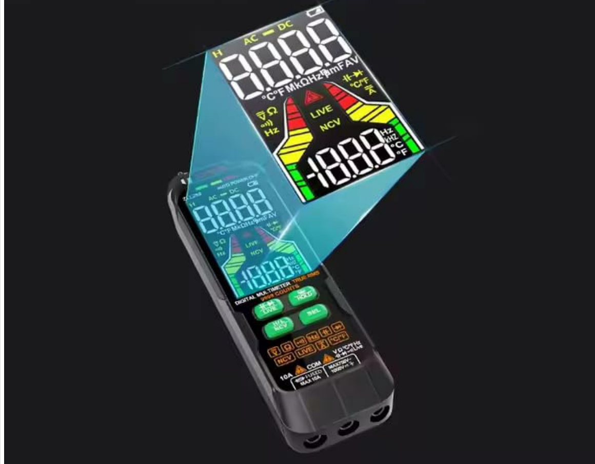
Figure 2: The ZL128B features a large, backlit color display for clear readings in various lighting conditions.

With backlight, when the light is dim, it is convenient to use at night