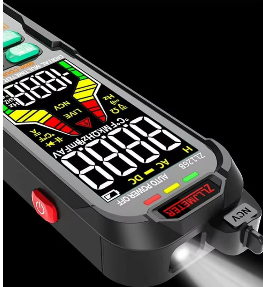
Figure 6: The integrated LED flashlight assists in low-light conditions.

The meter has a flashlight to help you illuminate and use when measuring in dark environments