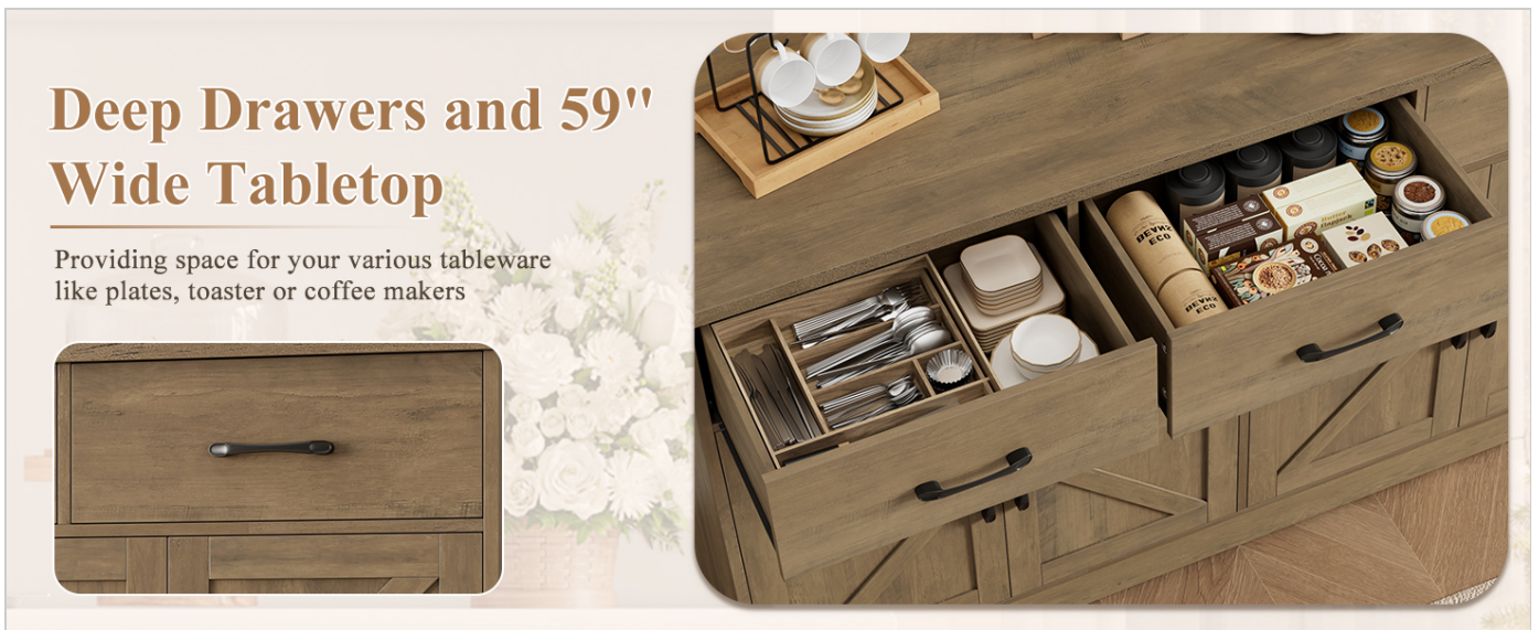
Image: Depiction of the cabinet's ample storage space, showcasing adjustable shelves and various items that can be stored, such as plates, tableware, and small appliances.