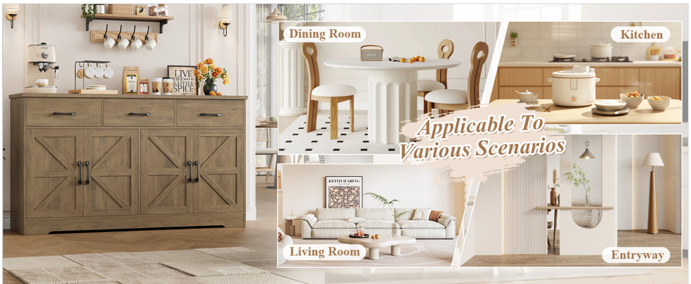
Image: Visual examples of the cabinet's versatility, showing it placed in a dining room, kitchen, living room, and entryway.