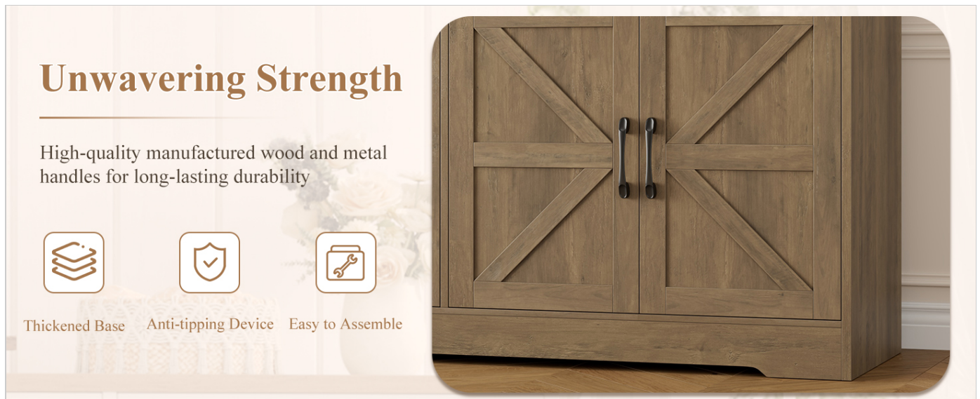
Image: Illustration of the cabinet's sturdy construction, including a thickened base, anti-tipping device, and ease of assembly.