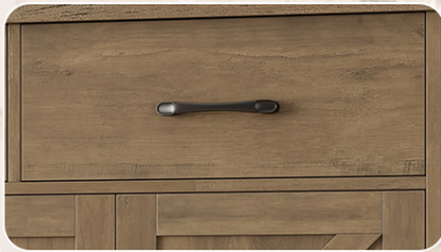
Image: Close-up view of the deep drawers and wide tabletop, illustrating their capacity for storing cutlery, small items, and accommodating kitchen appliances.

Providing space for your various tableware like plates, toaster or coffee makers