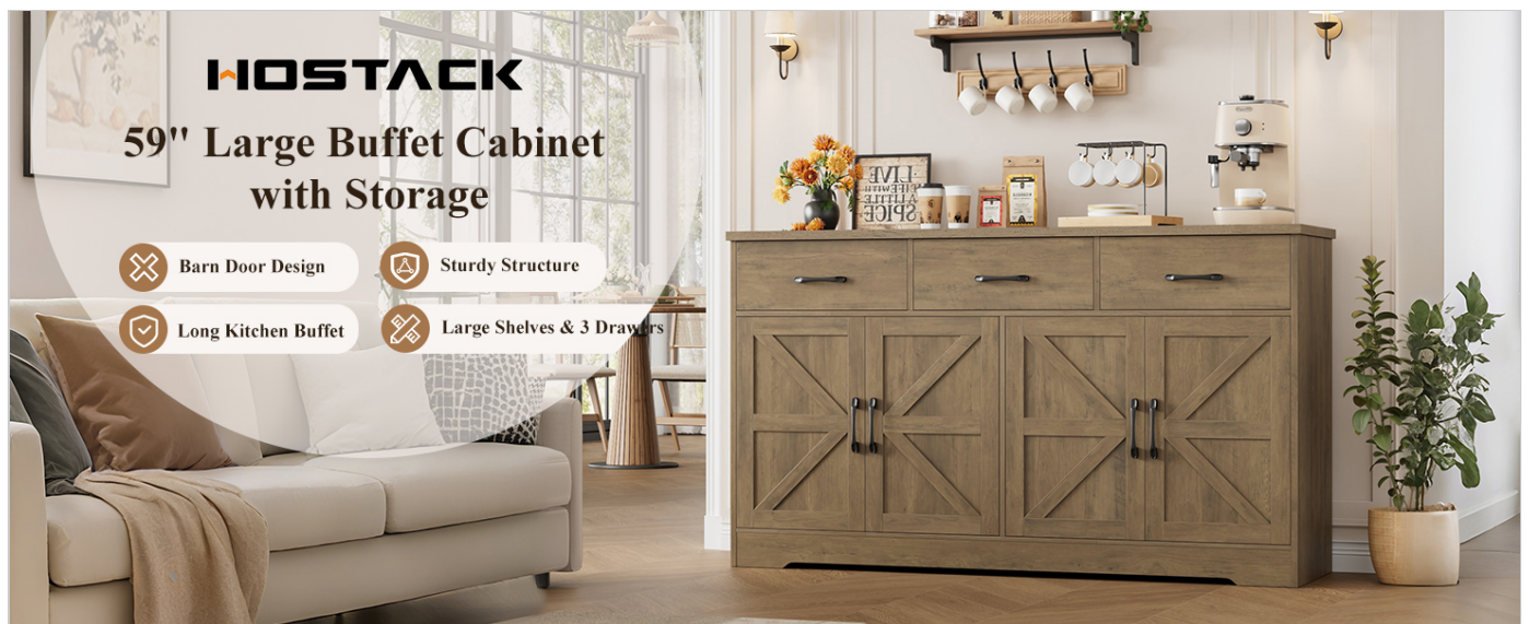
Image: Overview of the HOSTACK 59-inch Large Buffet Cabinet, highlighting its design and storage capabilities.

The HOSTACK Farmhouse Buffet Cabinet is a versatile storage solution designed for various rooms, including dining rooms, kitchens, living rooms, and entryways. This cabinet features a rustic brown finish with a wood-grained surface and barn-inspired door design, offering both aesthetic appeal and practical functionality.