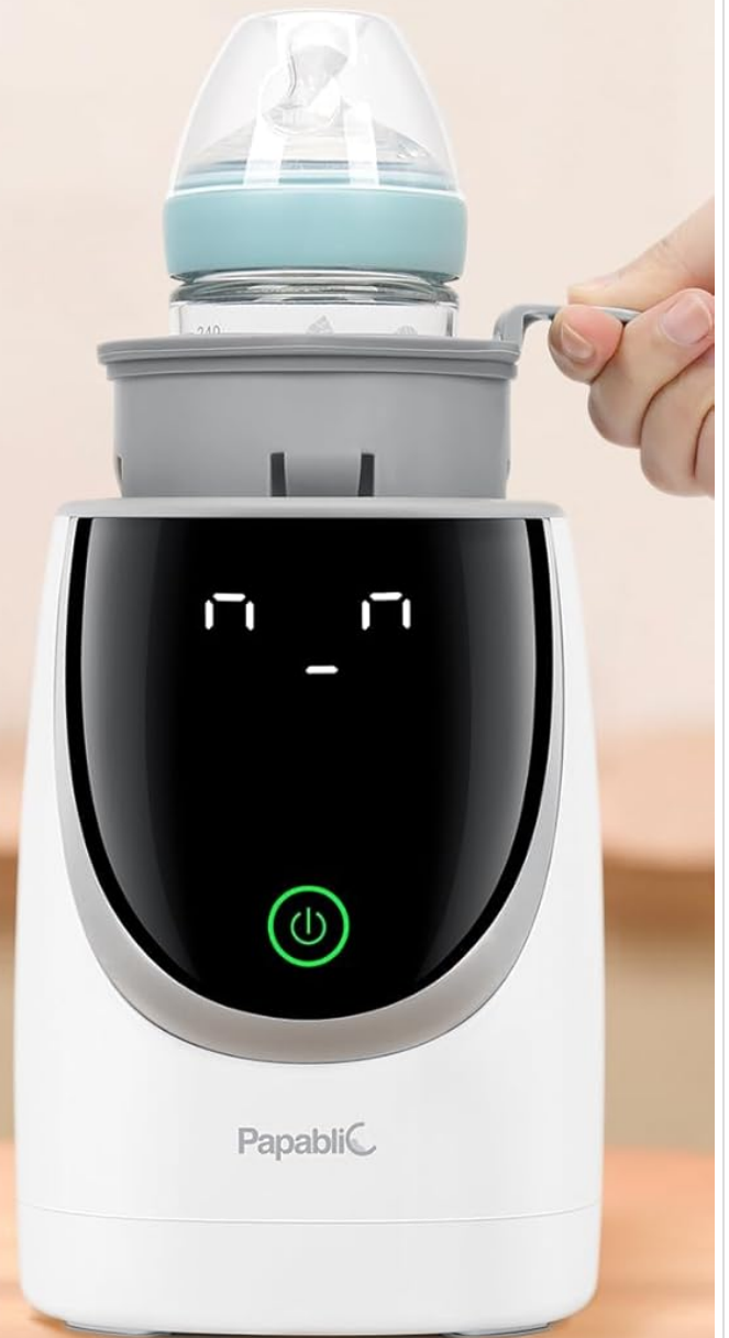
Image: The bottle warmer demonstrating compatibility with silicone, glass, plastic bottles, breastmilk bags, and baby food jars.

Your browser does not support the video tag.