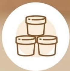
Baby Food Jars