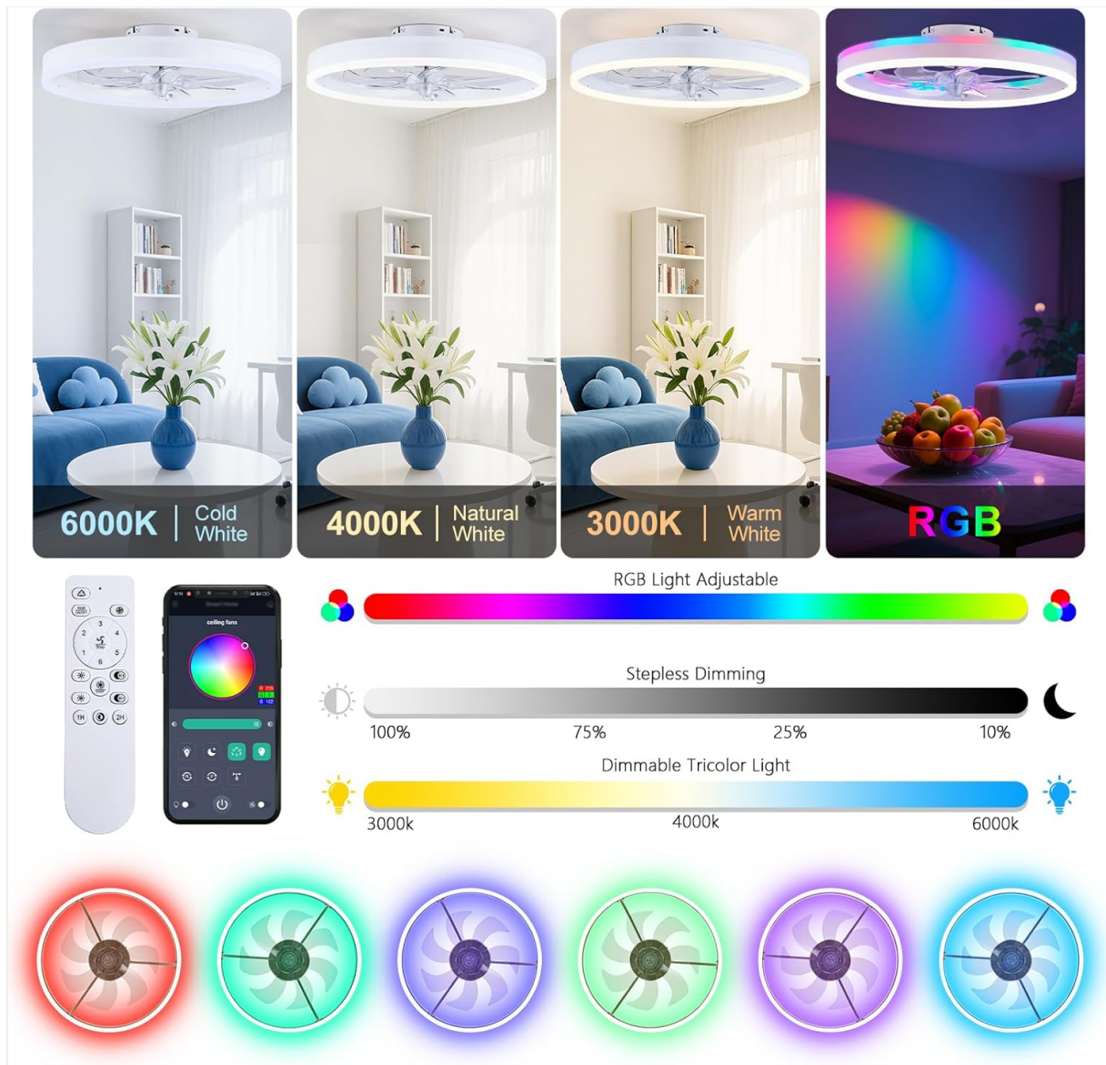
Figure 4.4.1: Dimmable Tricolor Light and RGB options.

The fan offers both functional and ambient lighting options: