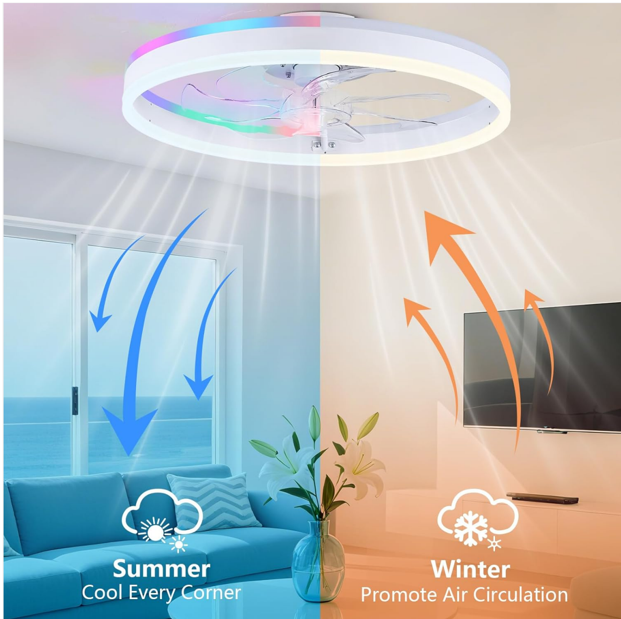
Figure 4.5.1: Year-round comfort with reversible motor.

The reversible motor allows for year-round comfort: