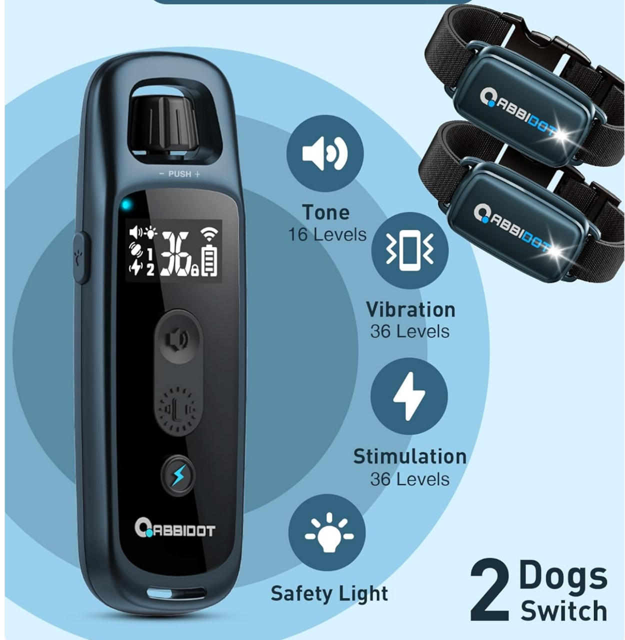
Image 4.1: Overview of the four training modes and dual-dog switch capability.