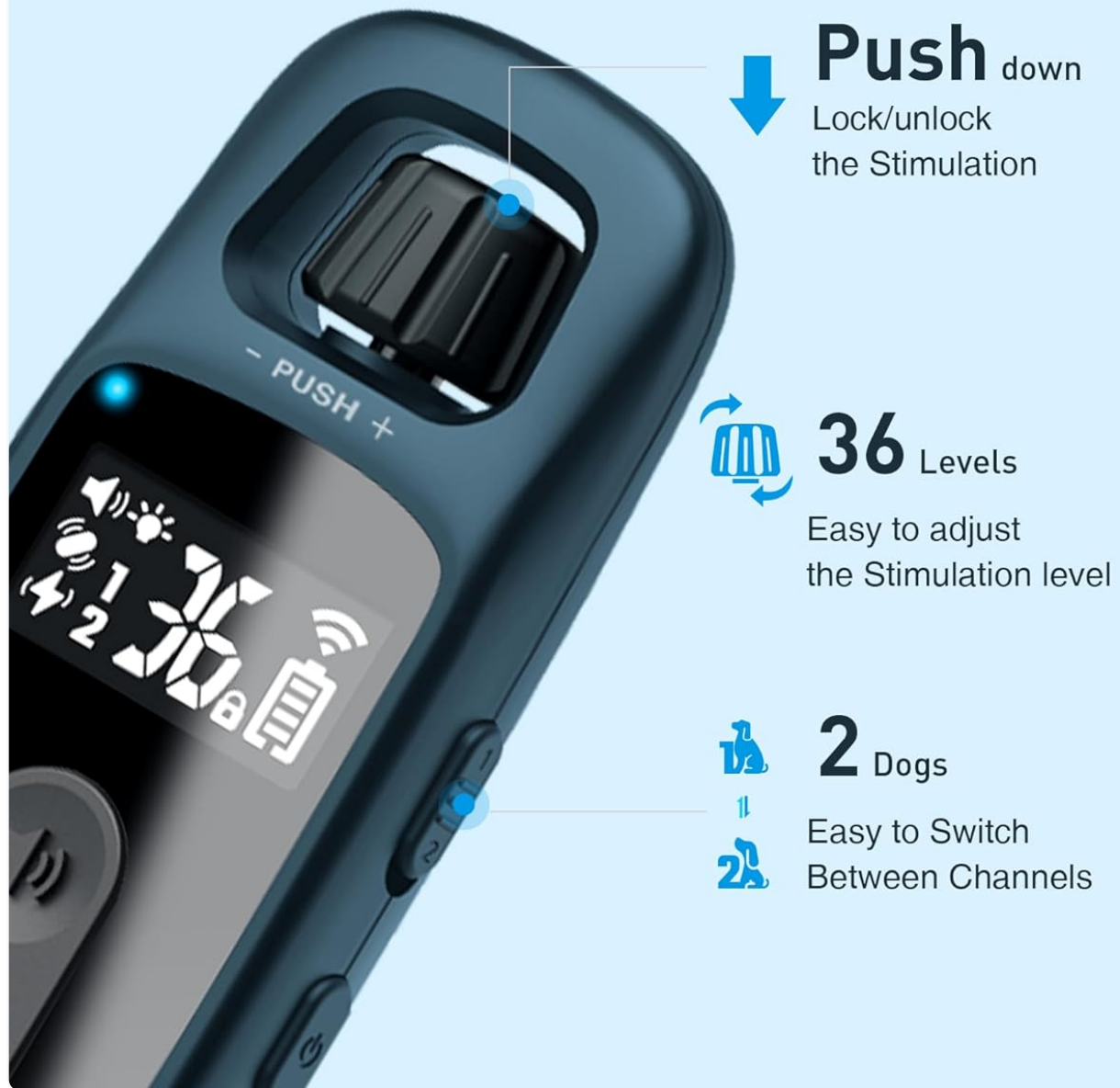
Image 6.1: The remote control features a security lock to prevent accidental static stimulation and easy level adjustment.