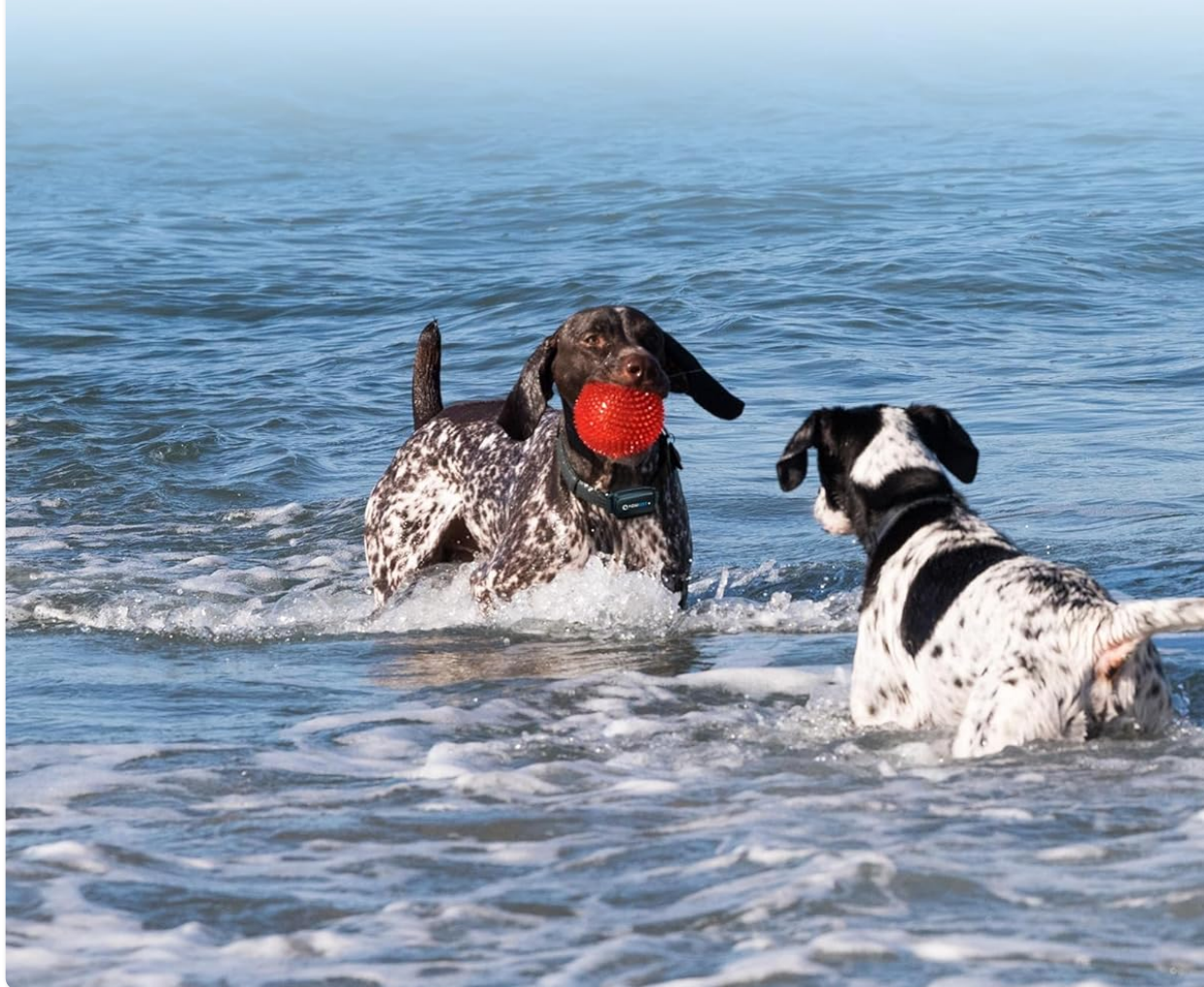
Image 4.2: The IPX7 waterproof receiver allows dogs to play freely in water.