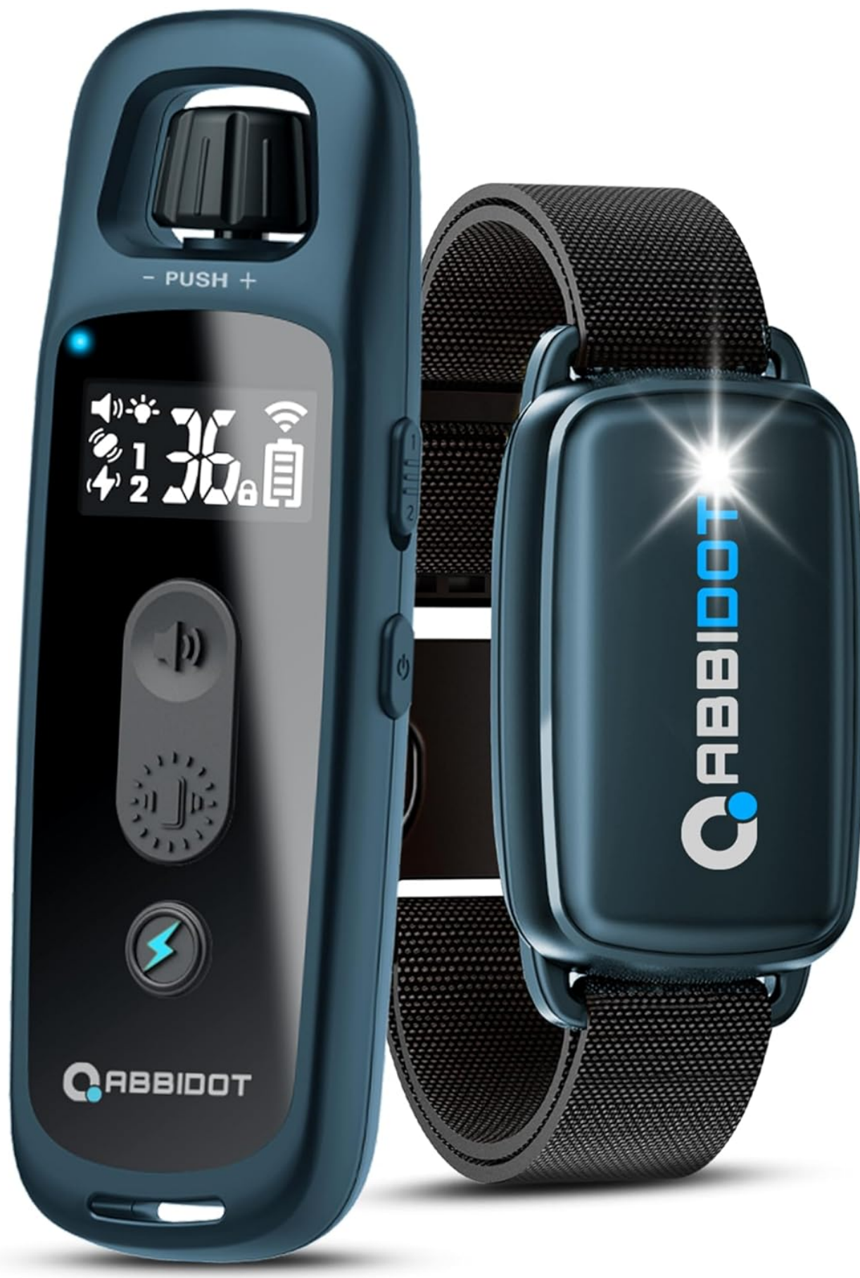
Image 1.1: The ABBIDOT Dog Training Collar system, featuring the remote control and the collar receiver.