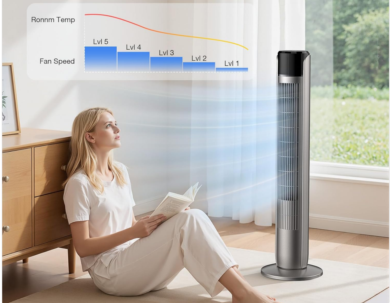
Figure 4.3: Automatic Wind Adaptation. This graphic illustrates how the fan's wind speed automatically adjusts to the room temperature in Auto Mode, providing optimal comfort.