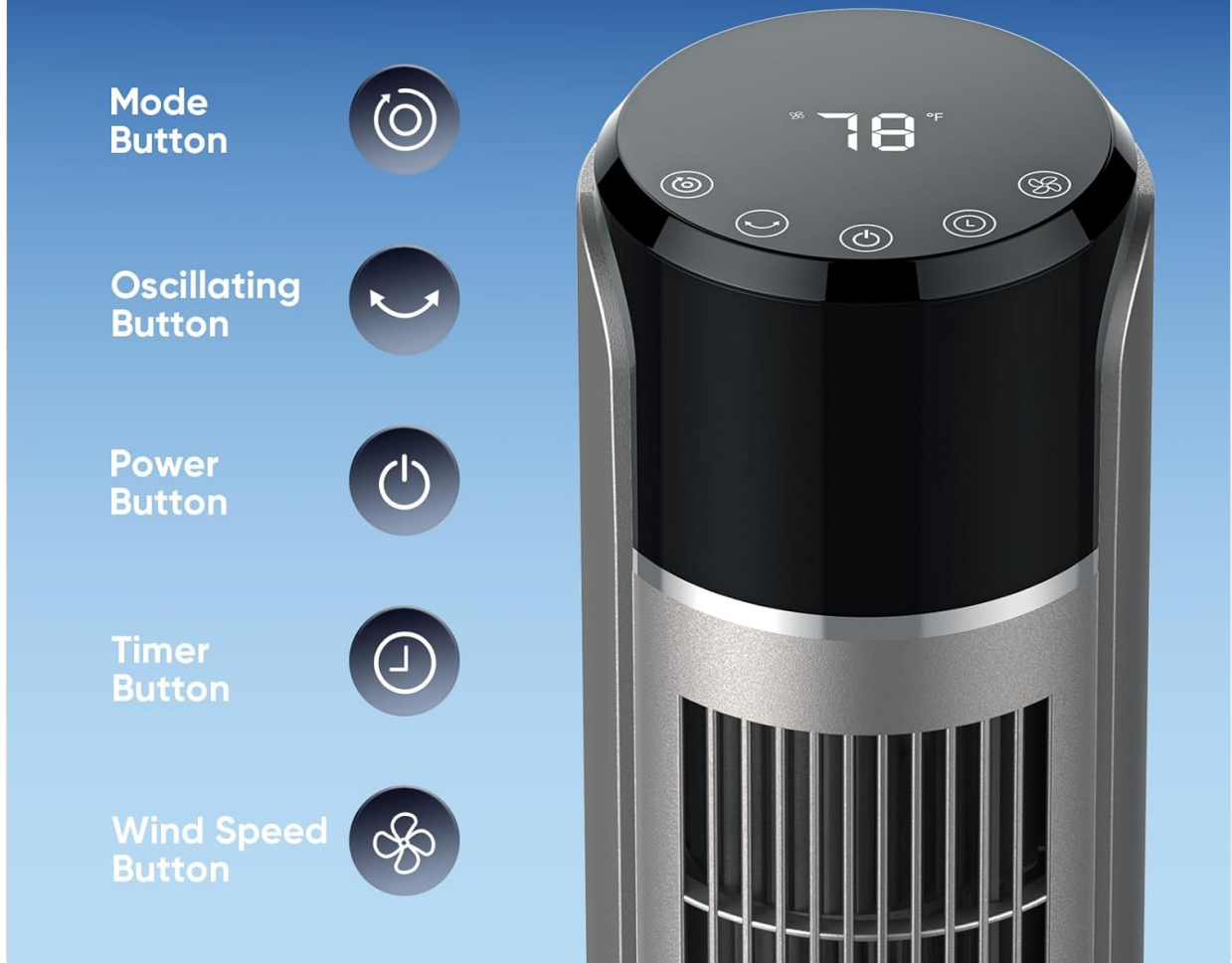
Figure 2.3: Large LED Control Panel. A close-up view of the fan's intuitive touch control panel, clearly labeling the Mode, Oscillating, Power, Timer, and Wind Speed buttons for easy operation.