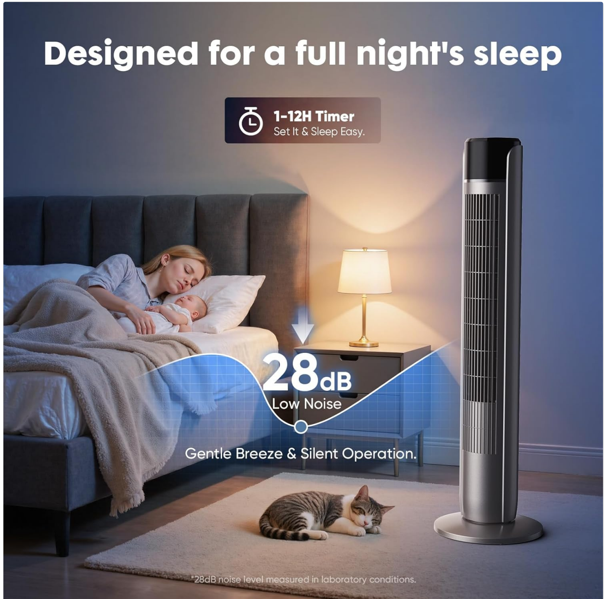
Figure 4.2: Sleep Mode Features. This image highlights the fan's quiet 28dB operation in Sleep Mode and the 1-12 hour timer function, ideal for a full night's sleep.