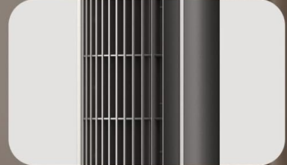
Fingertip Anti-Pinch Grille