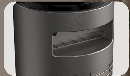
Base for Stability