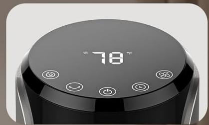
LED Control Panel