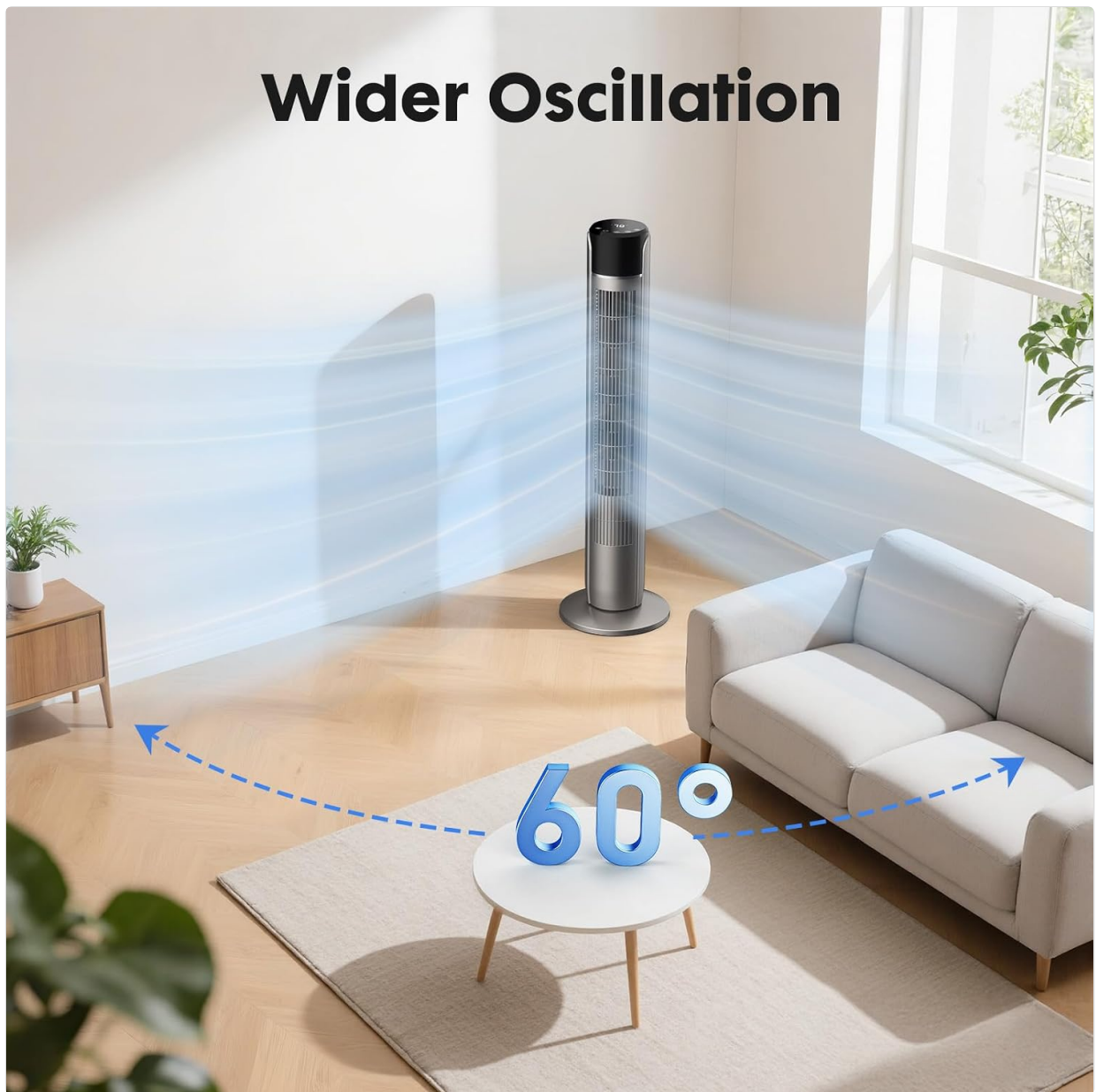
Figure 4.4: Wider Oscillation. This image demonstrates the fan's 60-degree oscillation, showing how it distributes airflow across a room for broader cooling coverage.