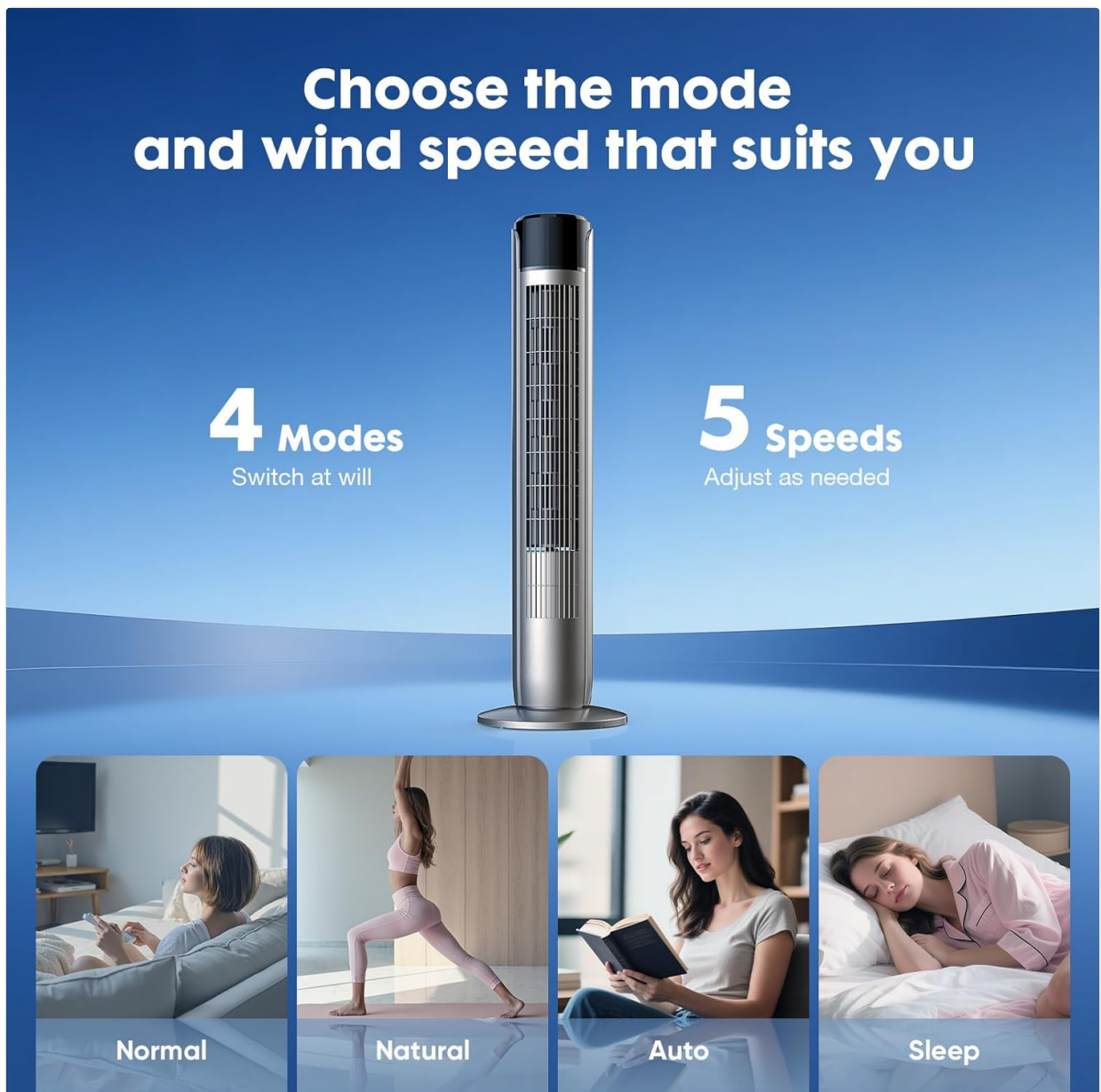
Figure 4.1: Fan Modes and Speeds. This image visually represents the four available modes (Normal, Natural, Auto, Sleep)

Choose from four distinct operating modes: Normal, Natural, Auto, and Sleep.