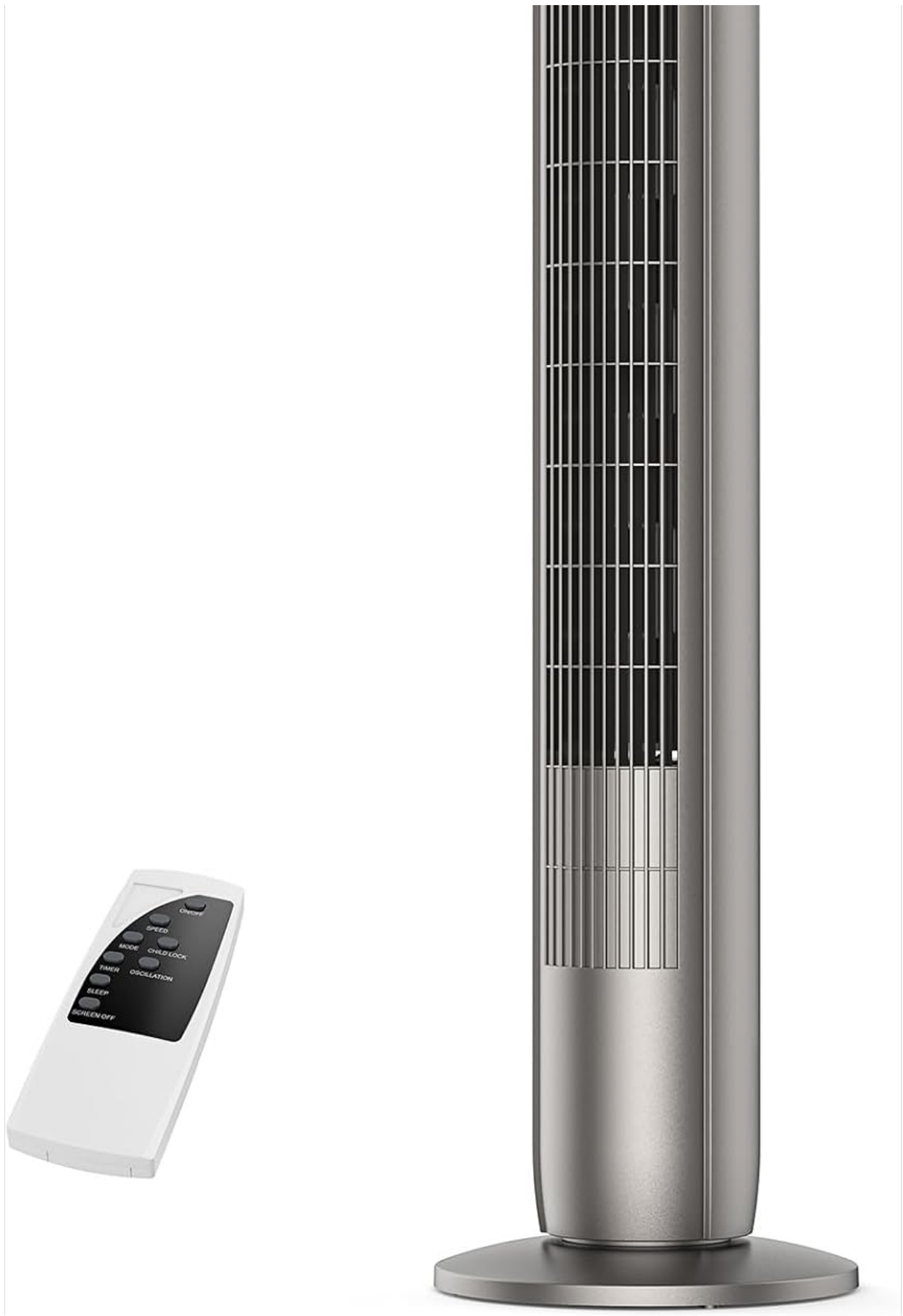
Figure 2.1: Sweetcrispy Tower Fan and Remote Control. This image shows the sleek design of the tower fan along with its included remote control, highlighting its modern aesthetic and ease of use.