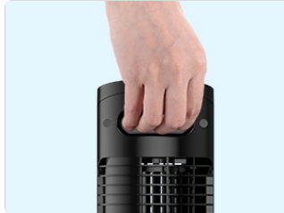
Figure 4.1: The fan features an integrated handle on the back for easy portability, allowing you to move it between rooms effortlessly.

The VCK TF009A tower fan comes pre-assembled and ready for use. Simply place it on a stable, flat surface and plug it into a standard electrical outlet.