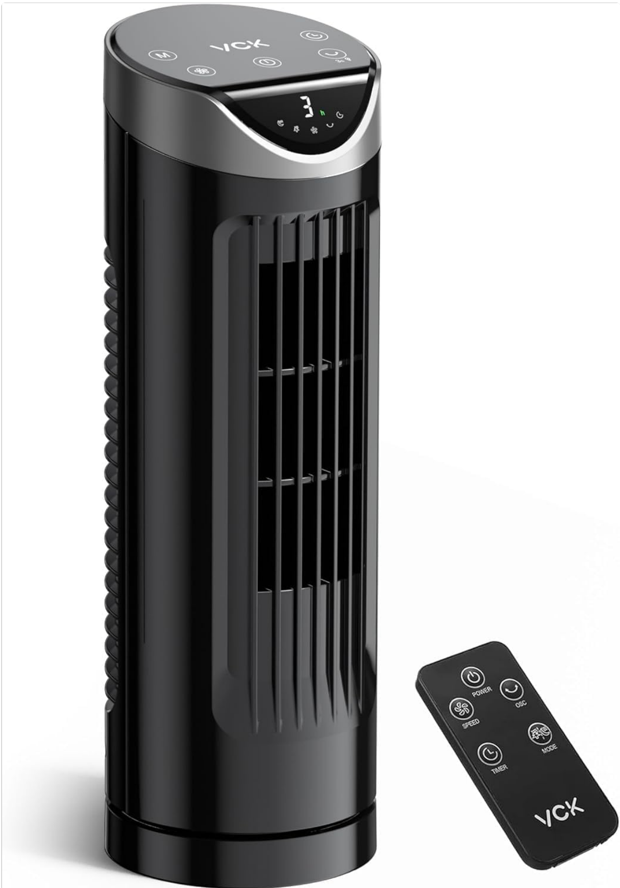
Figure 1.1: VCK TF009A 13-Inch Bladeless Tower Fan with remote control. This image shows the compact black tower fan with its sleek design and the included remote control.