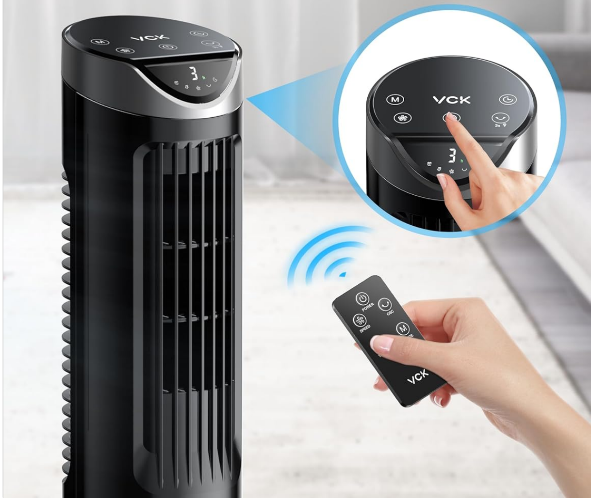
Figure 3.1: Illustration of the fan's touchscreen control panel and the included remote control. Both offer convenient ways to adjust settings.

The fan can be operated using the intuitive touchscreen panel located on top of the unit or with the provided remote control. The LED display shows current settings.