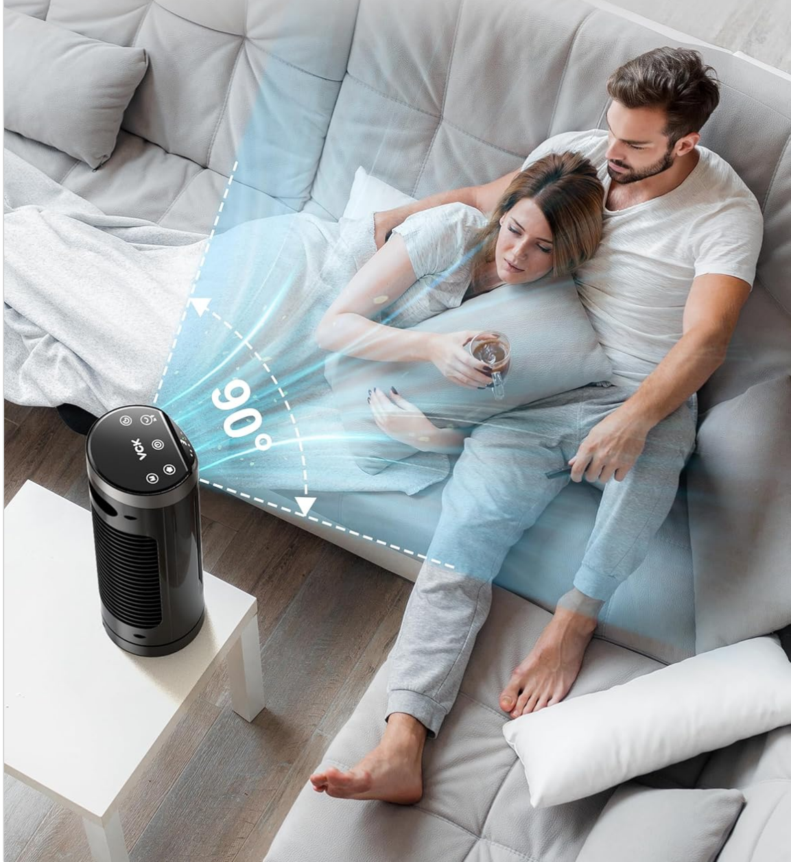
Figure 5.1: The fan's 90-degree oscillation feature ensures wide air distribution, effectively cooling a larger area.

The latest fan blade design and 90° wide-angle Swing Can Achieve a Wider Range of Cooling, Covering Every inch of your space