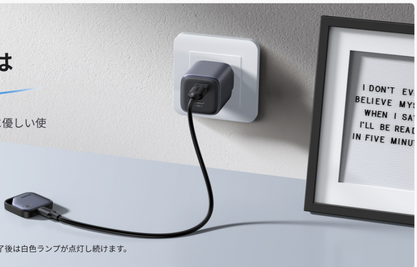
Image: The UGREEN FineTrack Smart Finder connected to a USB-C charger plugged into a wall outlet, illustrating its rechargeable feature.

注：充電中は赤色ランプが点灯し続けます。充電完了後は白色ランプが点灯し続けます。