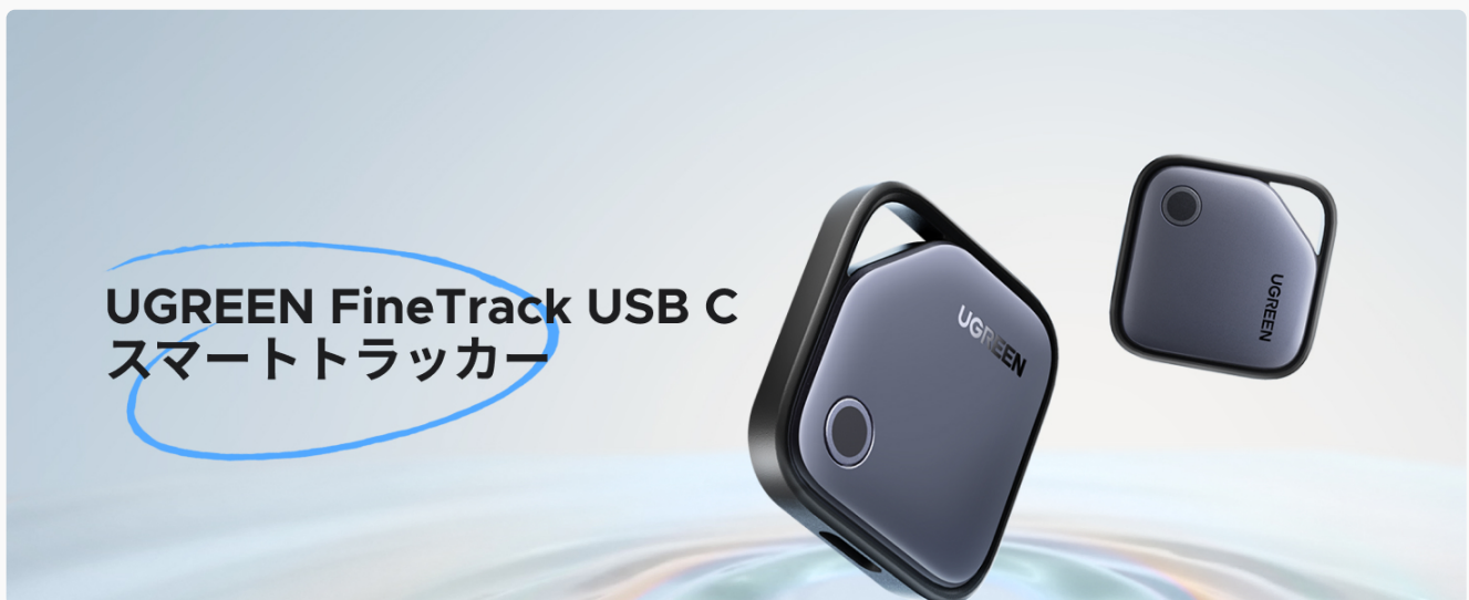
Image: UGREEN FineTrack Smart Finder product banner, showing the device and its name.

The UGREEN FineTrack Smart Finder is a compact, rechargeable tracking device designed to help you locate your personal items. It integrates seamlessly with Apple's Find My network, allowing iOS users to track their belongings globally. This manual provides essential information for the safe and effective use of your Smart Finder.