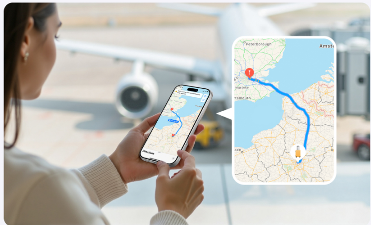
Image: An iPhone displaying the Find My app with a map showing directions to a lost item, such as luggage at an airport.

「経路」をタップすると、そのアイテムの正確な位置が表示され、紛失したアイテムを素早く見つけることができます。