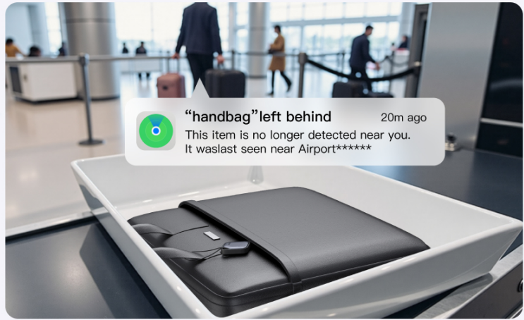
Image: An iPhone displaying a "handbag left behind" notification, showing the item was last seen near an airport, preventing loss.