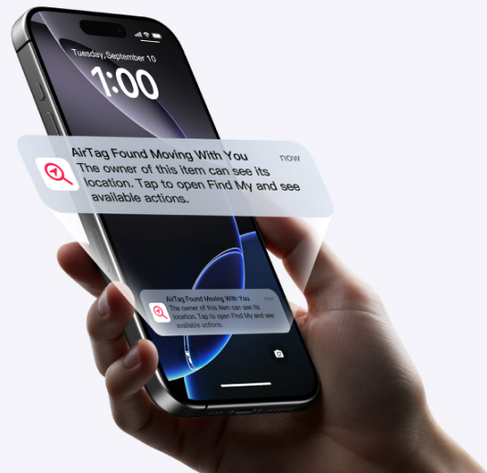
Image: An iPhone displaying a notification about an unknown tracker (similar to AirTag) found moving with the user, highlighting the anti-stalking feature.