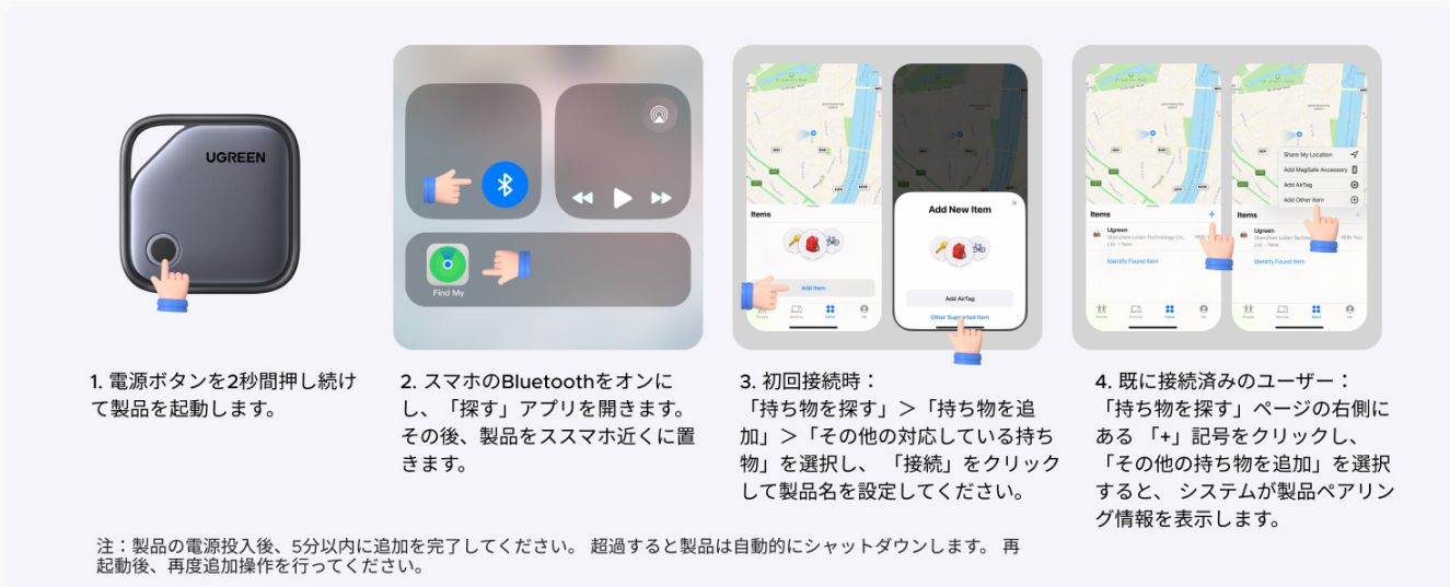
Image: Visual guide for connecting the UGREEN FineTrack Smart Finder to the Apple Find My app, showing an iPhone screen with pairing instructions.

Note: The product must be added within 5 minutes of powering on. If not added within this time, the product will automatically shut down. Restart the device and repeat the process if this occurs.