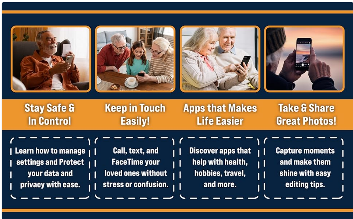
Image: Visual representation of the guide's coverage, including security, communication, app discovery, and photography tips.