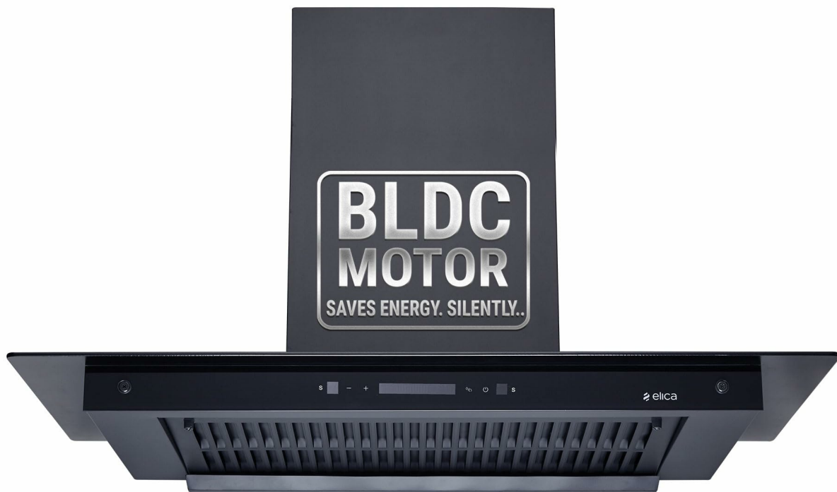
Figure 2.1: Elica 90cm BLDC Filterless Autoclean Kitchen Chimney, front view.