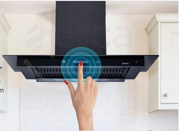
Figure 4.2: Demonstrating motion sensor control for fan speed adjustment.

Control the power, fan speed and lights with the touch of a button. Choose from high, medium and low suction.