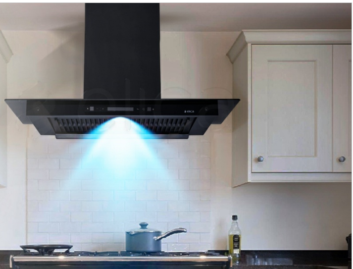
Figure 4.3: The integrated LED lamp illuminating the cooking surface.

The kitchen chimney features LED lamp, providing bright and efficient lighting. This energy-saving LED enhances visibility and create a pleasant ambiance while you cook.